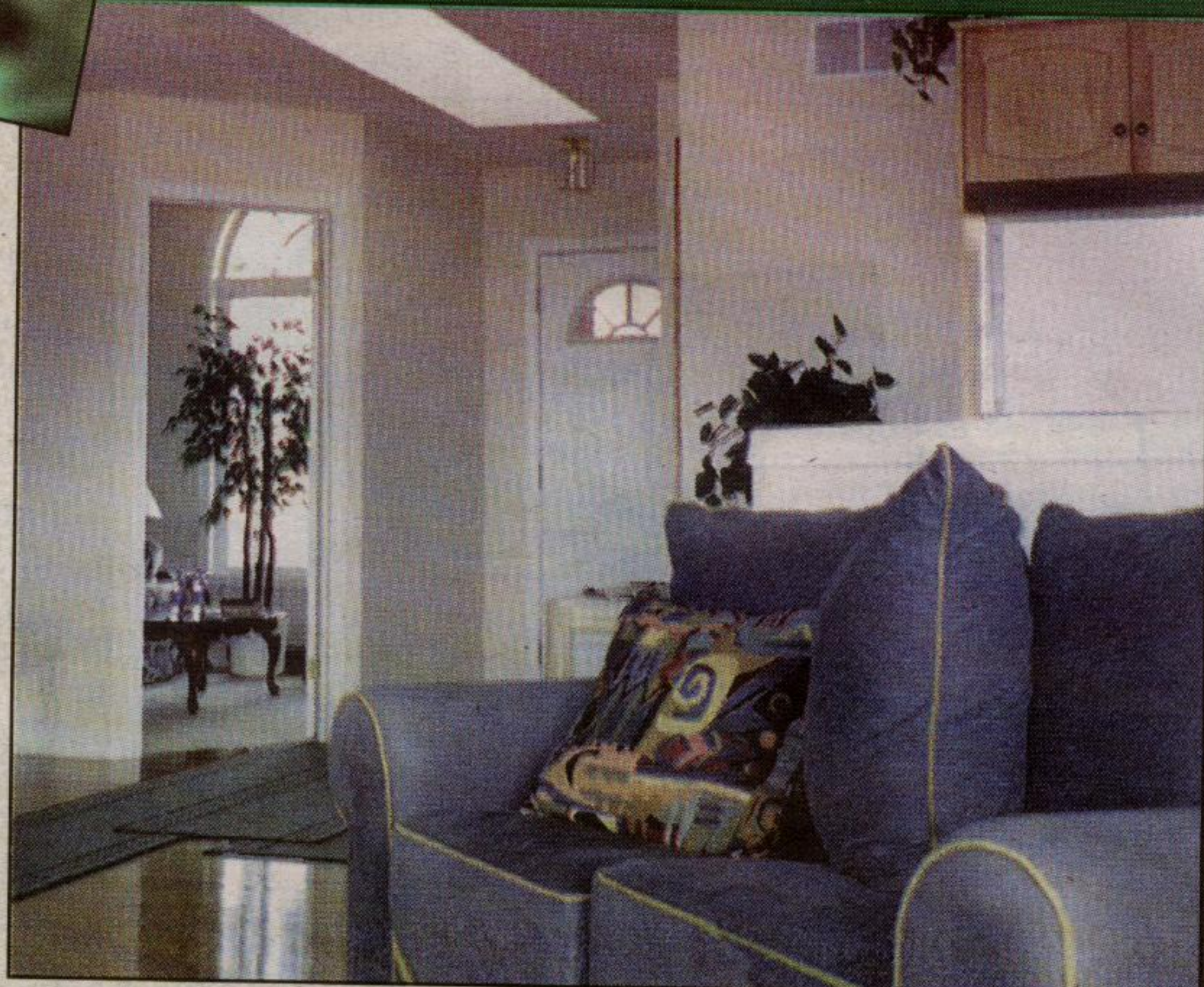
Prices subject to change without notice. Some photos are from the previous model.

YOU ARE NEVER TOO FAR FROM MODERN AMENITIES, GREAT NATURE TRAILS, FRESH AIR & OPEN SPACES.