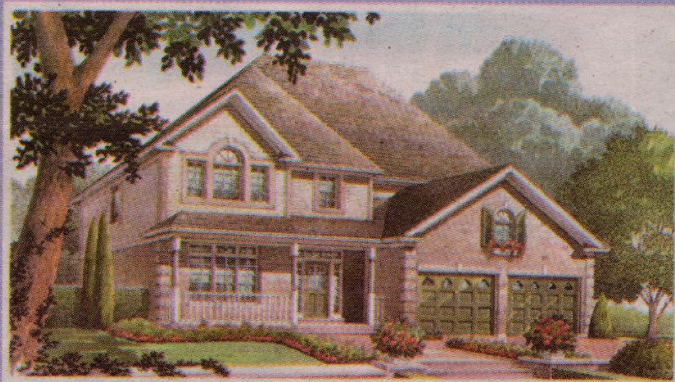
The Ellery from $262,400

You Will Come for the Price You Will Stay For the Lifestyle!