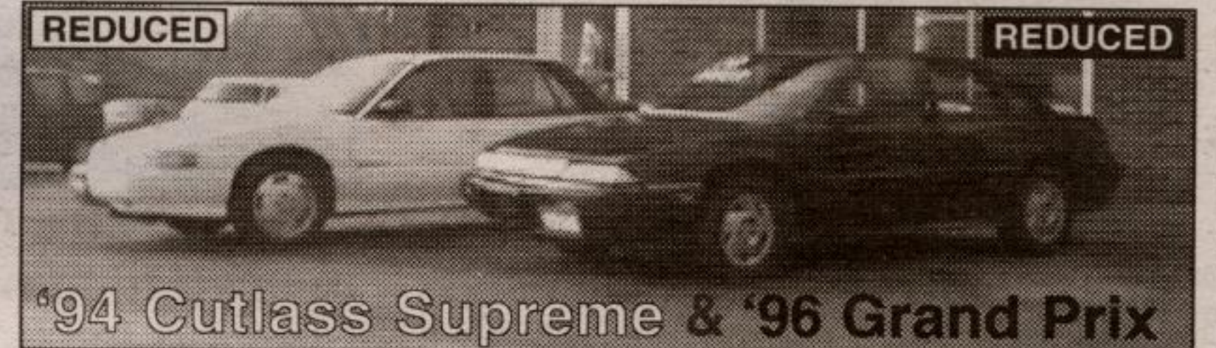
'94 Cutlass Supreme & '96 Grand Prix