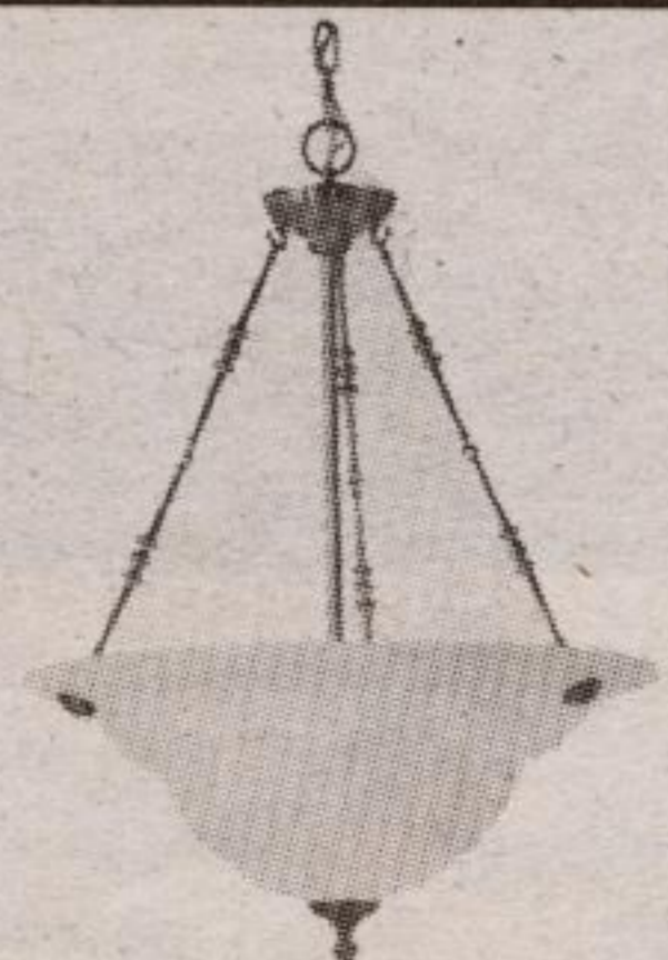
22" d. Pendant $299.99

©™ Trademarks of Air Miles International Trading B.V. used under license by Loyalty Management Group Canada Inc. and Living Lighting