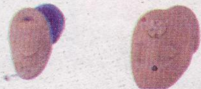
(Actual Size of Hearing Aids)

smile You Enjoy More Of Life When You Hear More Of It Improve your hearing. Smile digital hearing instruments