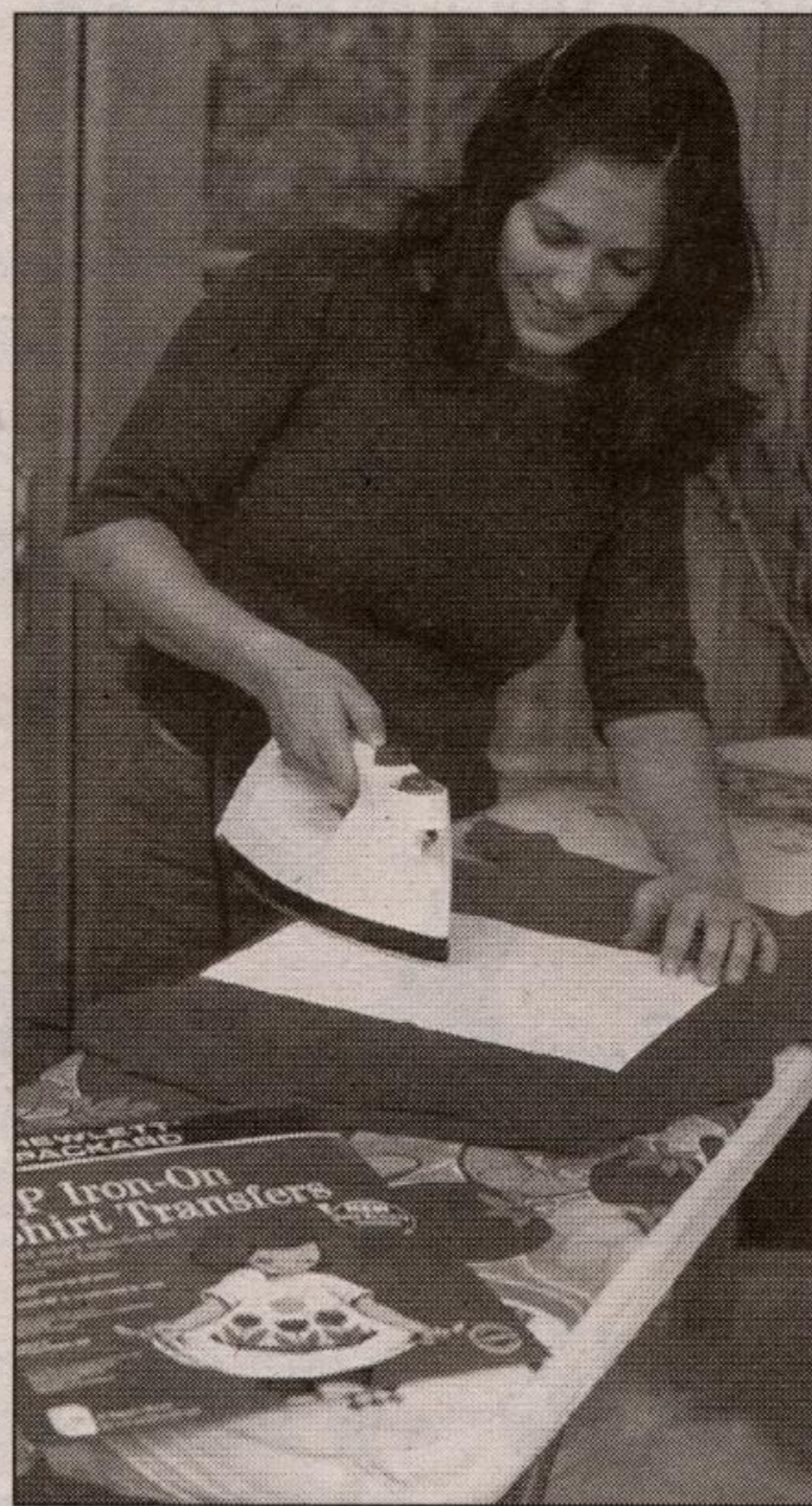
Create the perfect costume at home using the right supplies.

For added fun, why not dress up your kids' old plain treat bag. Again, using the iron-on transfers, it's easy to turn a boring pillowcase into a creepy, crawly candy bag. T-