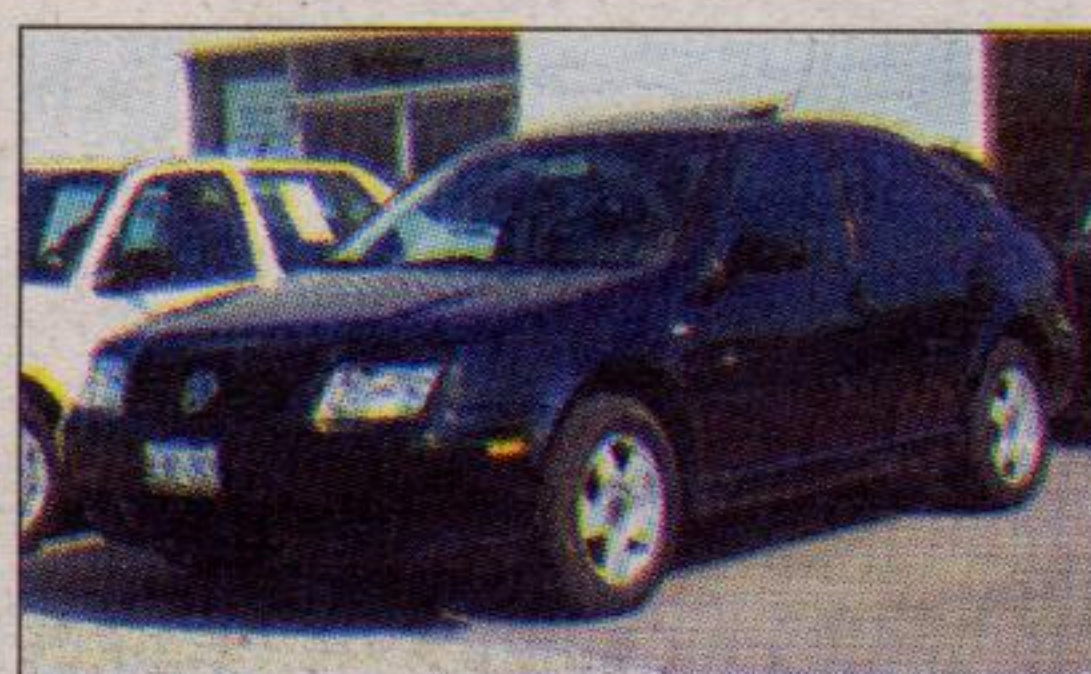
2001 Volkswagen Jetta GLS Black, 5 spd, alloy wheels, spoiler, tint, sunroof, heated seats, power windows/locks/mirrors. Company vehicle, 1300 km $24,495