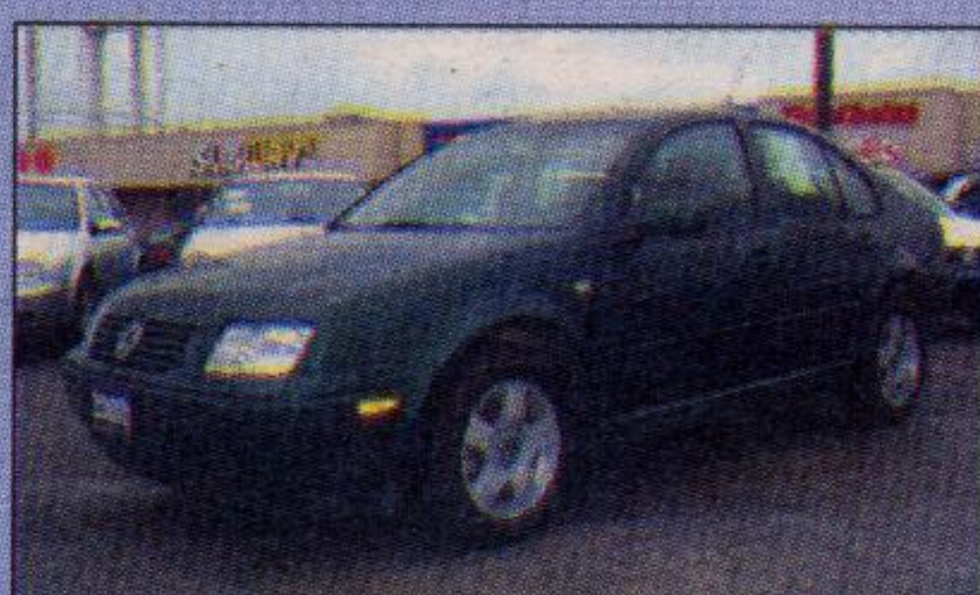
2000 Volkswagen Jetta TDI GLS Green metallic, 5 spd, alloy wheels and sunroof, heated seats, power windows/locks/mirrors. VW certified. 50,300 km $23,995