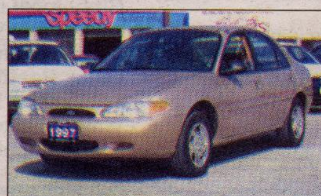
1997 Ford Escort LX Automatic, air conditioning, AM/FM cassette. 70,475km $9,995