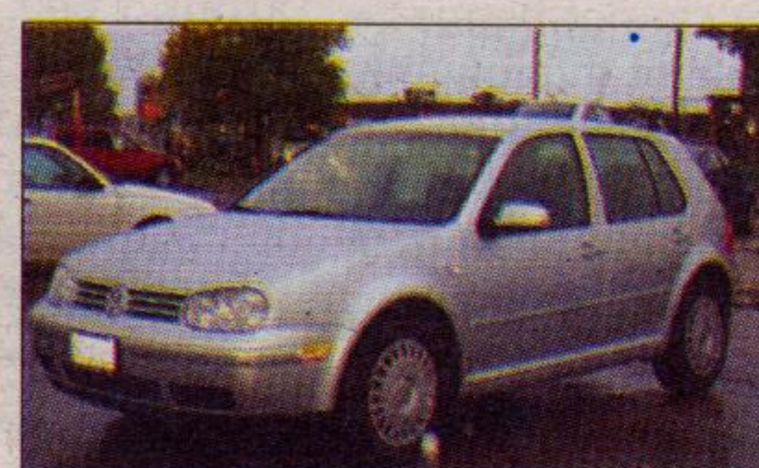
2001 Volkswagen Golf TDI GLS Auto Power windows, locks and mirrors. Silver on black velour. Start saving on fuel now. Company vehicle, 2000 km $24,995