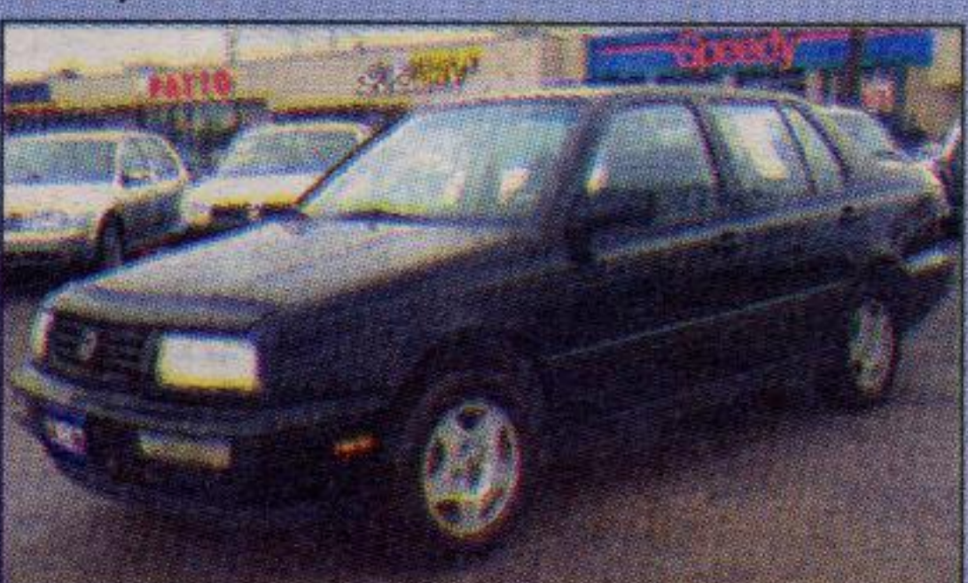
1997 Volkswagen Jetta GT Sporty black, 5 spd, alloy wheels, impeccably kept, locally pre-owned Jetta. VW certified. 106,100 km $14,995