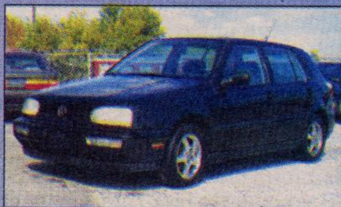
1998 Volkswagen Golf K2 Black, sport seats, A/C, power windows, locks and mirrors, alarm, alloy. VW certified. 96,500 km $13,995