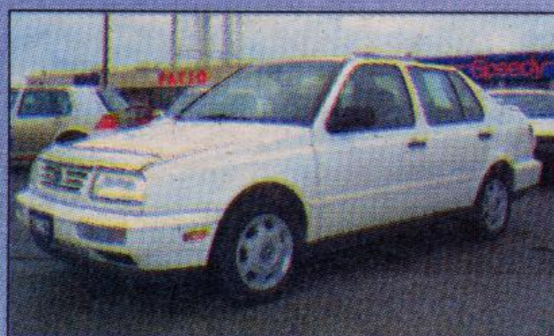
1997 Volkswagen Jetta GT Automatic Locally pre-owned Jetta. A desirable GT model with upgraded upholstery and equipment. VW certified. 98,150 km $13,995