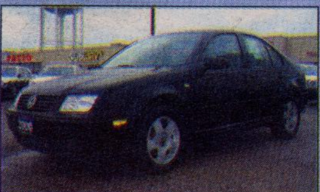
2000 Volkswagen Jetta GLS Automatic Black on black leather, alloy wheels and sunroof, heated seats, power windows/locks/mirrors. VW certified. 45,100 km $22,995