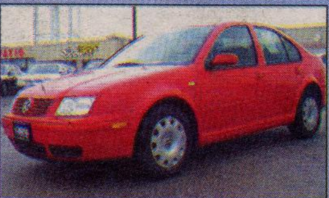
1999 Volkswagen Jetta GLS Bright red, 5 spd with heated seats, power windows, locks and mirrors. VW certified. 63,000 km $20,495