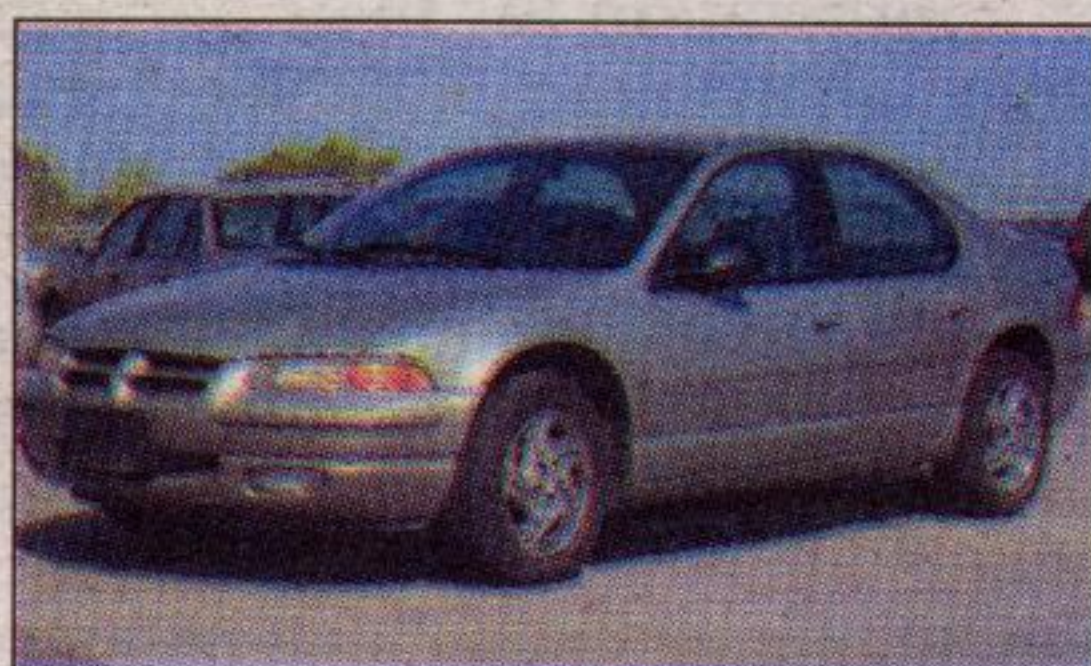
1995 Dodge Stratus ES V6 Power windows/locks/mirrors, AM/FM cassette, cruise control, alloy wheels $7,995