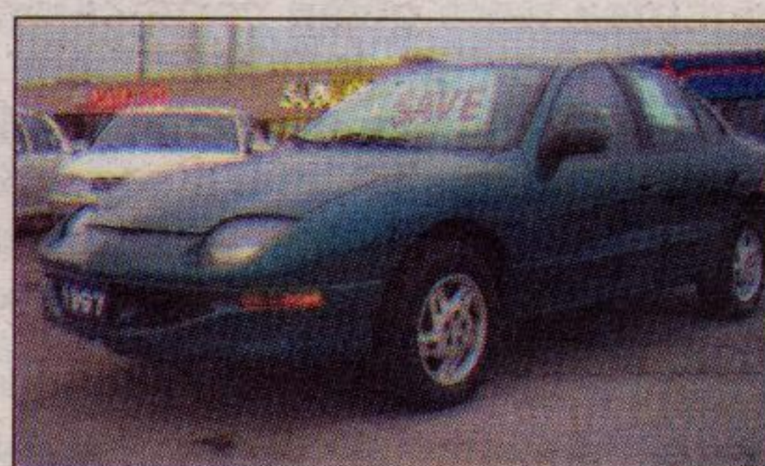
1997 Pontiac Sunfire SE Automatic, air conditioning, cruise control, AM/FM cassette. 96,750km $9,495