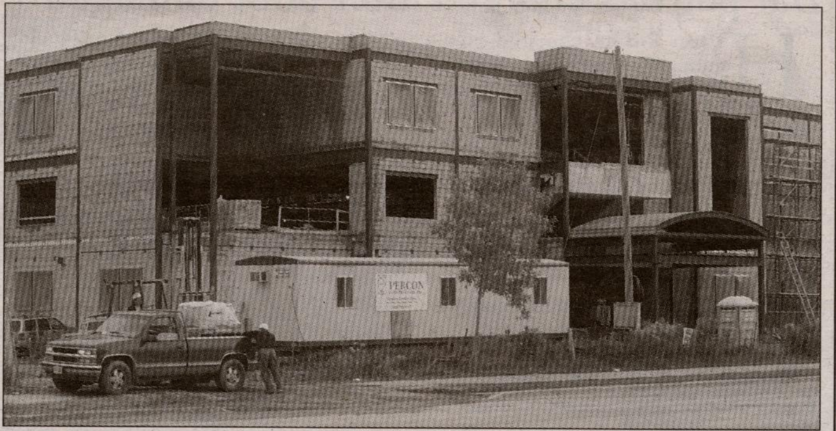
Construction of Christ the King Catholic Secondary School is on schedule after a good stretch of summer weather.

Actual construction of the school is to be completed in May of 2002 with three months allowed for clean up and commissioning. That leaves some leeway in case the remaining time cannot be made up. Corbacio said because of the low initial enrolment in the first year, the entire school will not be in use. That means workers can attend to those classes that will be needed for the school's opening.