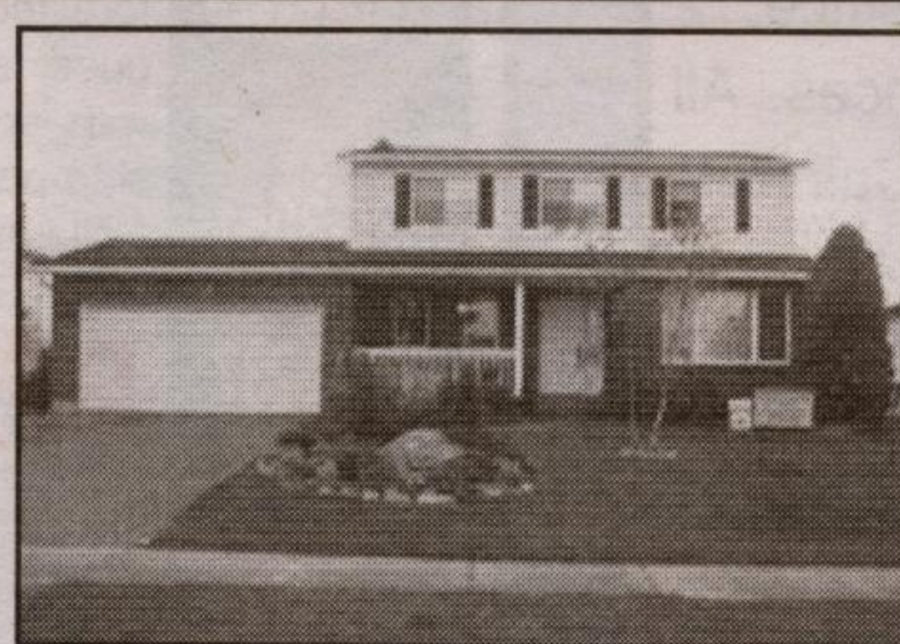
132 Parkedge Rockwood

24 hr. open house information 1-800-550-0059, ext. 7838 Your Host - Gordon Findlay