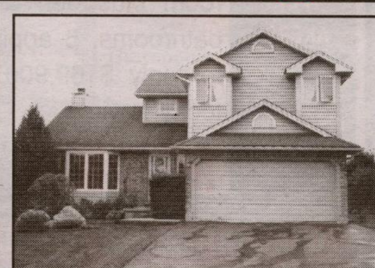
103 John Street Rockwood

Realty Specialists Inc. - 1-877-374-7653