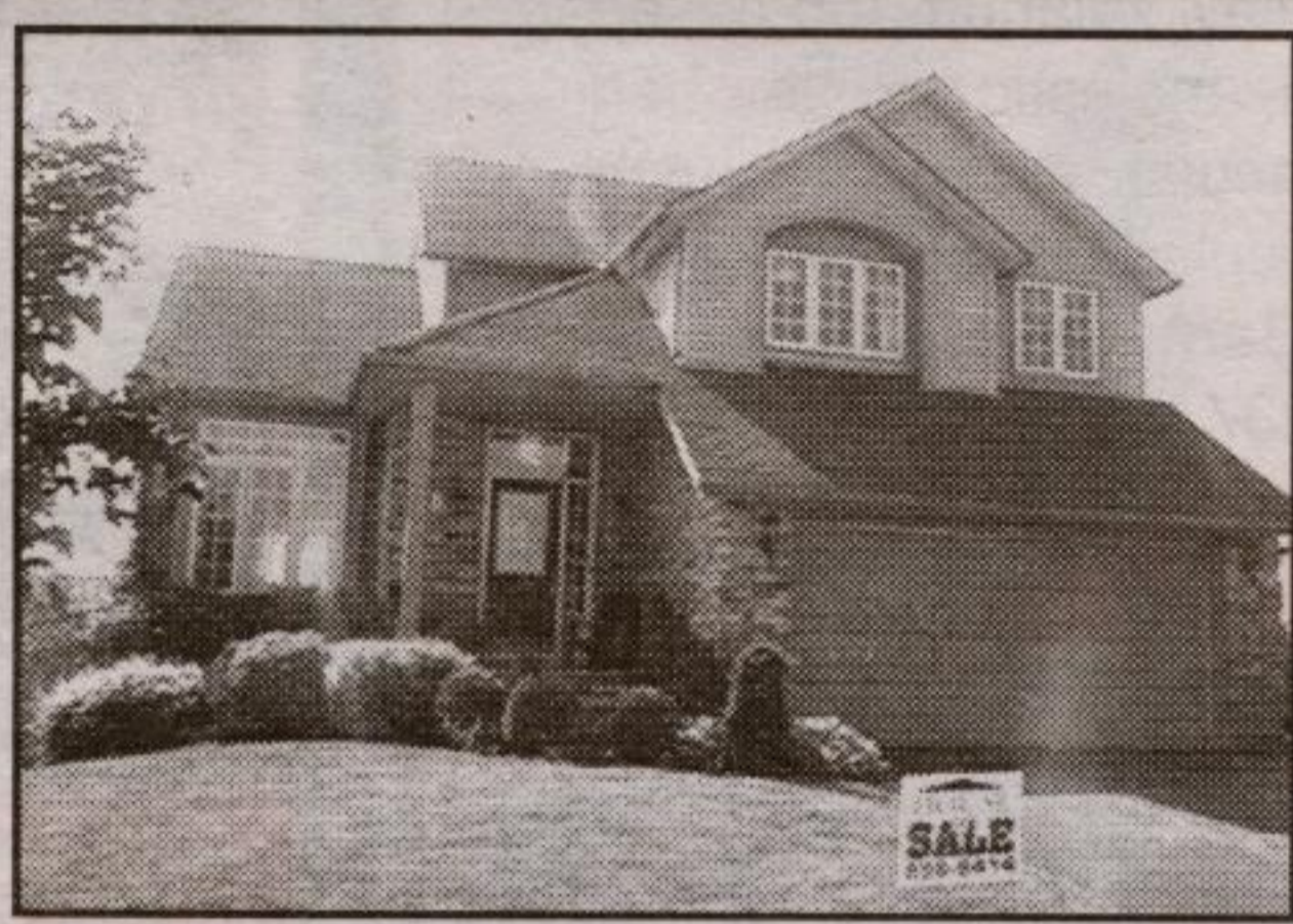
138 Parkedge Rockwood

Realty Specialists Inc. - 1-877-374-7653