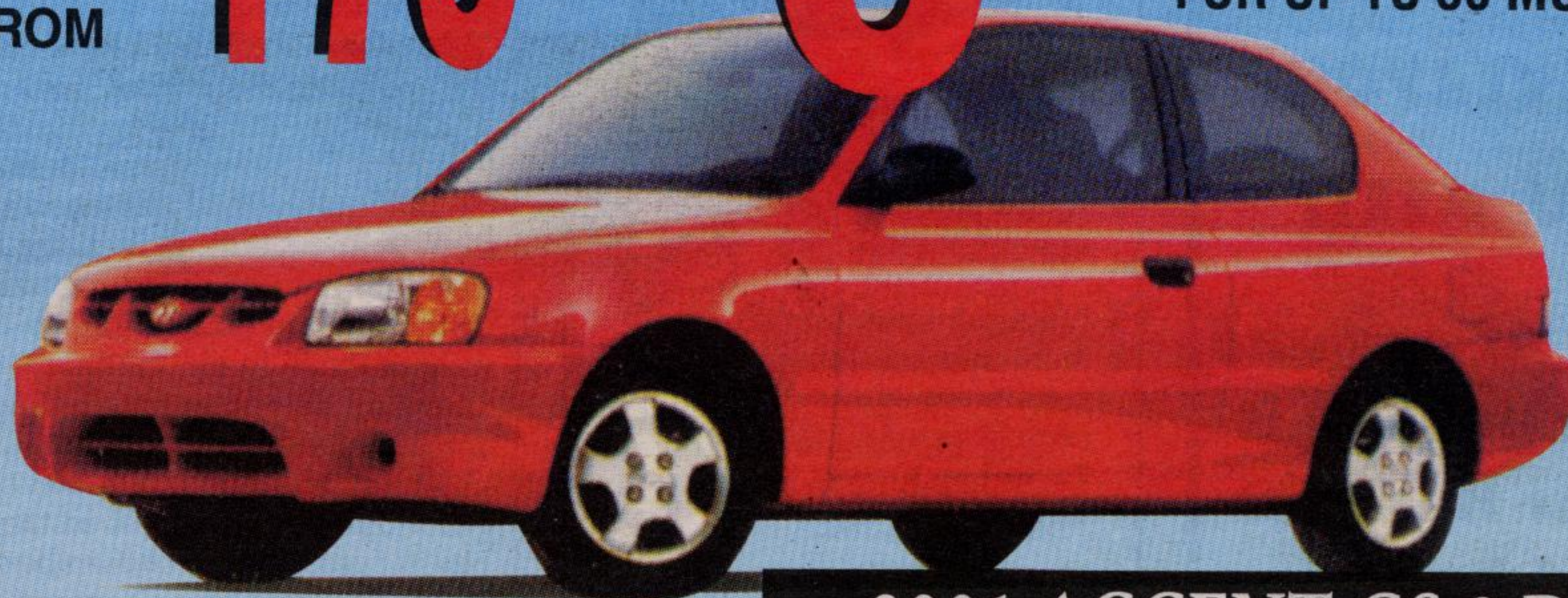
2001 ACCENT GS 3 DR.

LEASE FROM $179* OR 0% PURCHASE FINANCING† FOR UP TO 36 MONTHS