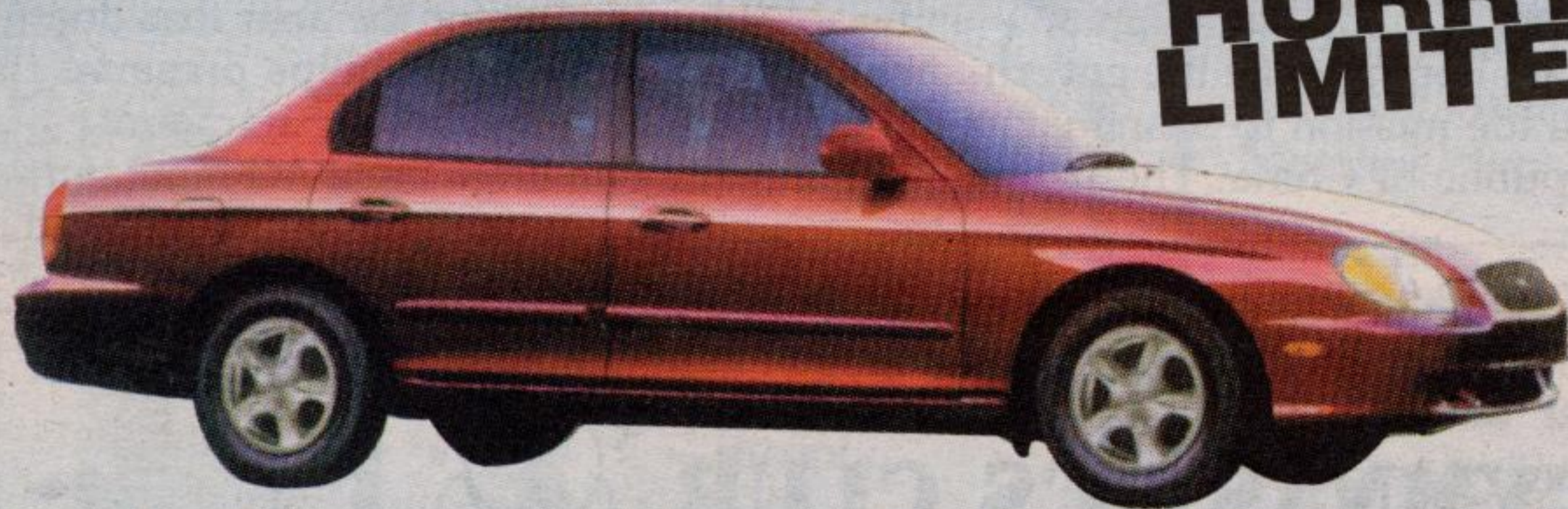
MSRP From $20,495**