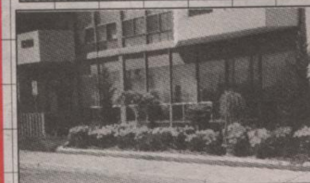
Front of Sands