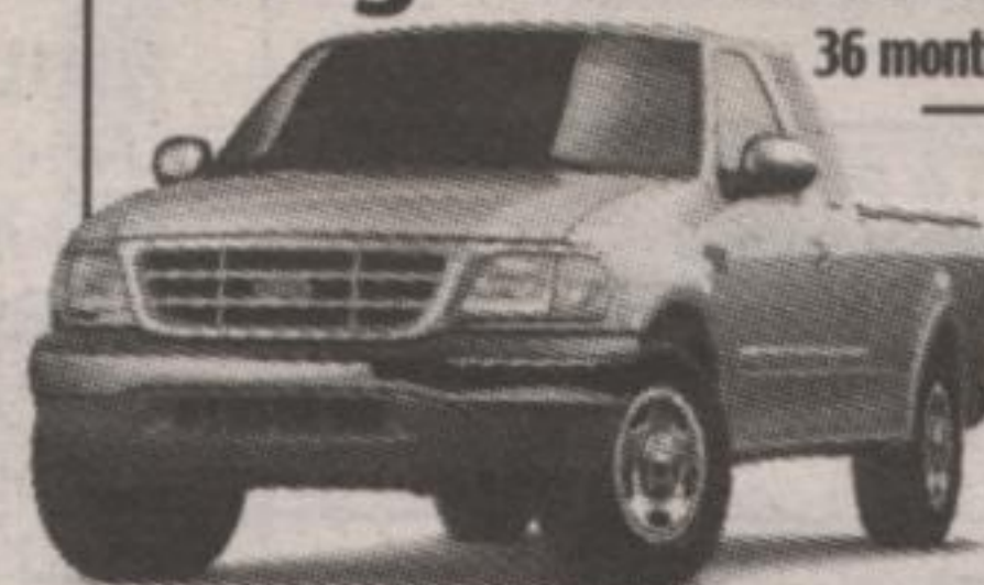
2001 F-150 XLS 4x2 SuperCab