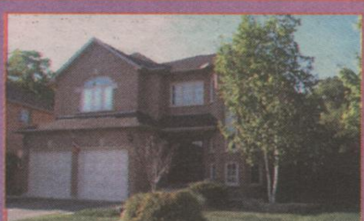
STUNNING RESIDENCE ON WOODED BAYVINE - $409,900

Set on a massive lot, this customized Eden Oak model is approx. 3285 sq. ft. with deluxe upgrades galore. Includes 2 gas fireplaces, quality lighting & flooring throughout, upgraded cabinets with built-in appliances, gorgeous 2 bedroom in-law suite on upper floor, security, CVAC, CAC, intercom system and much more!! MLS#LQ3917