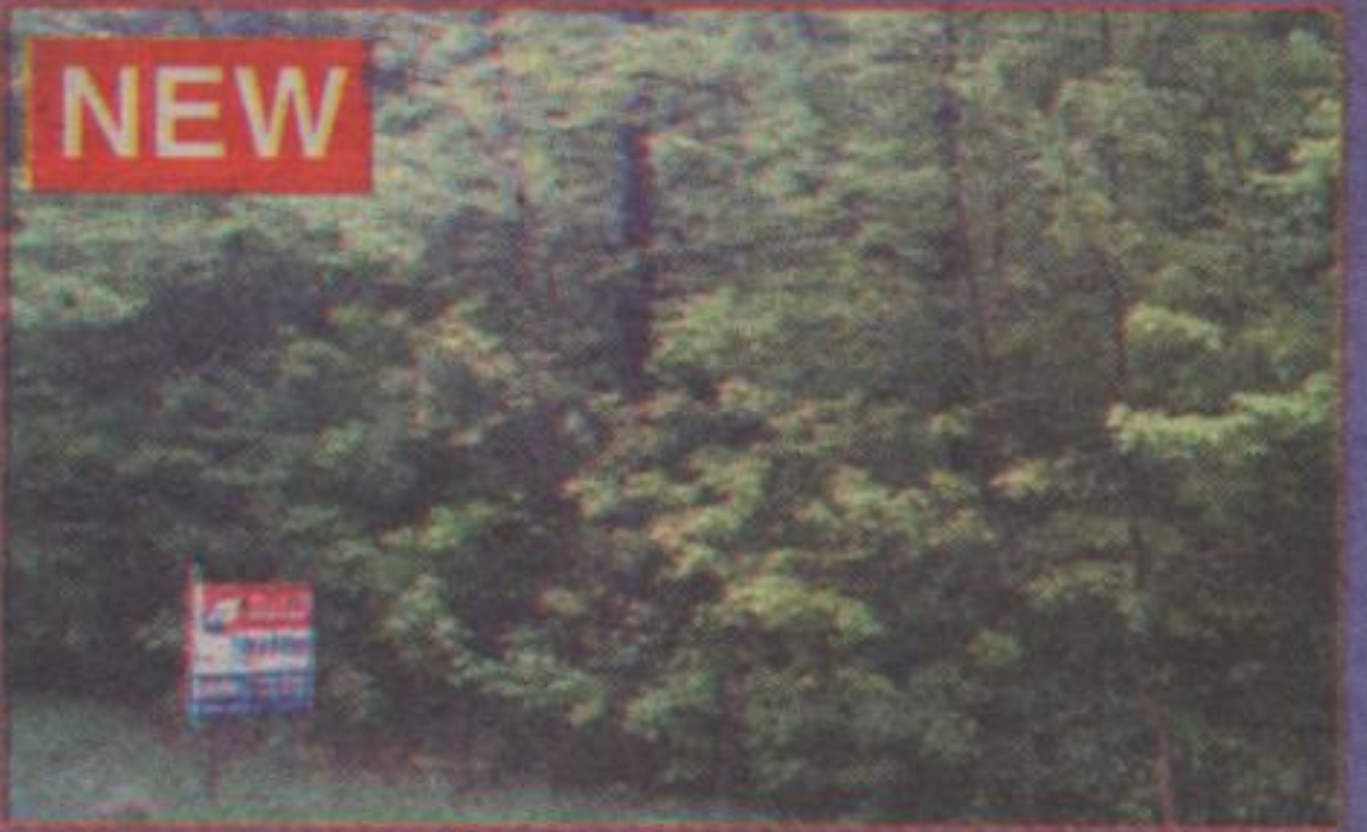
WOODED PARADISE $119,900

Located in a picturesque estate area minutes from Georgetown, this fine home features a beautiful open-concept design with a fireplace in living room, a massive country kitchen with cupboards galore & garden doors to outside. Quality ceramics, hardwood & plush broadloom throughout. Impeccably maintained and in mint condition. Beautifully decorated throughout. Call for full details.