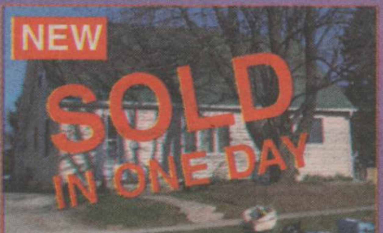
A GREAT STARTER HOME $159,900!!

Panoramic hilltop views from every room of this spacious country home. Features 3 bedrooms plus a main floor inlaw suite, gorgeous renovated bath with a 6 jet jacuzzi tub, new Pergo floor in large eat-in kitchen, new broadloom, almost all windows have been replaced, central air, 2 furnaces, 2 large outbuildings and much more. Excellent value!!