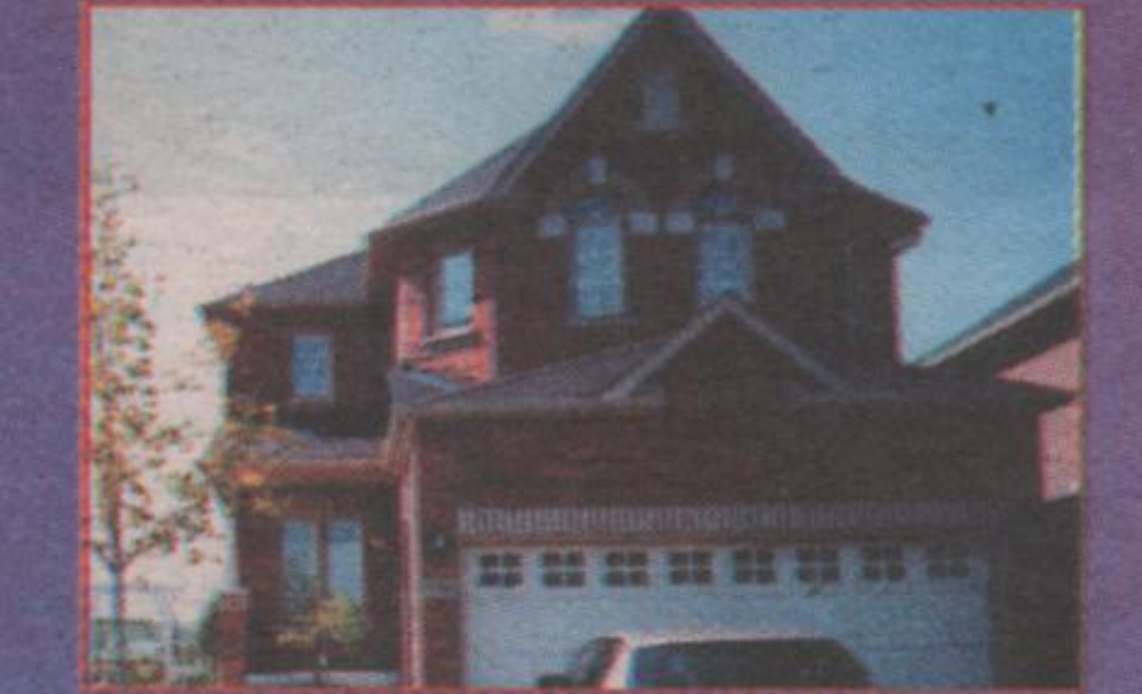
BACKS ONTO PARK

Just under 2 acres, this beautiful heavily treed lot, is close to Credit River in scenic Terra Cotta. The perfect spot for your secluded dream home. MLS#LS3596