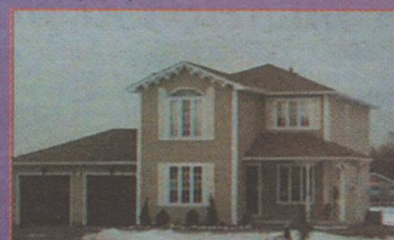
1.33 ACRES WITH LOVELY CUSTOM HOME - $299,900!!

Spacious 3 bedroom bungalow with garage. Features 2 full baths, formal living & dining rooms, massive eat-in kitchen with remodeled cupboards and lots of custom features, walkout to patio & laundry facilities. Many improvements including replaced roof, furnace & central air. Plush broadloom throughout. Monitored alarm system & more. Excellent location - close to schools & shopping! MLS#LS3878