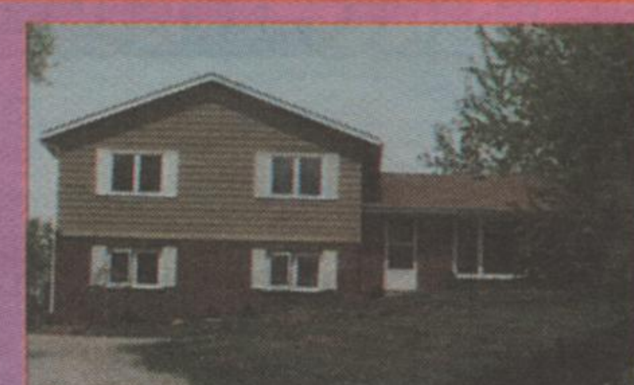
1.85 ACRES IN HALTON HILLS - $269,900

Set on a massive lot, this customized Eden Oak model is approx. 3285 sq. ft. with deluxe upgrades galore. Includes 2 gas fireplaces, quality lighting & flooring throughout, upgraded cabinets with built-in appliances, gorgeous 2 bedroom in-law suite on upper floor, security, CVAC, CAC, intercom system and much more!! MLS#LQ3917