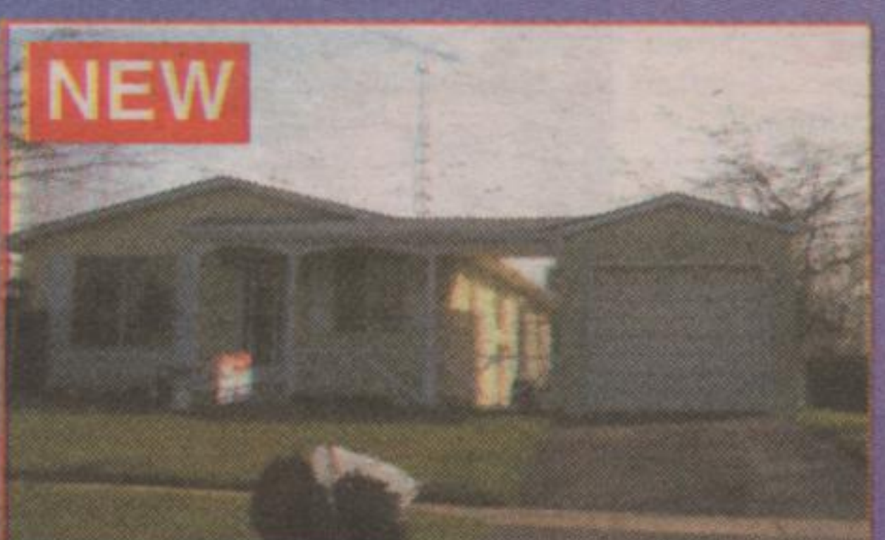
DESIRABLE QUIET COURT $199,900!!

Move into your dream home in 5-6 weeks. Select your own kitchen & bath cabinets, flooring, paint etc. Double car garage, 3 baths, gas fireplace, vinyl windows, quality ceramics & much (NEW) more!