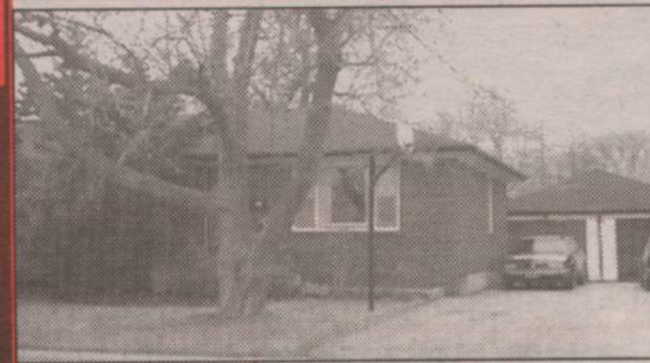
YOU'LL JUST LOVE IT!

Super 2130 sq. ft. quality Fernbrook built home on quiet cres., in Georgetown South. 4 spacious bedrooms, main flr. family rm., oak eat-in kitchen, open dining room. Features incl. CAC, mn. flr. laundry w/garage access, ceramics and more! Backyard is huge, fully fenced and waiting for the pool! Perfect family home in newer neighbourhood. You won't be disappointed. Asking $273,900.