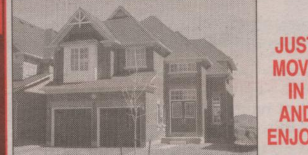
JUST MOVE IN AND ENJOY!

Absolutely lovely 3 bedroom home on quiet child safe court. Huge pie shaped lot has fabulous professional landscaping & is very private. Comb. liv/din room with w/o to backyard and patio. Big upper level fam. rm w/cathedral ceiling, skylights & woodburning fireplace. Features incl. large Oak kit., CAC, C/Vac, dble interlock driveway. Walk to "GO" train. Terrific value at $214,900.