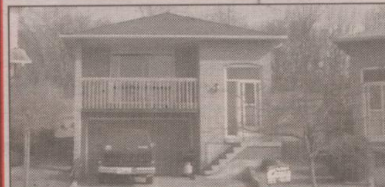
HUGE PIE-SHAPED LOT

2700 sq. ft. of perfection! Open concept quality built home with portico entry. Four spacious bedrms, mn flr family rm w/gas f/place. Mstr bdrm w/4 pc ens, cathedral ceil, w/i closets. Kitchen has ceramics, pantry, desk & island. Many beautiful upgrades including completely finished basement w/4 pc bath. Just gorgeous! Asking $334,900.