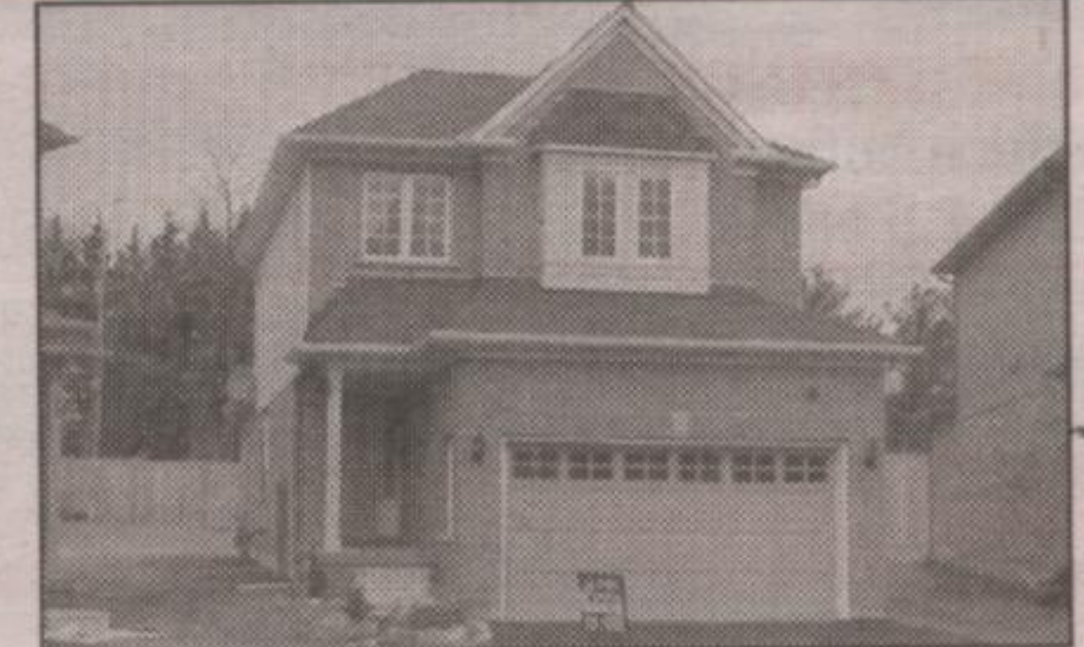
"OPEN CONCEPT/VAULTED CEILINGS"

Better, brighter, bigger premium pie-shaped lot with views of Upper Canada forest. 3 bedrms, maple cabinetry, stone-like ceramics, fireplace, central air, pot lights, upgrades galore! Come ... live on a quiet street! $249,900.