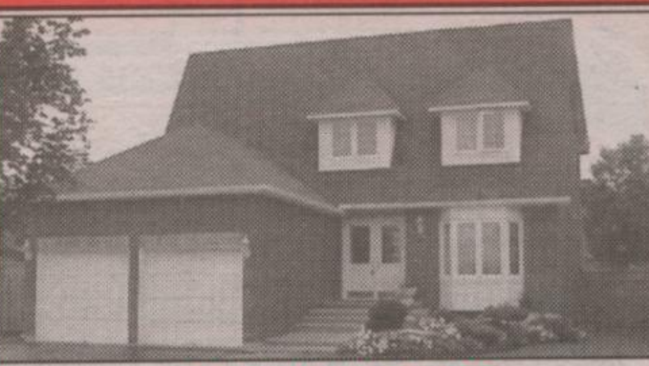
CLASSY CAPE COD

Beautiful custom additions & upgrades make this 4 bdrm home just gorgeous! The eat-in kitchen has pantry & w/o to deck w/sunken hot tub & gazebo. Mn. flr. fam. rm. is open concept, upgr. wood trim & cozy fireplace. Fin. bsmt w/2 pc. bath. Other goodies include: wrap-around porch, CAC, garden shed, sprinkler sys., crown mouldings, French doors, new brdroom, sep. ent. to workshop from insul garage. This home has been lovingly loaded w/upgrades -- A Must See! $279,900.