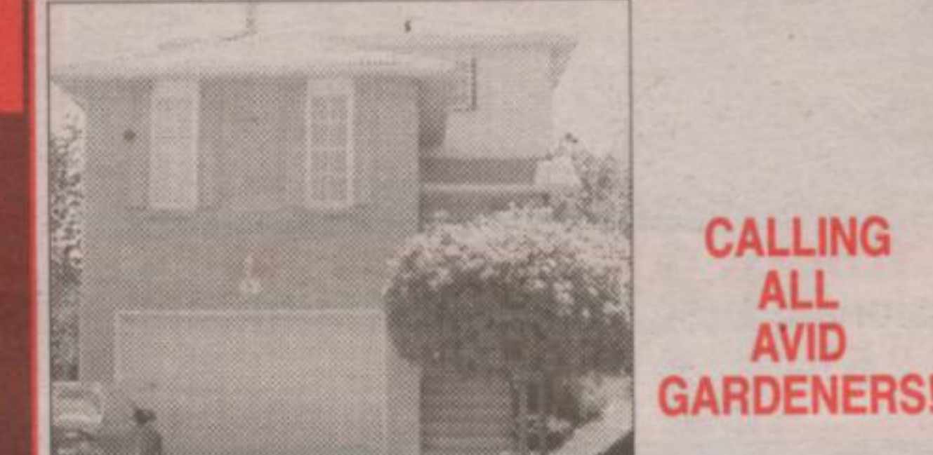
CALLING ALL AVID GARDENERS!

Fernbrook built 2630 sq. ft. of luxury in this gorgeous 4 bdrm home! Upgraded to the "mines", it boasts a lovely open concept design, decorated in modern neutral tones, sunken main flr family w/gas fireplace, separate liv/din rooms w/coffered ceilings, CAC, C/Vac, air cleaner, gar. door opener, sec. sys., patterned concrete walk, driveway & front porch area. Professionally landscaped w/two level Cedar deck & lighting up fully fenced backyard. Thousands spent in upgrades. Backs onto future park. Excellent value at $314,900.