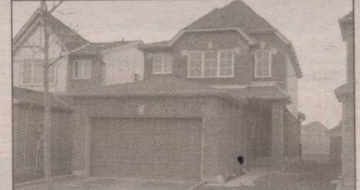
"JUST WHAT YOU'VE BEEN WAITING FOR"

Bright, spacious raised bungalow in quiet court location. Huge oak kitchen w/strip oak floors, w/o from liv rm to open balcony. Cozy rec rm with gas woodstove, wet bar & office space. Oversize garage. 5 mins. walk to "GO" train. Home is in excellent condition and is offered for sale at the excellent price of $208,900! Hurry - it's a beauty!