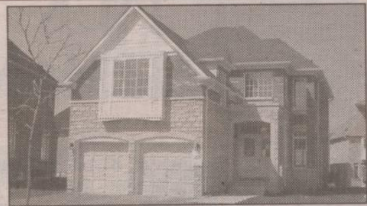
"GABRIELLE ROY" W/FINISHED BASEMENT

Nature in your own backyard! Many perennial gardens - sits on the deck and admire the long views into trees! Large, 4 bdrm home w/fin bsmt plus main flr family rm w/fireplace & w/o to deck. Hardwood floors, master with ensuite bath, Oak bit w/bi appliances, CAC, C/Vac, PLUS so many extras you've got to see! Located on quiet court within walking distance to schools, parks & shops. Only $259,900.