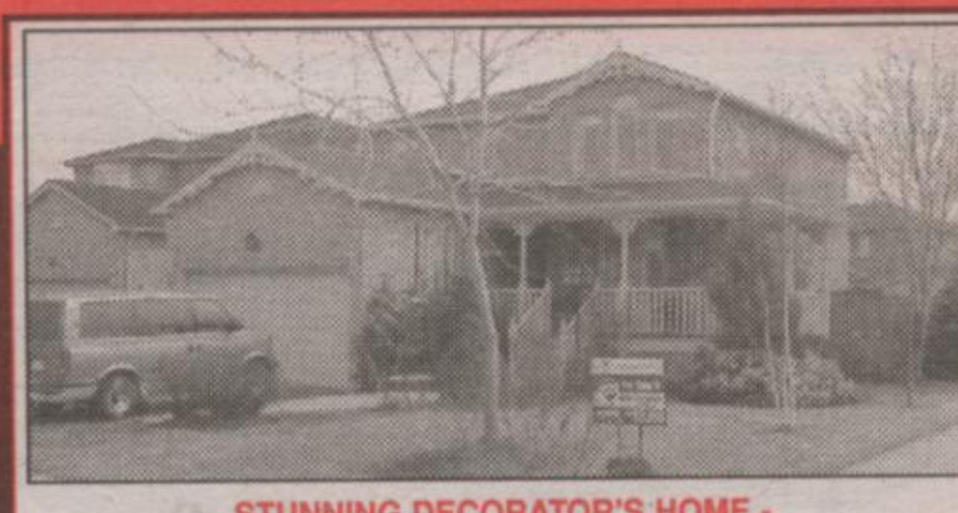
STUNNING DECORATOR'S HOME - SPARKLING WITH UPGRADES

Absolutely stunning 4 bdrm home with classy open-concept design. Double door entry with stone-like ceramics. Master bdrm has vaulted ceiling, luxury ens & deep walk-in closet. Upgrades incl: 9 ft ceilings, California shutters, main flr fam rm, 3-way f/place with oak mantle, Mexican ceramics, strip oak flrs, solid oak strcse, CAC, C/VAC, gar dr opener & office/loft on 2nd flr landing. Situated near school & parkette - a simply delightful home! $309,900.