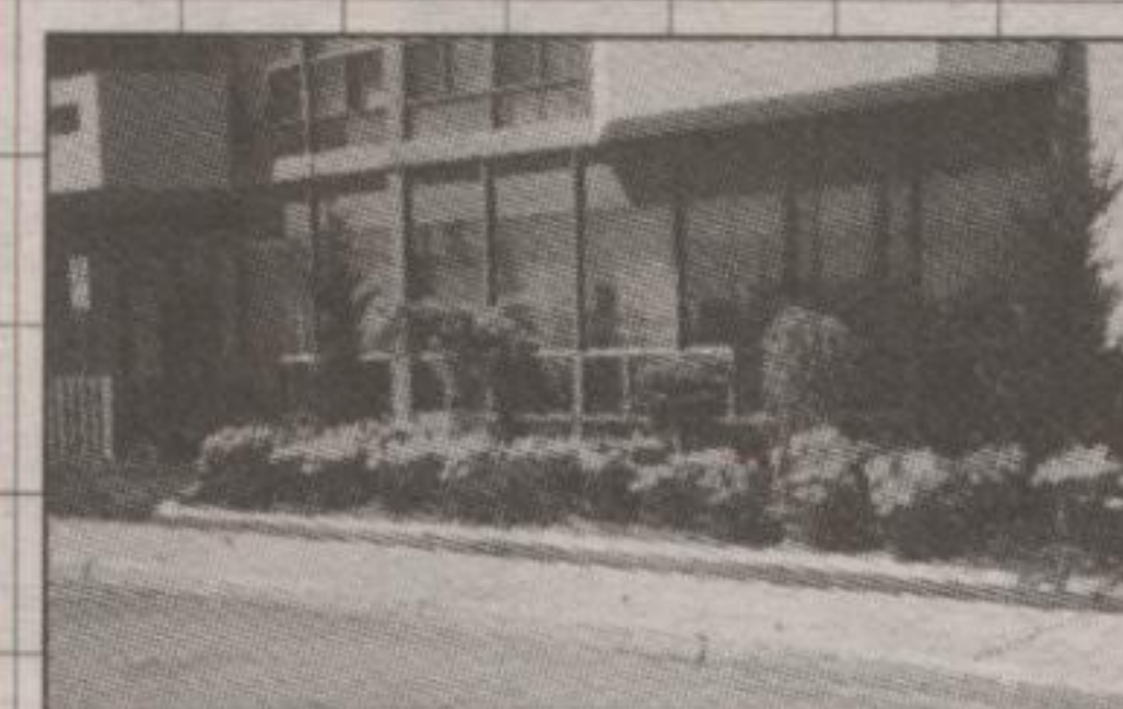
Front of Sands