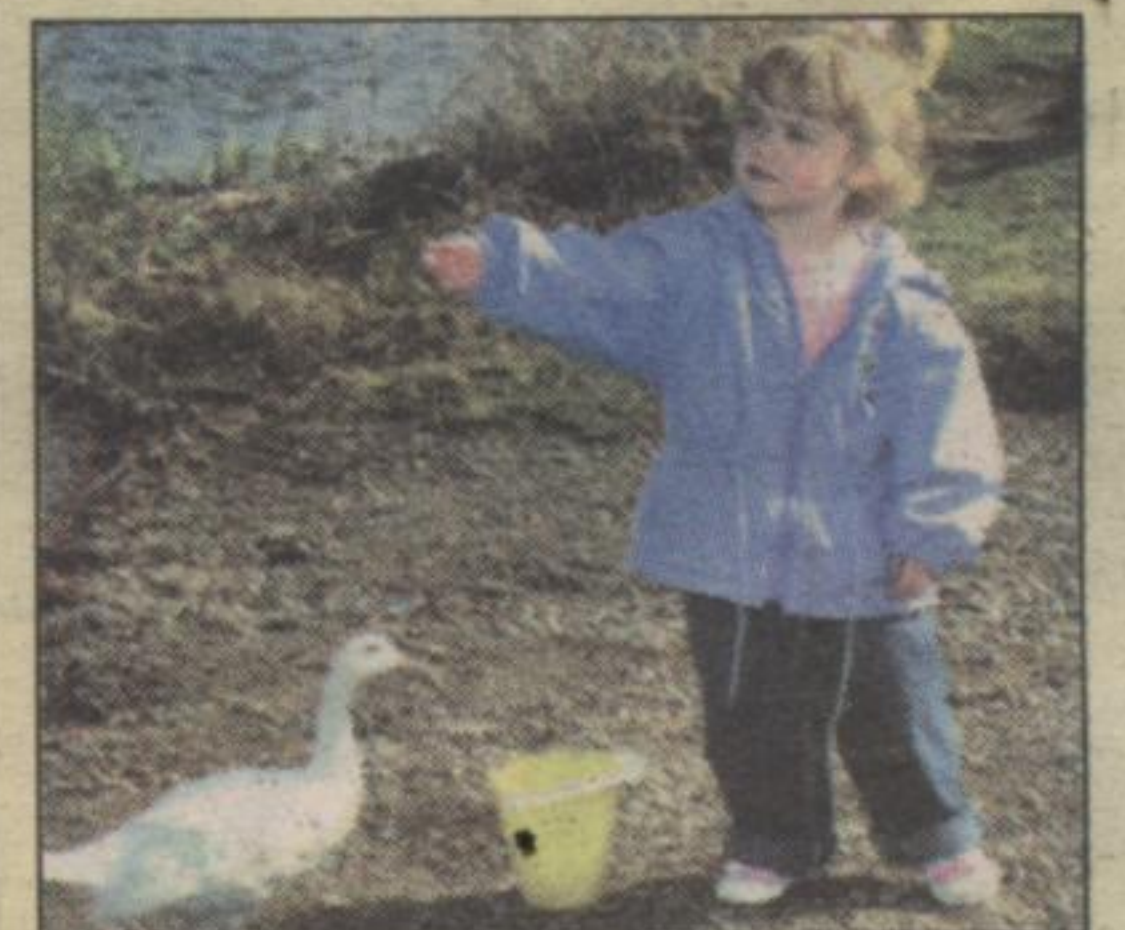
Parenting... 12-page section