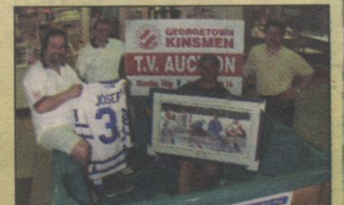
Kinsmen TV Auction... 12-page section