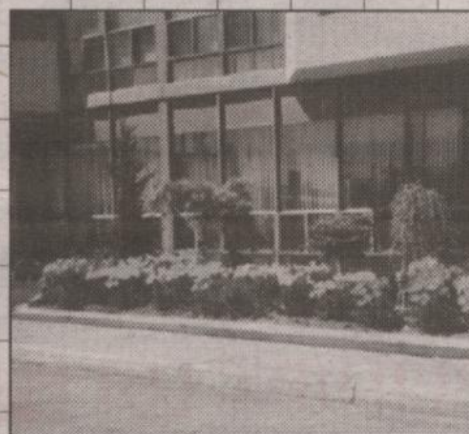
Front of Sands