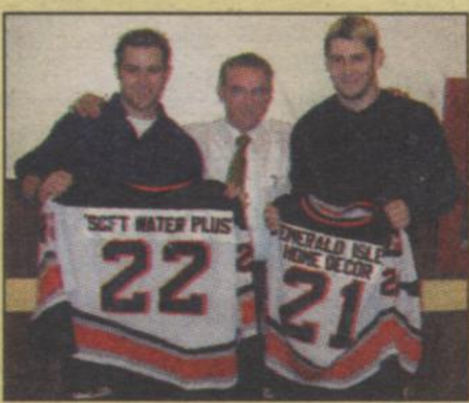
Raiders retire duo's numbers ...S/L pg. 1