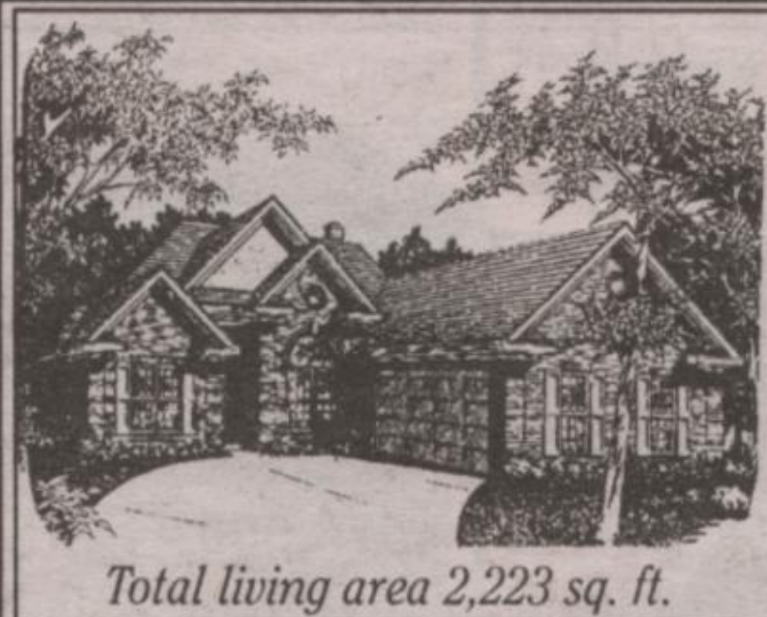
Total living area 2,223 sq. ft.