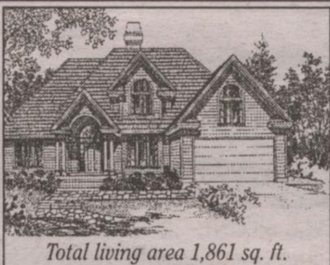
Total living area 1,861 sq. ft.