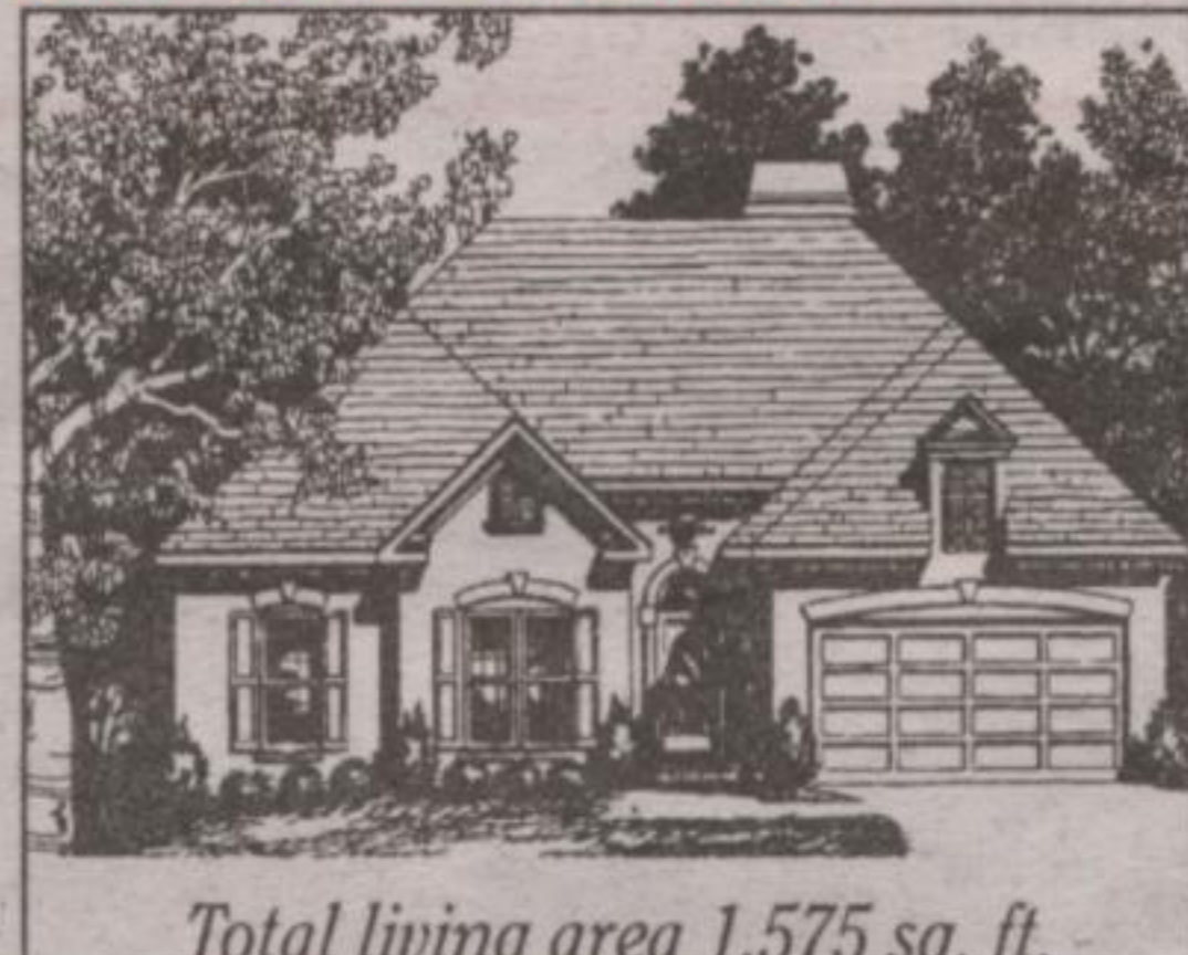
Total living area 1,575 sq. ft.

Build the home of your choice on one of three beautiful almost 1 acre lots in charming Glen Williams. Town water and natural gas available - only 4 minutes to the GO station. Truly the best of all worlds. Let's get started on your new home today - Call Elizabeth Doell* for details.