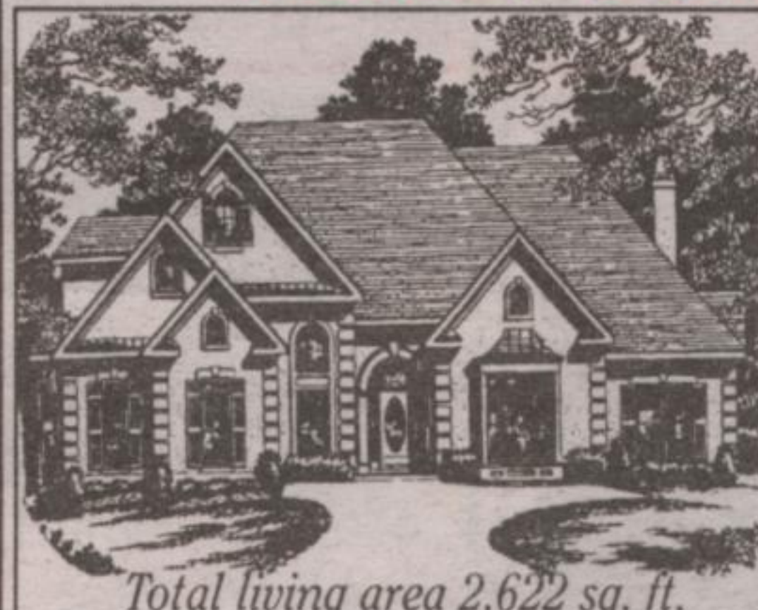
Total living area 2,622 sq. ft.