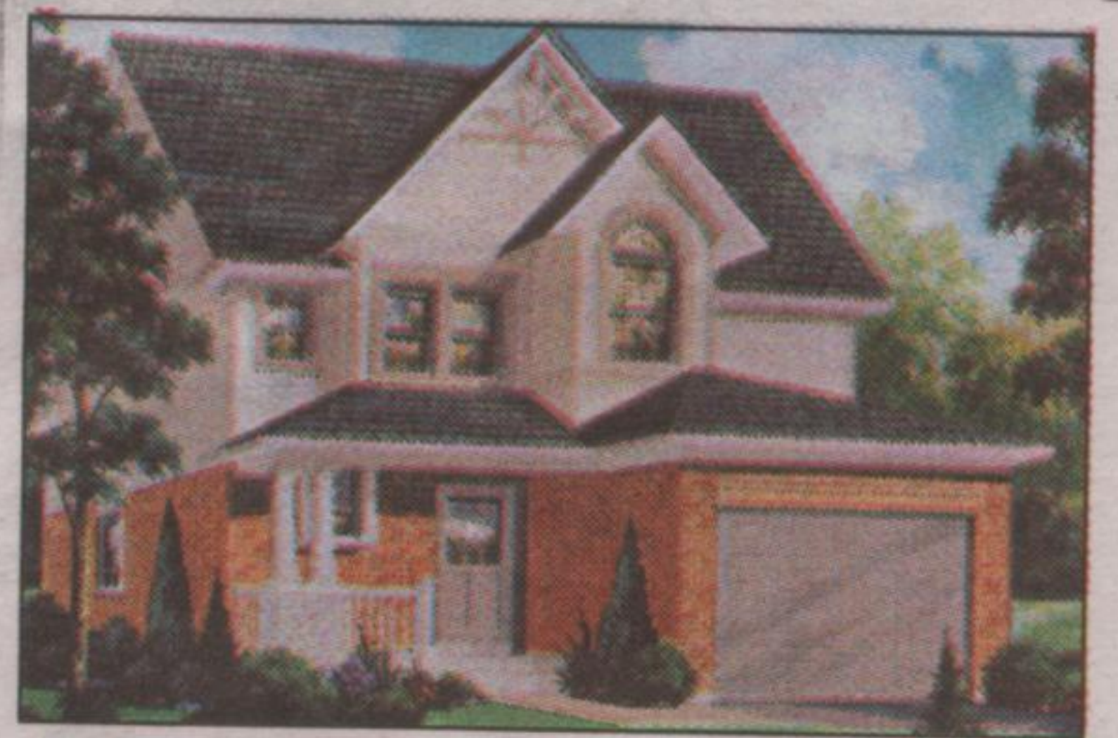
The Windflower III

"The Townsend", a five-level backsplit at 1,922 sq. ft., is a brand new model with an innovative floorplan that incorporates a finished recreation room, which is included in the price of the home, and an optional gas fireplace. This room is on the fourth level, and the light that screams through the oversized windows (a stan-