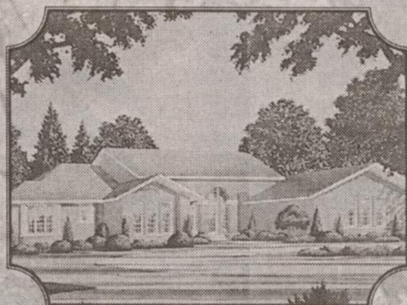
THE DELAWARE 2559 sq. ft. $414,000