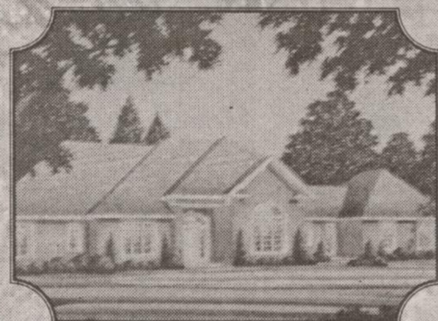
THE KINGSFORT 2620 sq. ft. $429,000