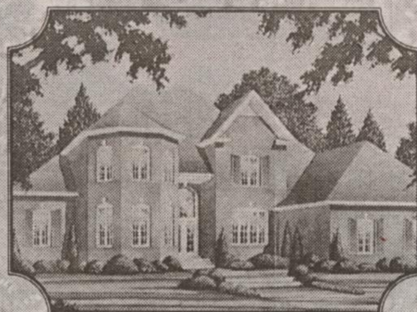
THE BRISTOL 2655 sq. ft. $429,000