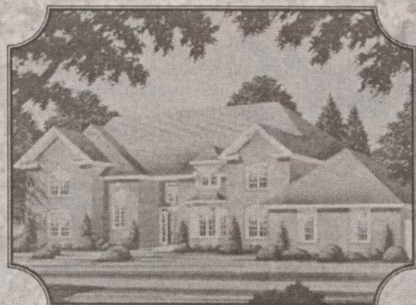
THE CHESAPEAKE 3025 sq. ft. $464,000