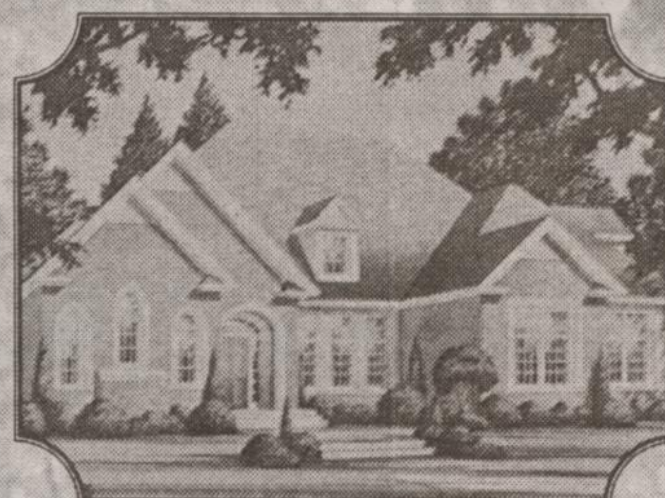
THE NEWHAVEN 2860 sq. ft. $464,000