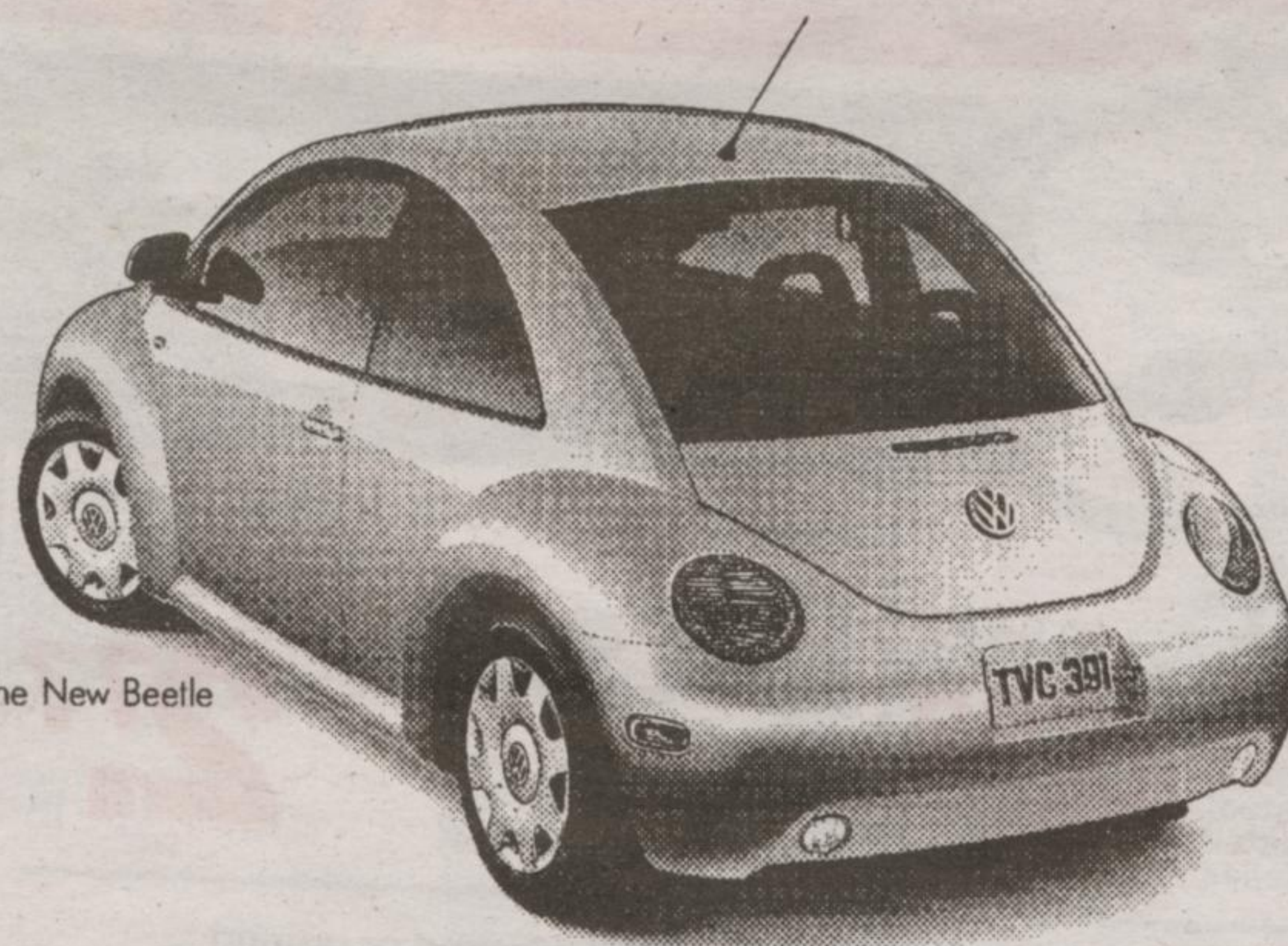
The New Beetle

Worth every single stare-inducing penny.