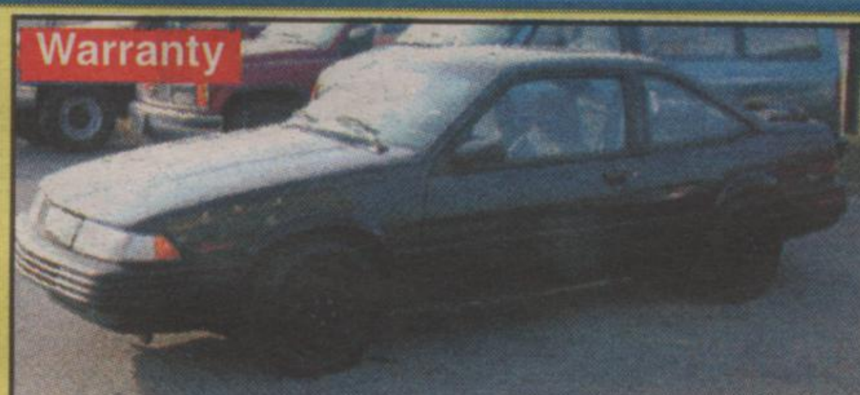
Warranty 94 CAVALIER V6, 5 Speed, Air $5,500