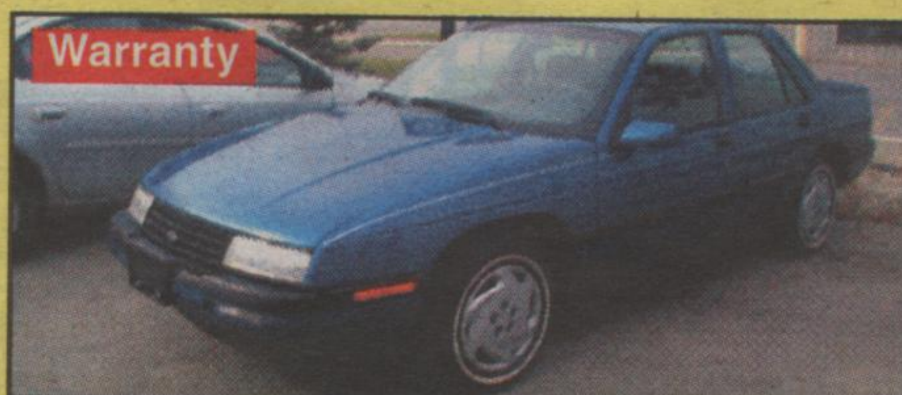
Warranty 93 CORSICA 4 Cyl., Auto, Air, Excellent, reliable cheap transportation $5,500