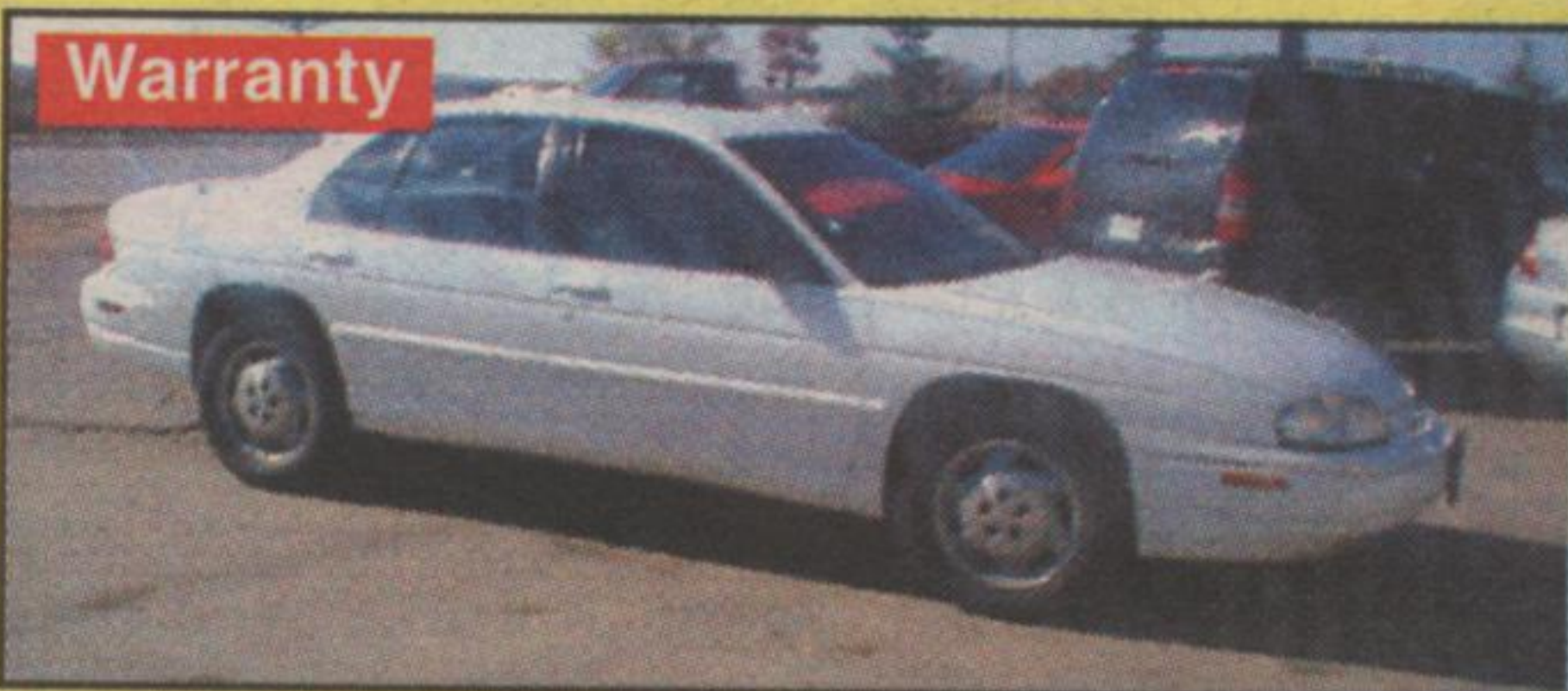
Warranty 95 LUMINA V6, Auto Loaded $9,600