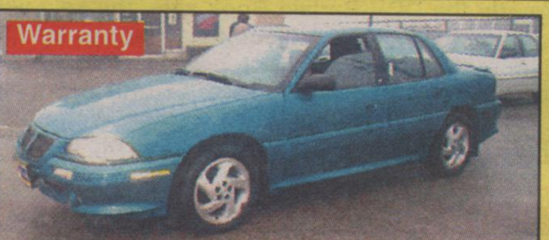
Warranty 95 GRAND AM V6, Auto, Loaded $7,800

Dave Hassell 877-7958 45 MOUNTAINVIEW RD. N., GEORGETOWN L7G 4J7