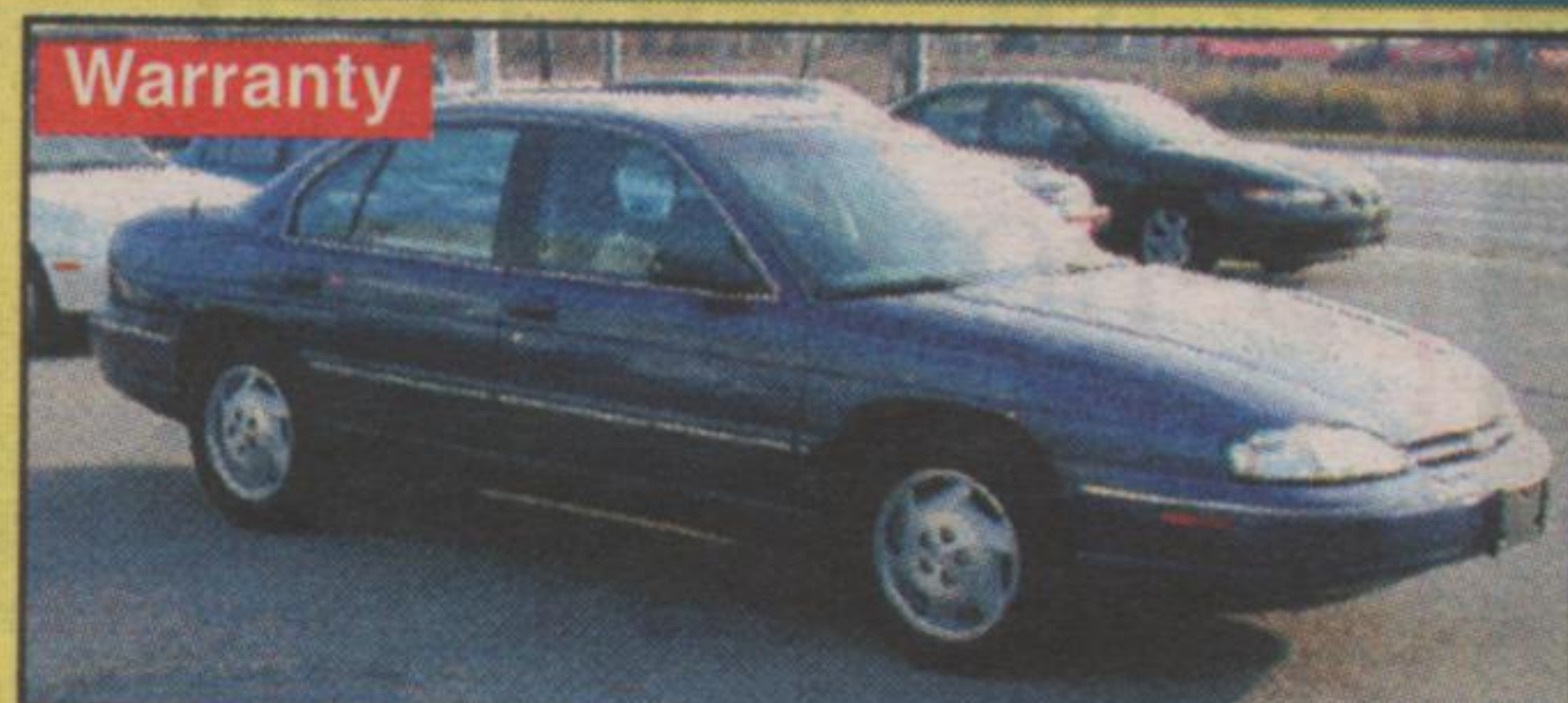
Warranty 97 LUMINA Excellent Shape, Low Kilometers, Loaded $12,400