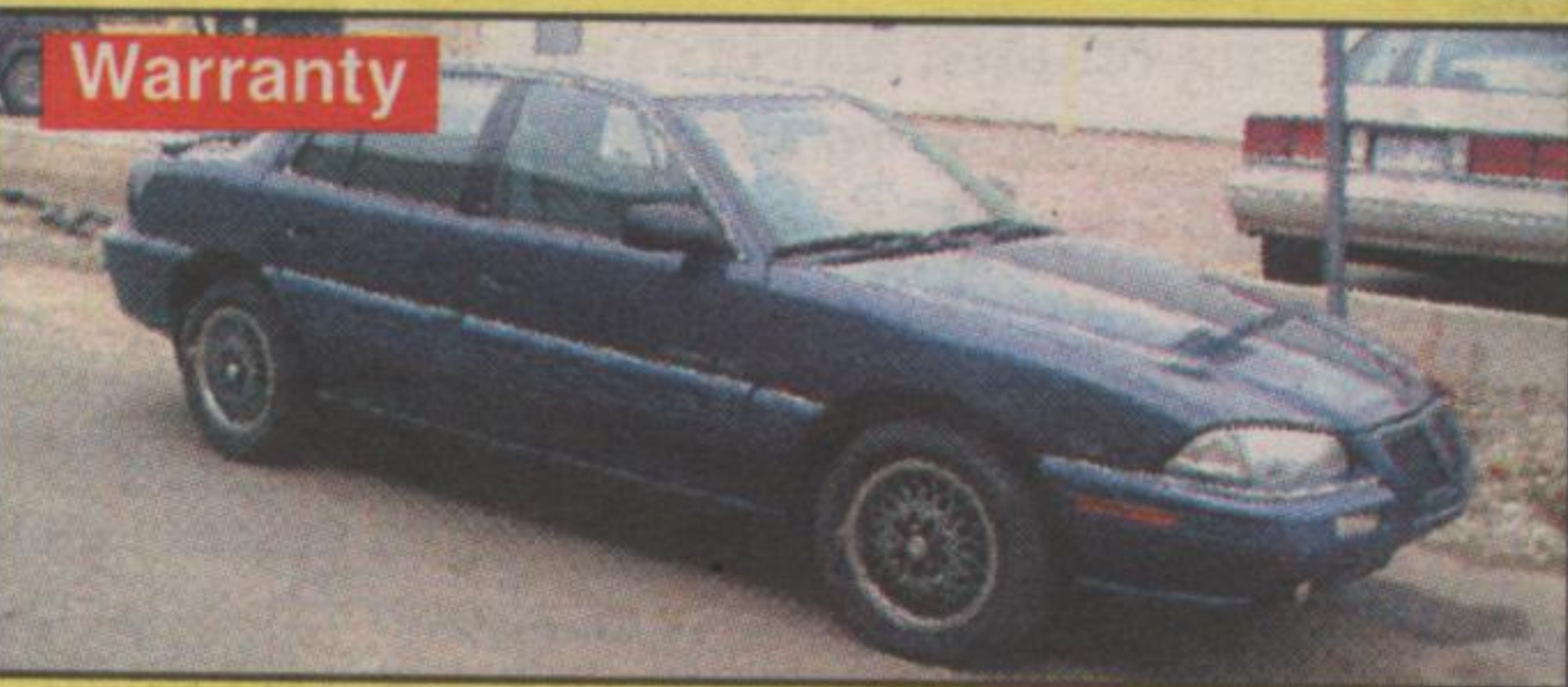
Warranty 94 GRAND AM Loaded, V6, Auto, Excellent Shape $7,400