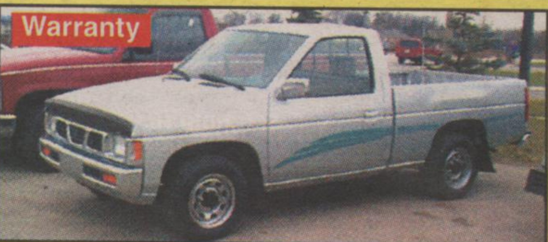
Warranty 95 NISSAN PICK-UP 4 cyl., 5 Speed, Clean Truck $7,000