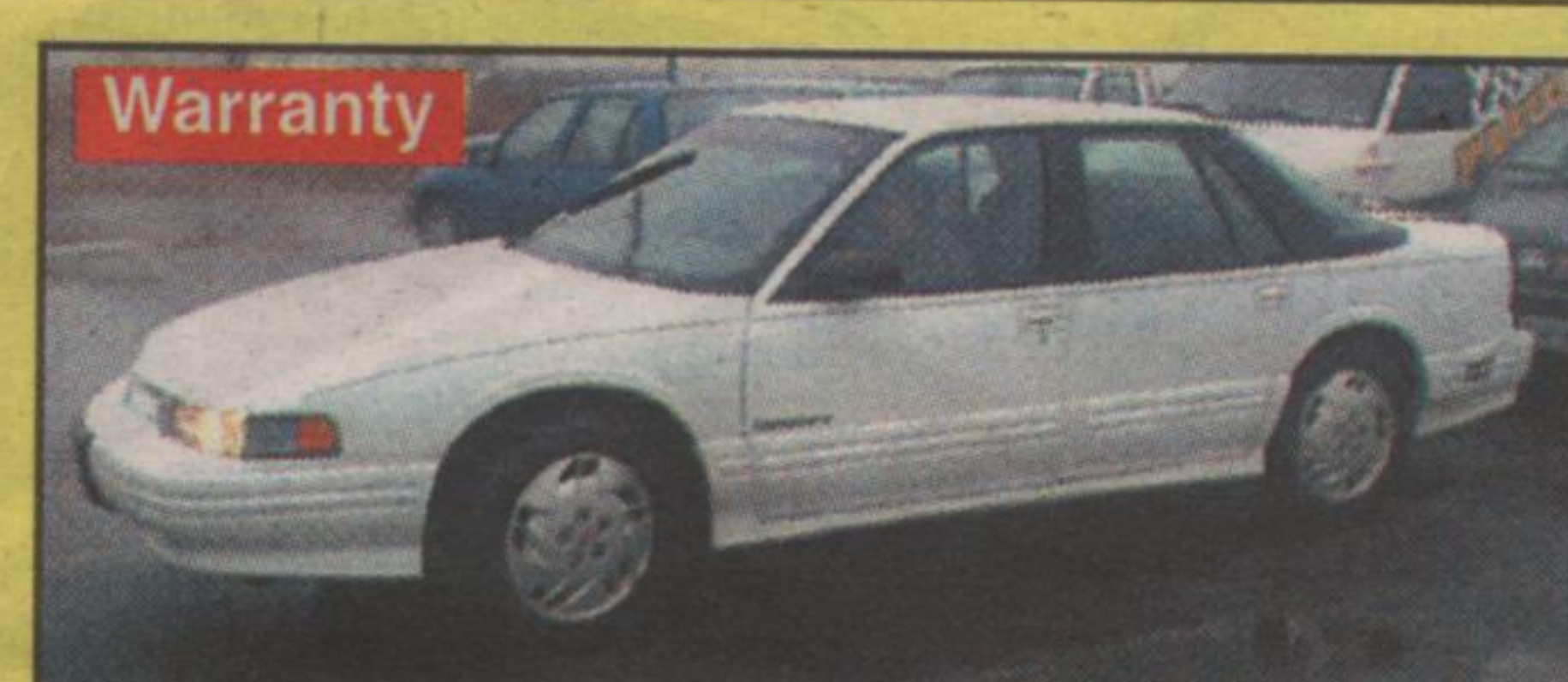
Warranty 94 OLDS CUTLASS Excellent Shape, V6, Auto, Loaded $9,400