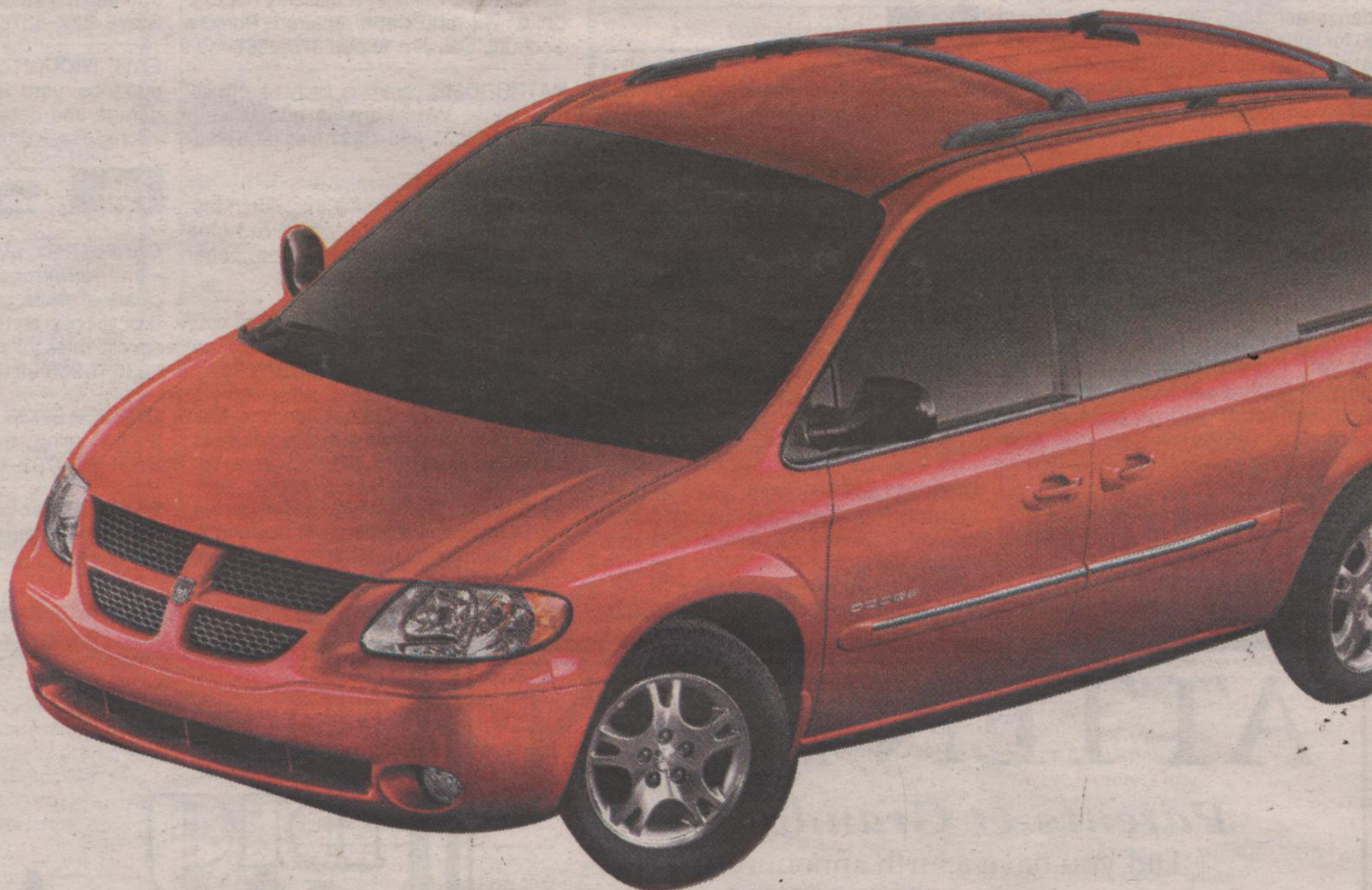
Vehicle shown with optional sport touring package.

a month for 36 months. Downpayment is $3,665 Security Deposit $425 Freight $940.