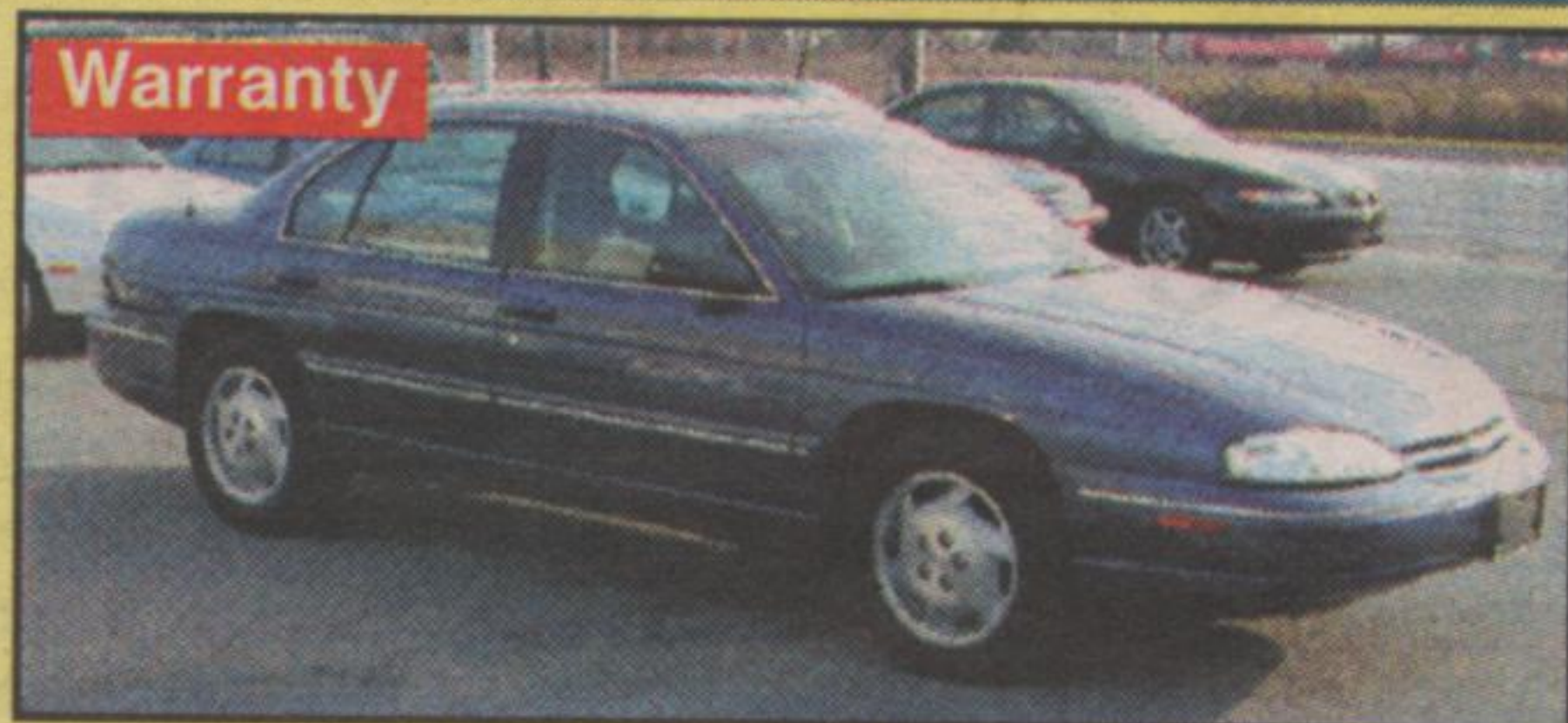
Warranty 97 LUMINA Excellent Shape, Low Kilometers, Loaded $12,400