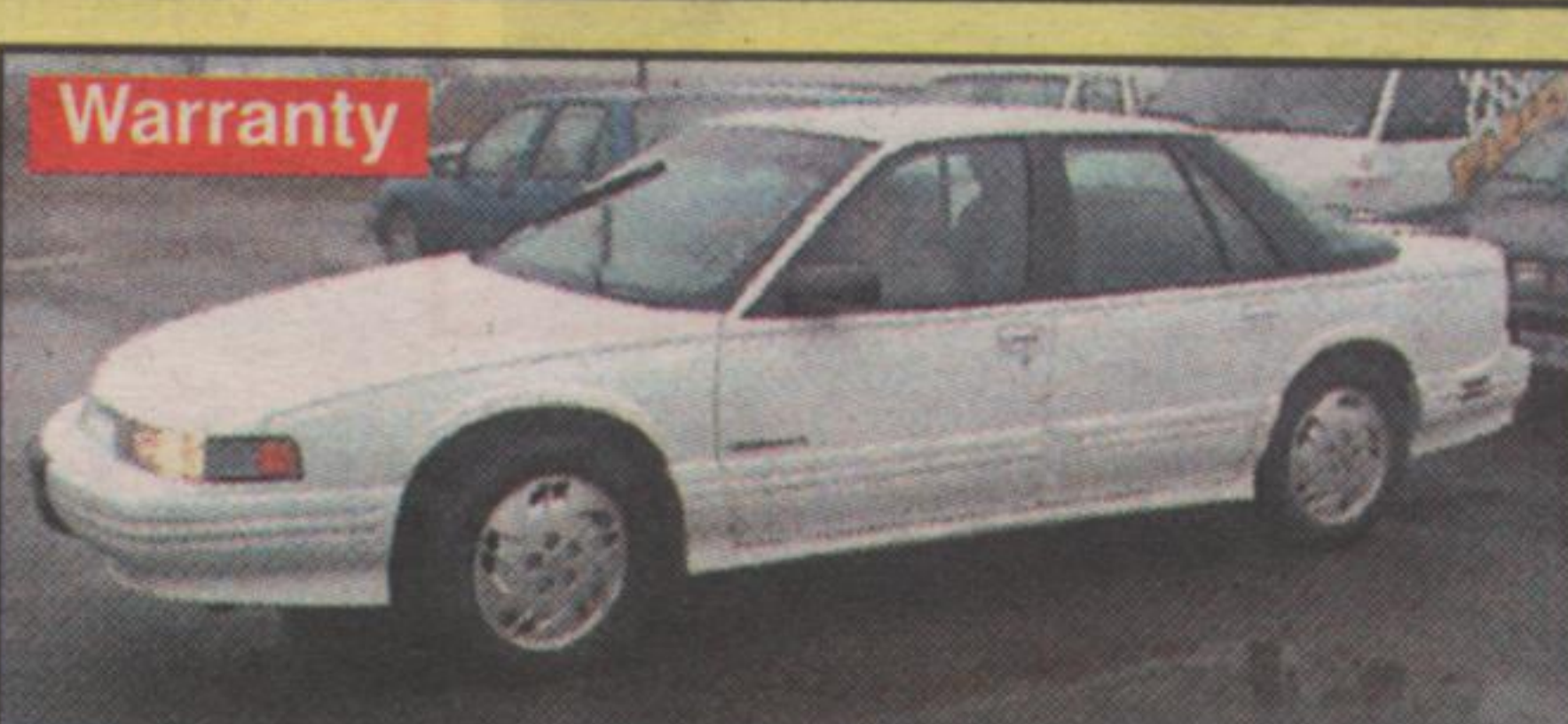
Warranty 94 OLDS CUTLASS Excellent Shape, V6, Auto, Loaded $9,400