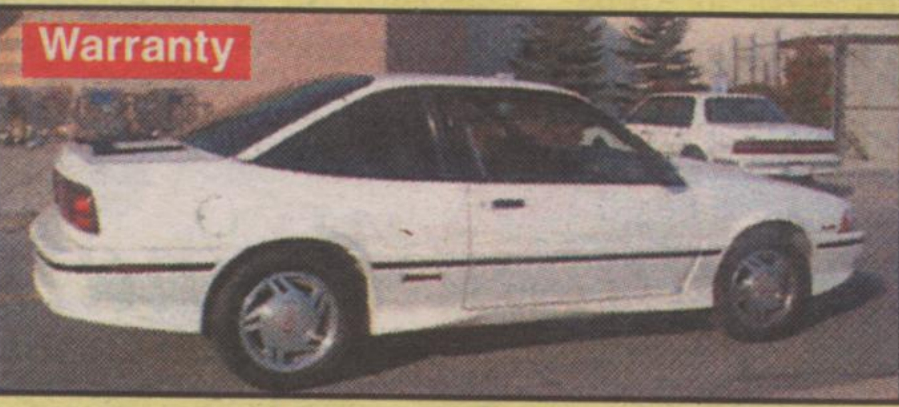
Warranty 91 CHEV CAVALIER V6, 5 Speed Loaded $4,900