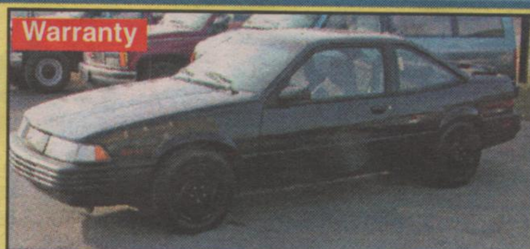
Warranty 94 CAVALIER V6, 5 Speed, Air $5,500