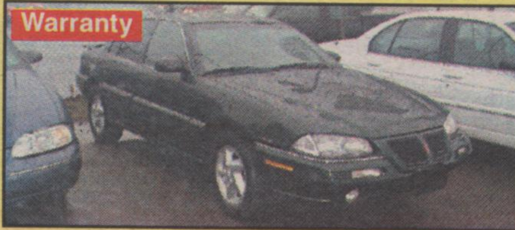
Warranty 2 - 95 GRAND AMs YOUR CHOICE - BOTH GREAT CARS V6, Loaded, Auto $7,800