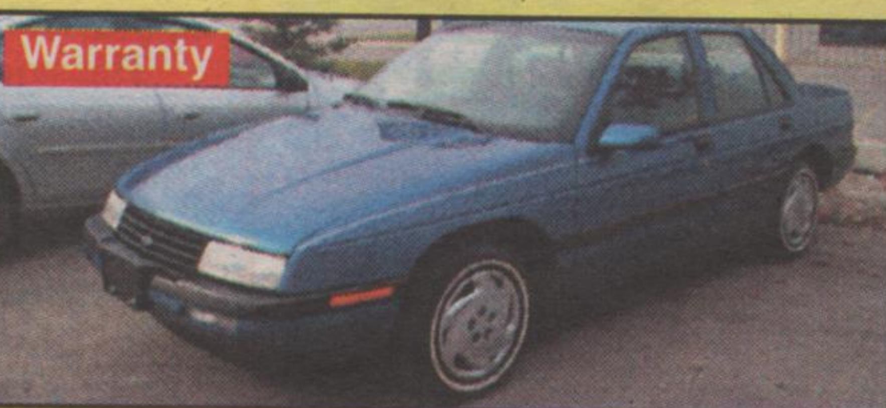
Warranty 93 CORSICA 4 Cyl., Auto, Air, Excellent, reliable cheap transportation $5,500