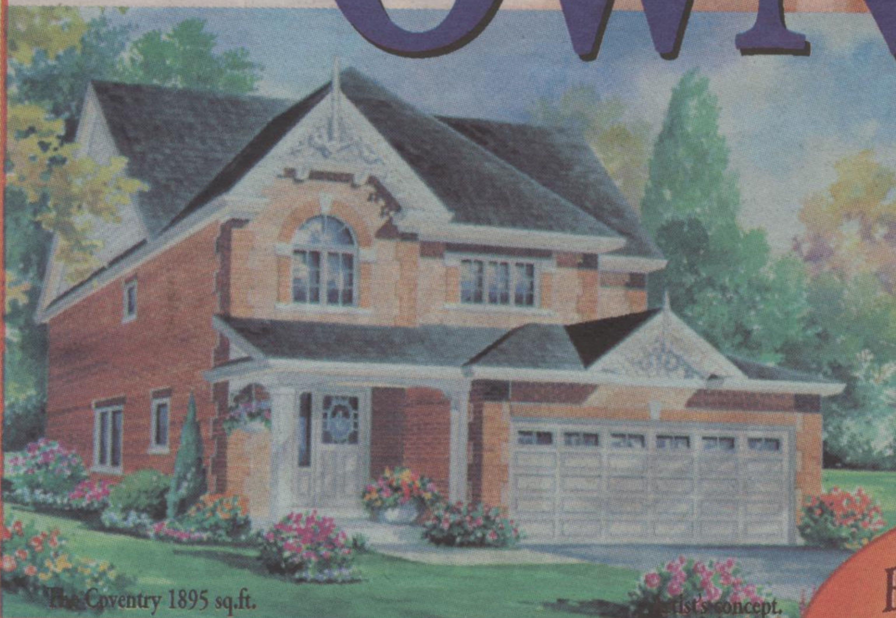
The Coventry 1895 sq.ft.