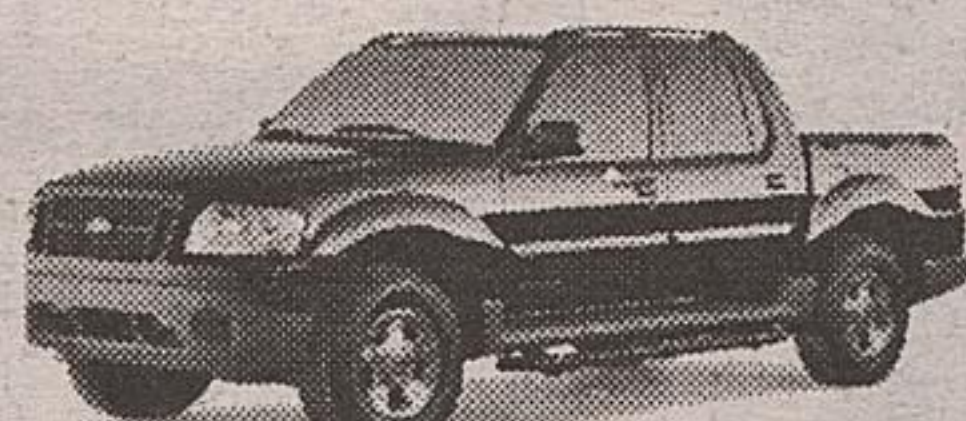
Explorer Sport Trac