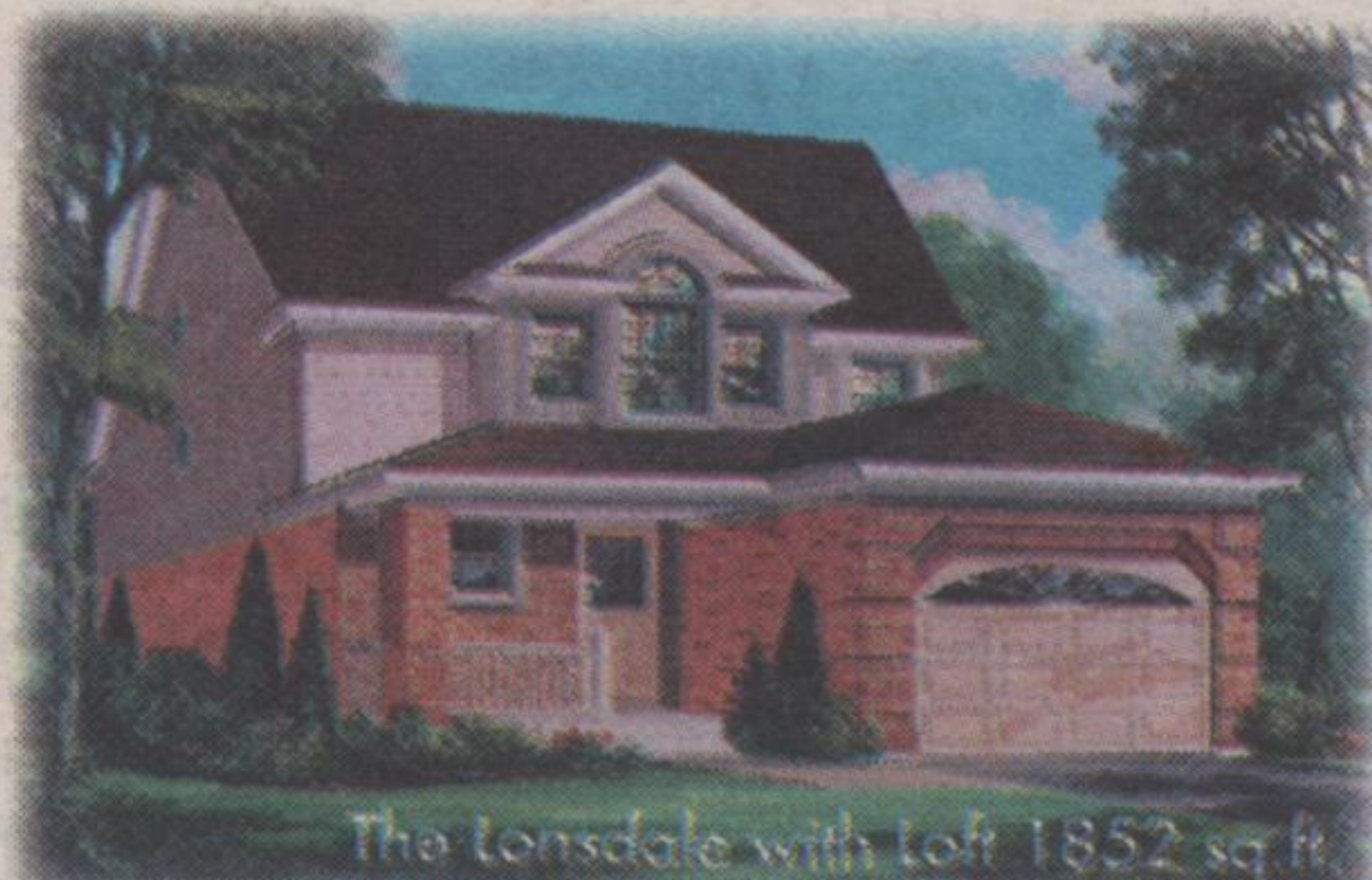
The Tonsdale with loft 1852 sq. ft.

because living in luxury is not an option - it's your right!