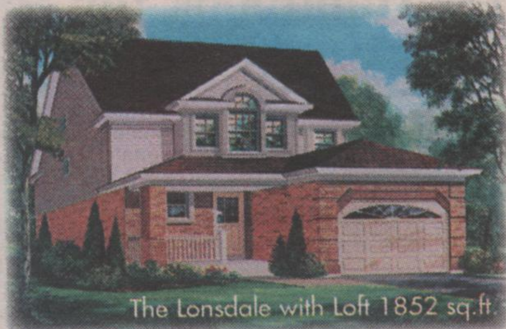
The Lonsdale with Loft 1852 sq.ft.

because living in luxury is not an option - it's your right!