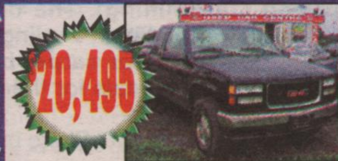
$20,495 1996 GMC SIERRA 1500 Ext. Cab, 4x4, Auto, Air, CD