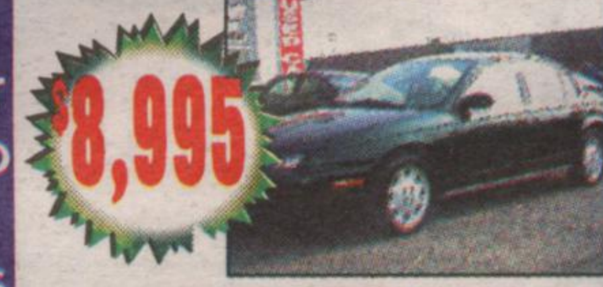
$8,995 1996 SATURN SL2 Auto, Loaded