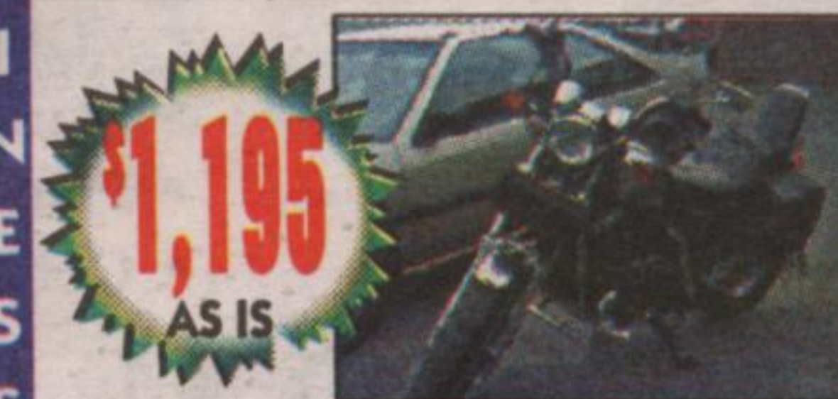
$1,195 AS IS 1983 HONDA SHADOW 750 54,000 kms