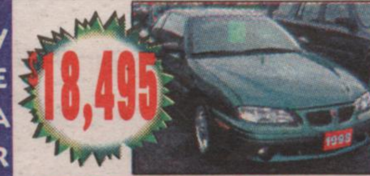
$18,495 1998 PONTIAC GRAND AM GT Coupe, Loaded