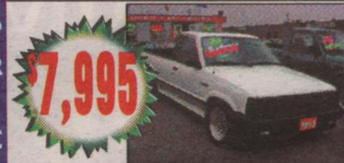
$7,995 1993 MAZDA B2000 P/UP 4 cyl., 5 spd., Stereo