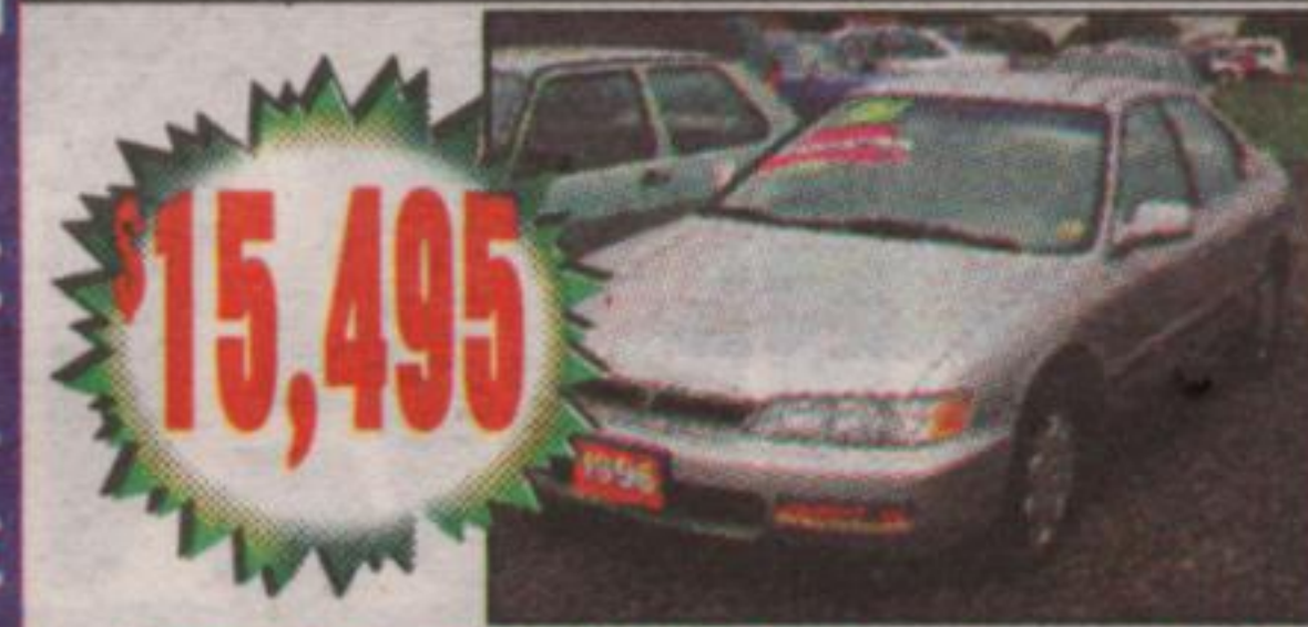
$15,495 1996 ACCORD EX - Loaded 3 to Pick From