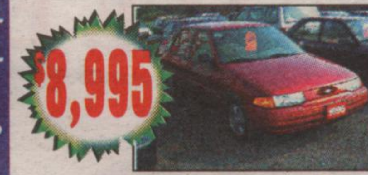
$8,995 1996 ESCORT LX 4 dr. Hatch, Auto, Loaded