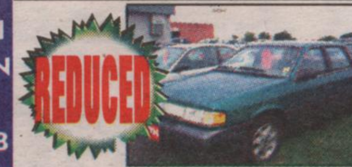
REDUCED 1994 MERCURY TOPAZ •V6 •Auto •Air •Low kms