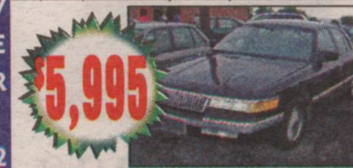
$5,995 1992 GRAND MARQUIS Black Beauty, Loaded.