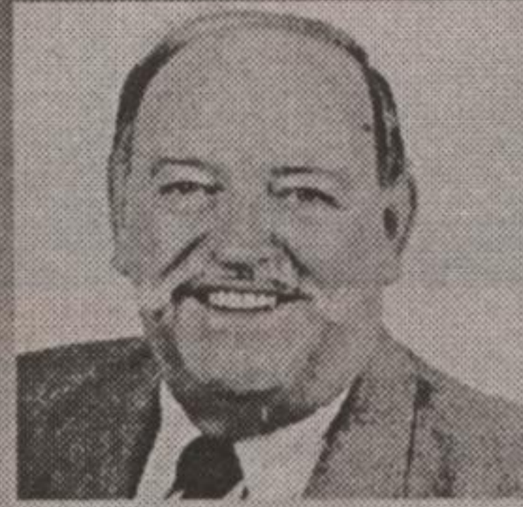
Call BILL ELLIS** Assoc. Broker

This 4 bedroom plan incorporates vaulted great room, breakfast room, foyer and living room with upper hall overlooking. then we add tasteful features and quality construction in this Rydon "Elm" model, for $359,999. Triple garages, why of course! Call Bill** for floor plan and specs.