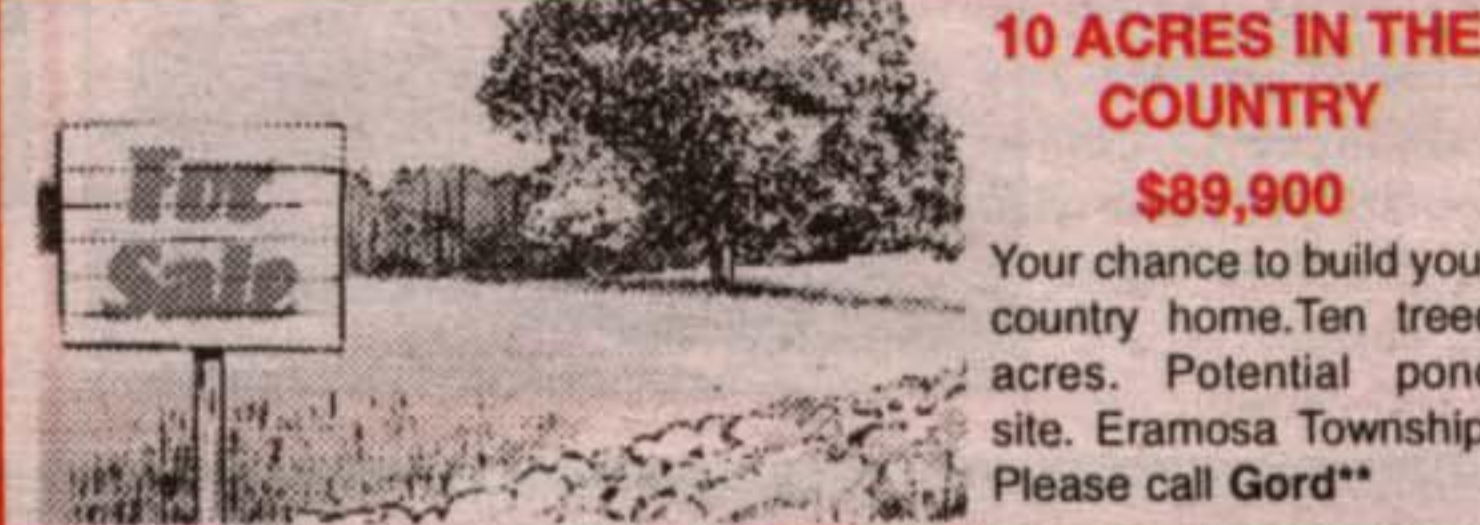
10 ACRES IN THE COUNTRY $89,900 Your chance to build your country home. Ten treed acres. Potential pond site. Eramosa Township. Please call Gord** 10 SCENIC ACRES Town of Acton, very close building for the great area. SOLD $186,000.

NEW BUILDING LOT - $39,000 Estate Subdivision in Belwood - Close to Lake - 3/4 Acre Gord Dawe**, RE/MAX Blue Springs Realty (Halton) Corp. 1-888-833-1945