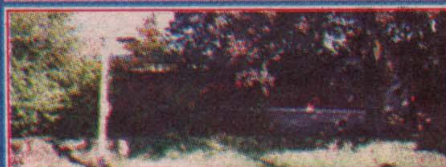
MATURE IN TOWN BUILDING LOT 55 ft X 125. ft. lot with large trees. Near Fairy Lake. Close to downtown stores and services. Near golf. Ideal lot for raised bungalow with lower level for inlaw suite. Listing agent works with local builder who will design build to suit. Price $59,000. Development fees unpaid. Call John*.

This Georgian beauty is situated on 5 wooded acres within 10 minutes of 401. What an ideal natural setting and location!! An immaculate home with generous room sizes, greenhouse kitchen, sunken family room with cozy fireplace, formal living room and dining room featuring hardwood floors. Quality abounds in this special home. You won't be disappointed. Why not give me a call for more details on this property offered at $399,800. Call Marilyn*.