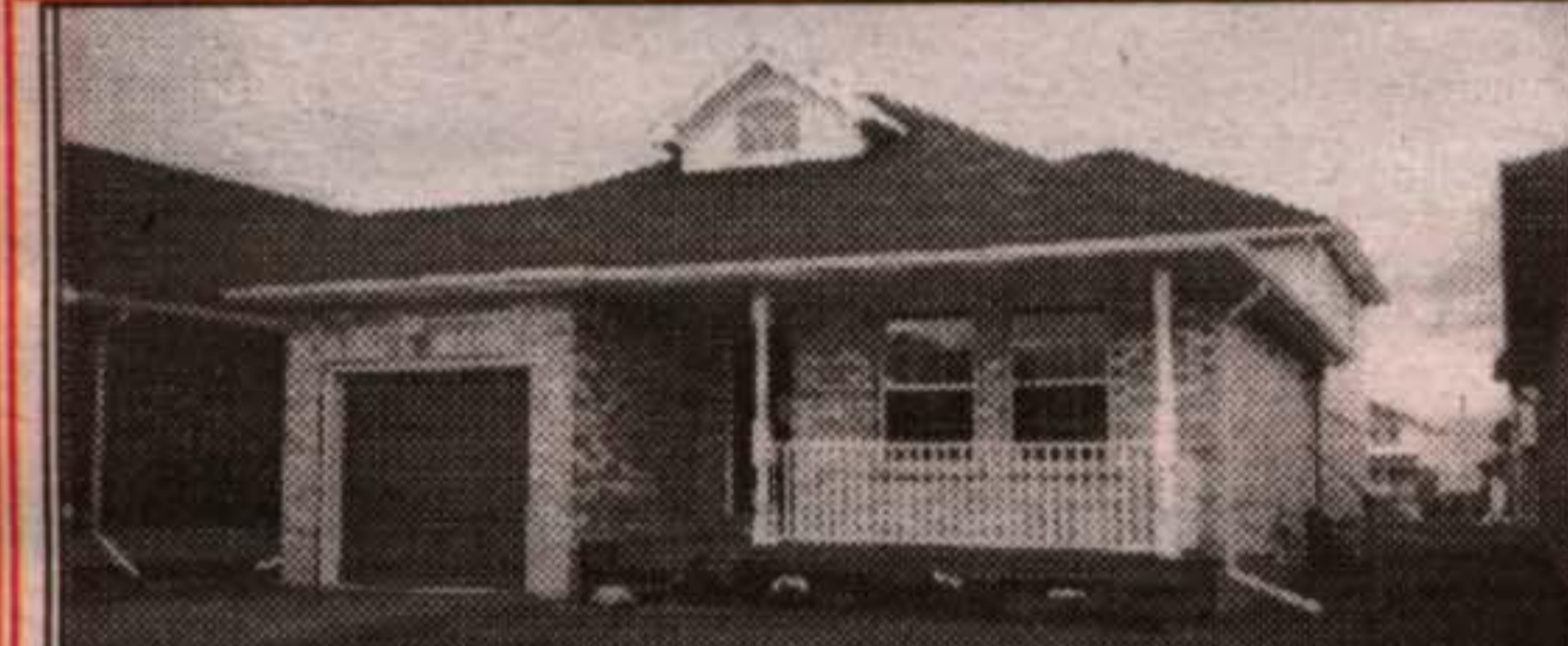
SPACIOUS FAMILY BACKSPLIT - FERGUS - $159,900 Living room, dining room, kitchen with cathedral & vaulted ceilings. Open concept, oak kit, cabinets, walkout from dining room. Large finished family room with gas FP & walkout, 2 - 4 pc. washrooms, 3 bedrms, walk-in from garage, fridge/stove/washer/dryer/dishwasher included. Please call Gord** or Michelle* to view.

RESTAURANT: Upscale licensed 60 seat dining lounge. Situated in a quaint older home near the olde Hide House, wheelchair accessible, parking meticulously kept, excellent reputation, great opportunity for future growth. Turn key operation. $99,000. Gord Dawe**, RE/MAX Blue Springs Realty (Halton) Corp. 1-888-833-1945.