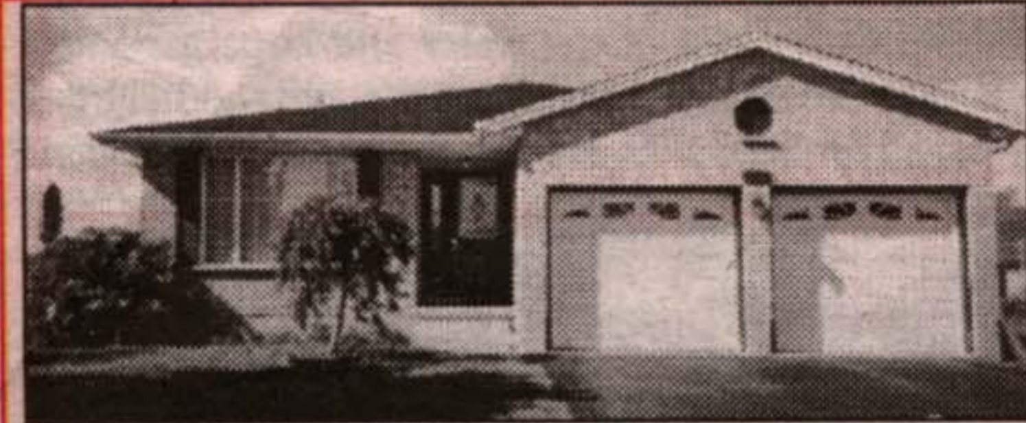
SPACIOUS BACKSPLIT BACKING ONTO FARMLAND $229,900 Hardwood and ceramic flooring. Leaded glass doors & LR. Large eat-in kitchen with walkout to side deck. 3+1 bedrooms. Finished family room with gas fireplace, basement unfinished, central air, central vac (2357 sq. ft. of living space). Large 66' x 132' lot. Bright, spacious and backing onto farmland. Please call Michelle* or Gord** to view.