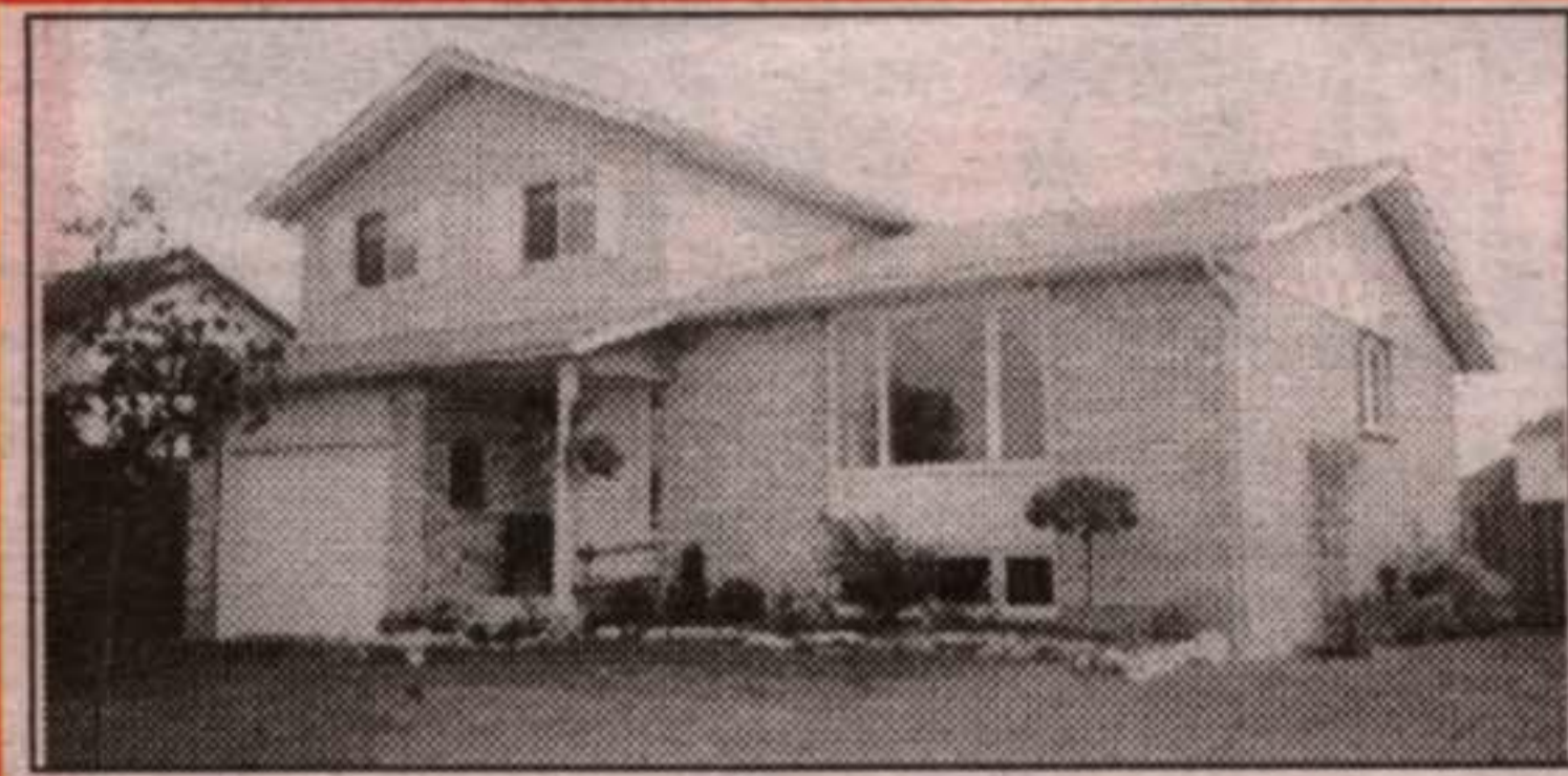
PERFECT FAMILY HOME ON LARGE LOT $209,900 Bright, spacious sidesplit on large lot close to conservation. Cathedral ceilings, oak kitchen, main floor family room with walkout to large deck. Finished rec room, gas heating, central air, landscaping. Please call Michelle* to view.

GIVE US A MINUTE OF YOUR TIME AND WE WILL GIVE YOU YEARS OF EXPERIENCE