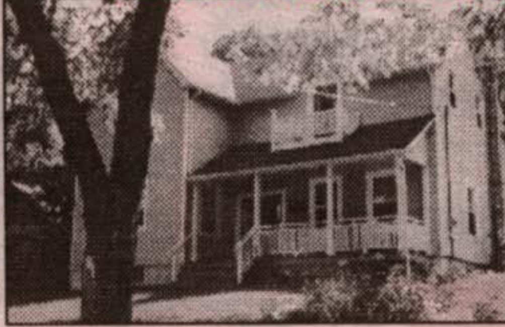
Majestically set on large 66 x 132 lot backing onto farmland in Village of Rockwood. Spacious kitchen with maple cabinets, ceramic tile, built-in appliances, breakfast nook & walkout to deck & private treed back yard, 10' ceilings, oak & pine floors, French doors, large master with vaulted ceiling, ensuite & walk-out to balcony. Adjoining nursery/reading room. Unique blend of old & new. Please call Michele Dawe*.

OPEN HOUSE - SUNDAY, 1-4 P.M. 239 Harris St., Rockwood SPACIOUS OLDER STYLE HOME BACKING ONTO FARMLAND $219,900