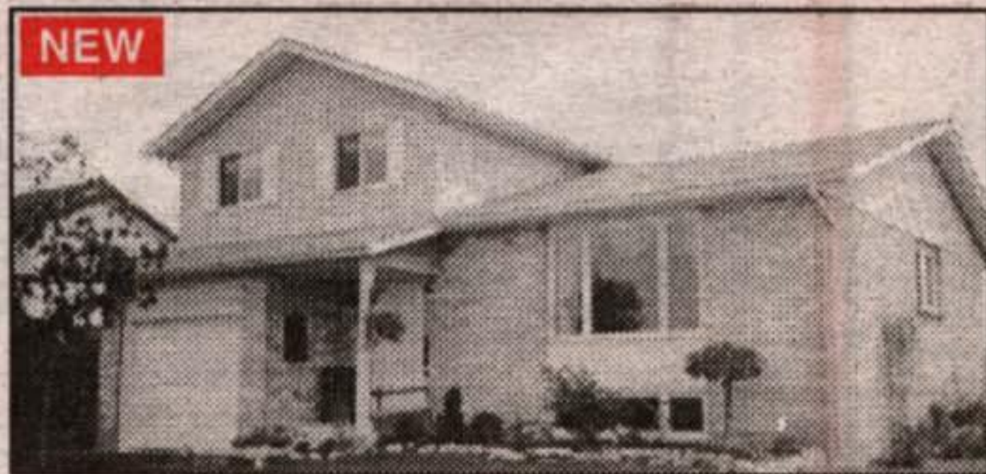
PERFECT FAMILY HOME ON LARGE LOT $209,900

Bright, spacious sidesplit on large lot close to conservation. Cathedral ceilings, oak kitchen, main floor family room with walkout to large deck. Finished rec room, gas heating, central air, landscaping. Please call Michelle* to view.