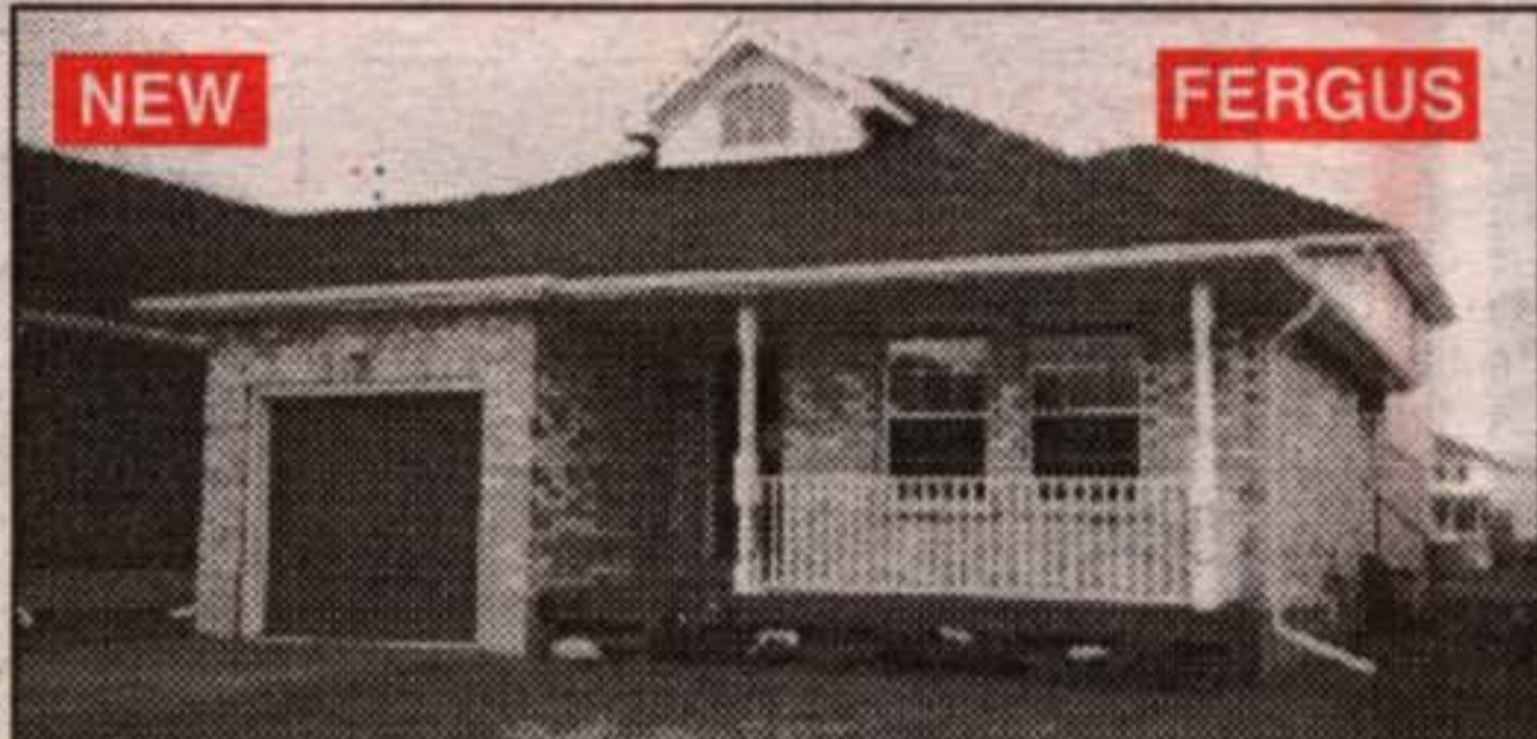
SPACIOUS FAMILY BACKSPLIT - $159,500

GORD DAWE** Assoc. Broker 519-856-4348 1-888-656-4348