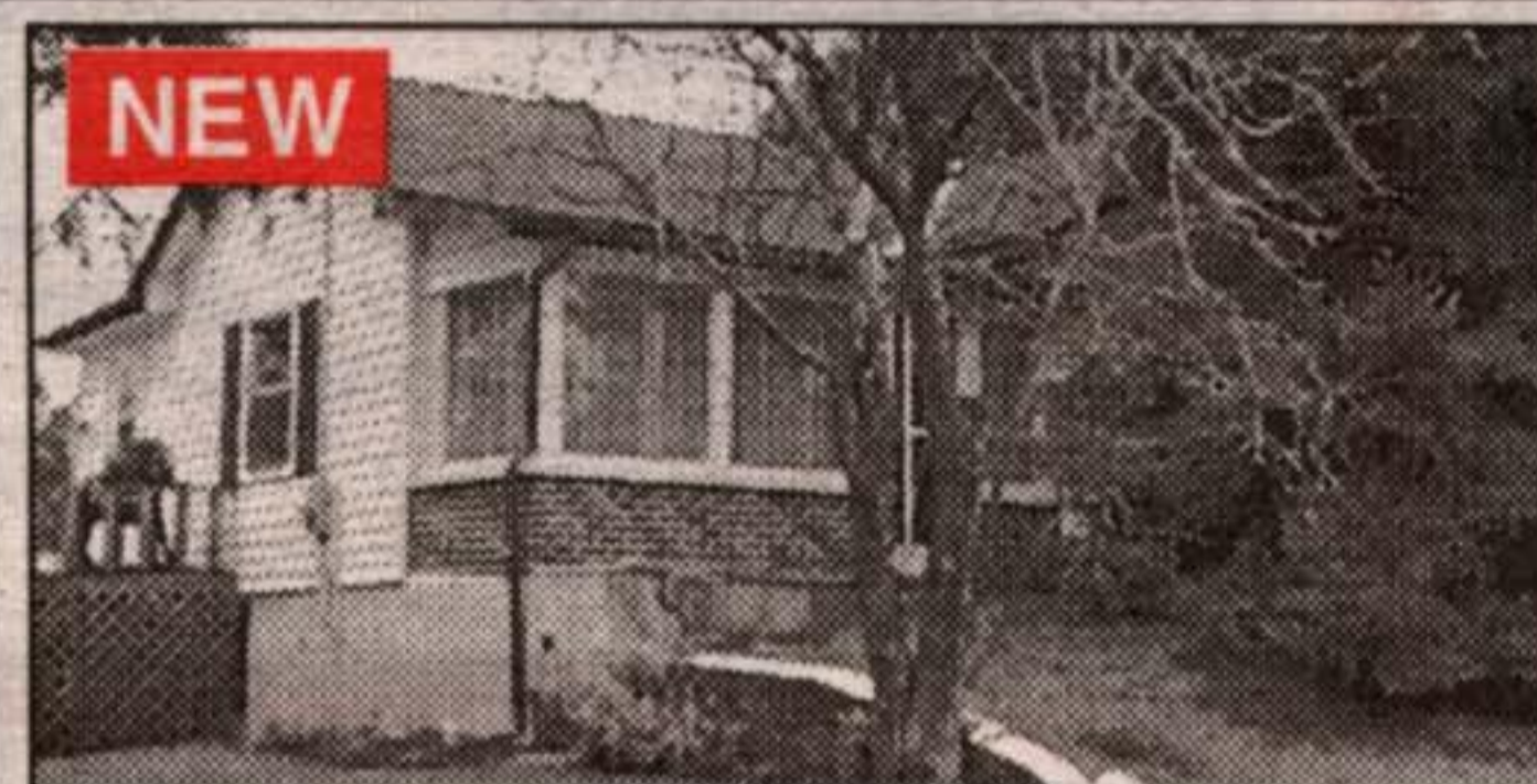
PRETTY PROPERTY WITH 2 PONDS

1.4 acres in quiet hamlet. The cosy 2 bedroom home is well maintained. Kitchen has pine cupboards, large living room with sunporch across the front. There is a large deck and interlocking brick patio at the back. Perfect for the first time purchaser or retiree. $168,900.