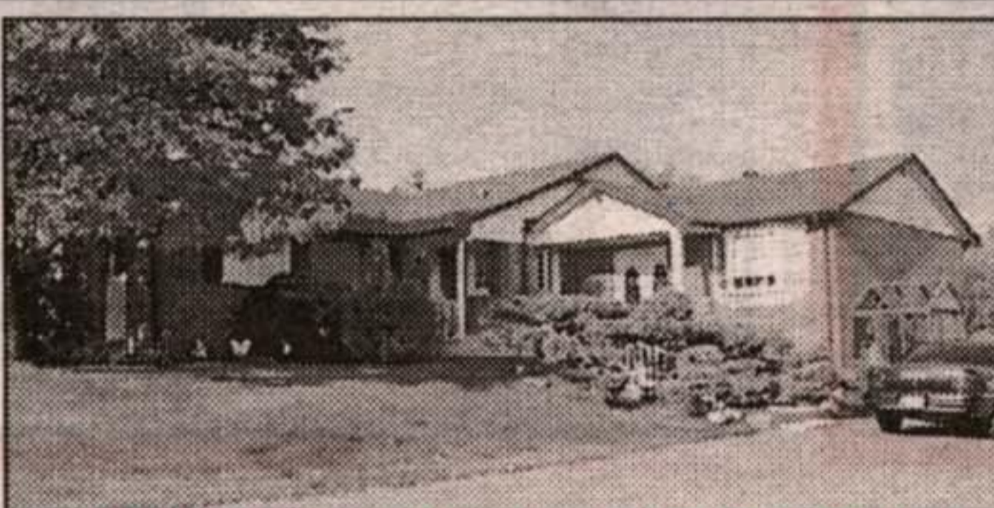
10 ACRE RANCH/HOBBY FARM EDGE OF TOWN!

Stunning escarpment property is ideally located close to Georgetown. Lovely home has been extensively upgraded & improved with top quality throughout plus a 3000 sq. ft. workshop with office plus a 6 stall barn & much more. Will suit the most discriminating buyer. RM448-97