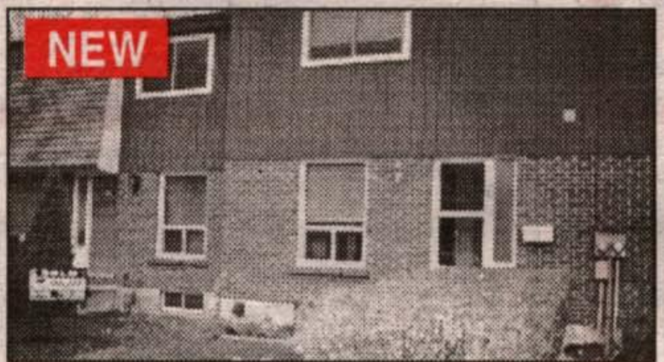
FIRST TIME BUYERS...

Look no further, this spacious 3 bedroom townhouse is perfect for the young family starting out. Large living area, spacious bedrooms, rec room perfect for kids. Lots of upgrades, call today for viewing.