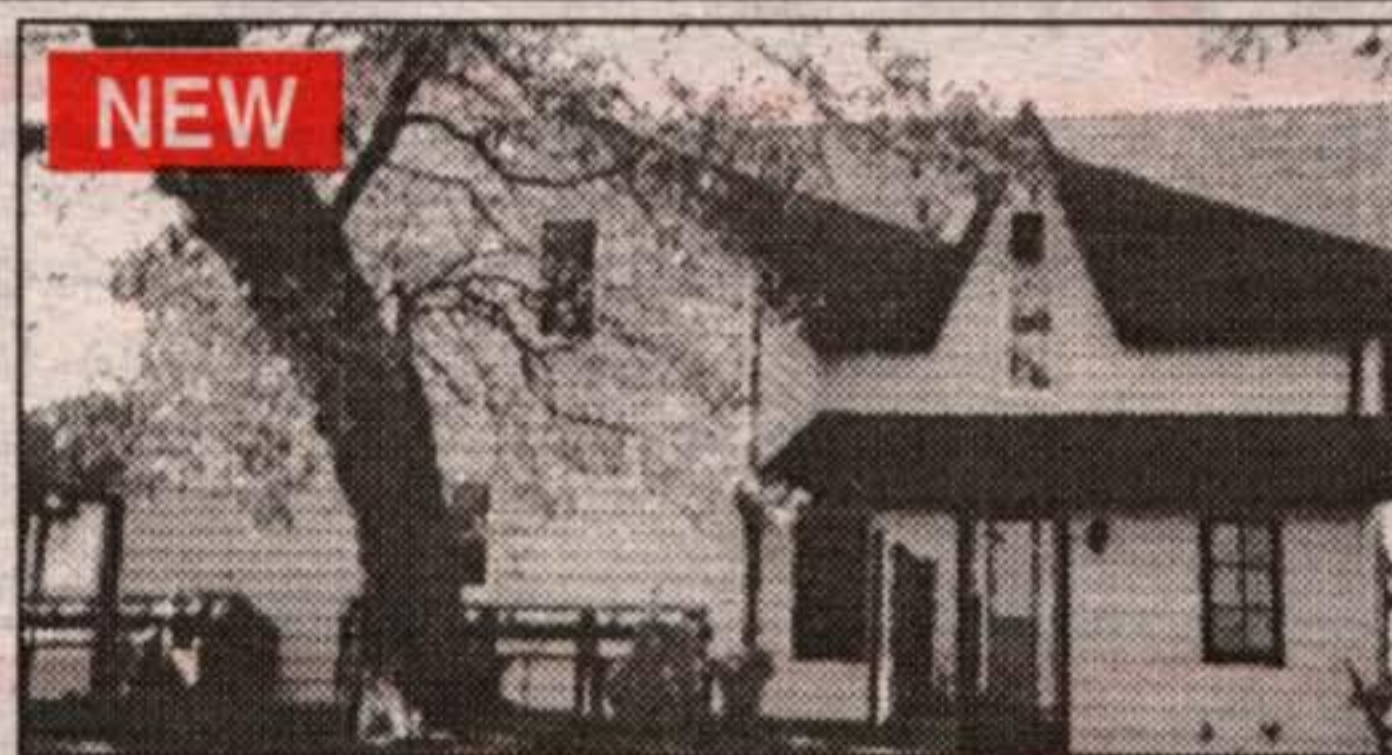
CENTURY HOME WITH WORKSHOP - $234,900

Large 4 bedroom country home with 20 x 33 workshop, home boasts large eat-in kitchen with pine cabinets, gas fireplace stove, walkout to screened porch & party room. Formal living room with airtight stove, 2 1/2 washrooms. This is a gorgeous home in great condition, all new windows, siding, roof, etc. on 2.71 acres.