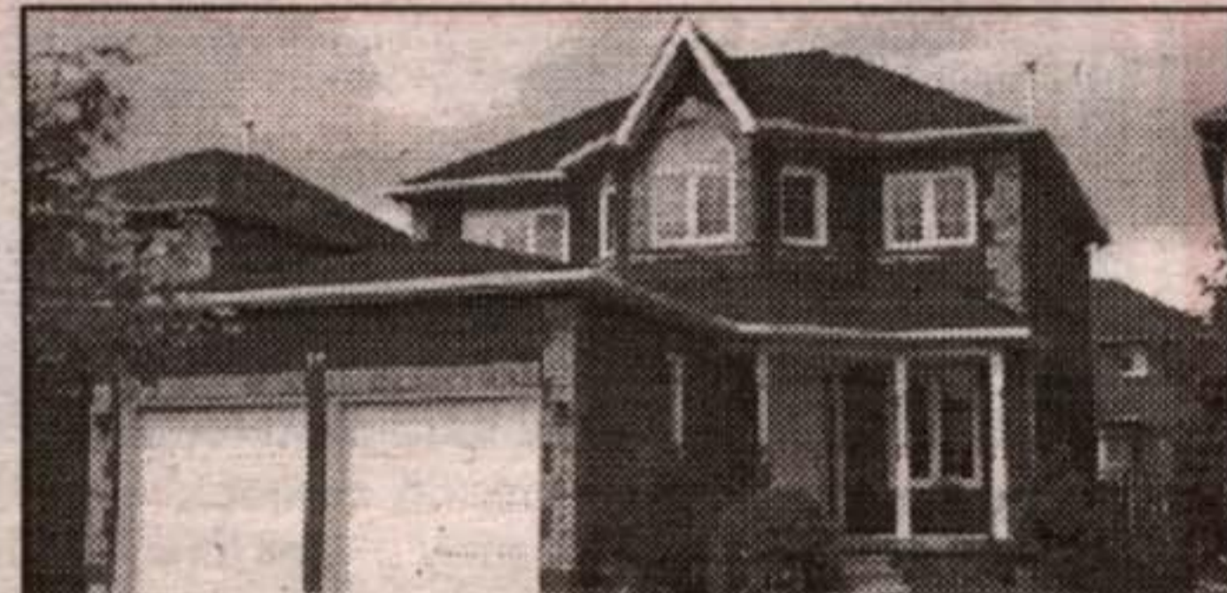
ALL YOUR DREAMS CAN COME TRUE

MICHELLE DAWE* Sales Rep. 519-856-4348 1-888-656-4348