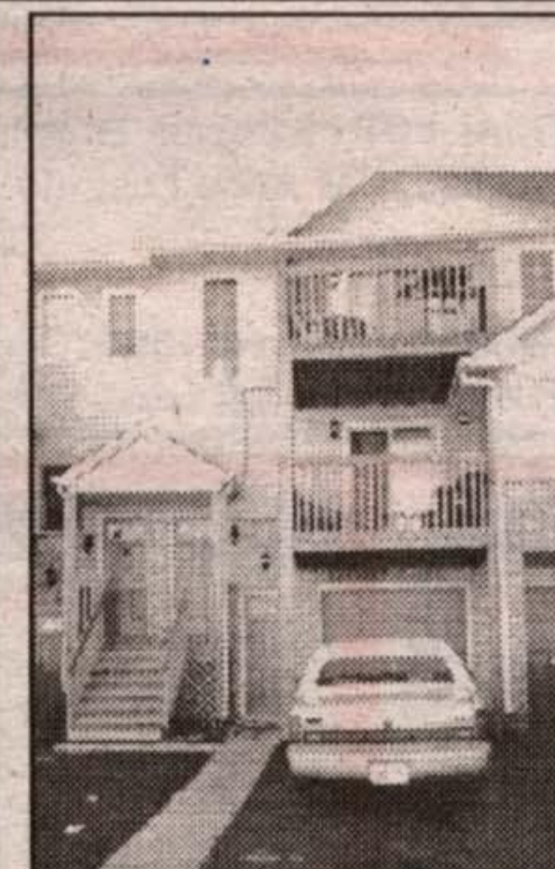
YOU COULD BE HOME ALREADY!

Super Avebury in Georgetown, 2 storey, 3 bedrooms, garage, centralair, huge master, French doors. Great Christmas gift. $132,500.