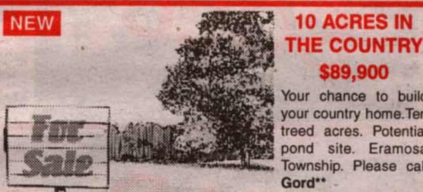
10 ACRES IN THE COUNTRY $89,900

Majestically set on large 66 x 132 lot backing onto farmland in Village of Rockwood. Spacious kitchen with maple cabinets, ceramic tile, built-in appliances, breakfast nook & walkout to deck & private treed back yard, 10' ceilings, oak & pine floors, French doors, large master with vaulted ceiling, ensuite & walkout to balcony. Adjoining nursery/reading room. Unique blend of old & new. Please call Michele Dawe*.