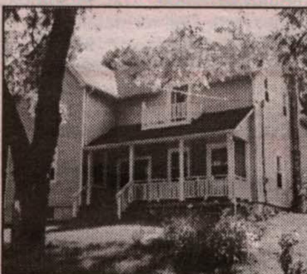
SPACIOUS OLDER STYLE HOME BACKING ONTO FARMLAND $224,900

Majestically set on large 66 x 132 lot backing onto farmland in Village of Rockwood. Spacious kitchen with maple cabinets, ceramic tile, built-in appliances, breakfast nook & walkout to deck & private treed back yard, 10' ceilings, oak & pine floors, French doors, large master with vaulted ceiling, ensuite & walkout to balcony. Adjoining nursery/reading room. Unique blend of old & new. Please call Michele Dawe*.