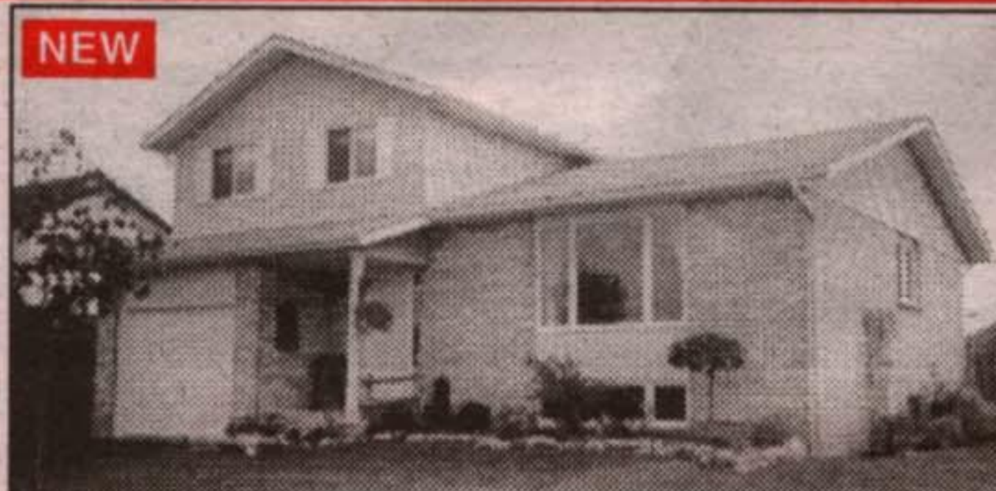
PERFECT FAMILY HOME ON LARGE LOT $209,900

GIVE US A MINUTE OF YOUR TIME AND WE WILL GIVE YOU YEARS OF EXPERIENCE