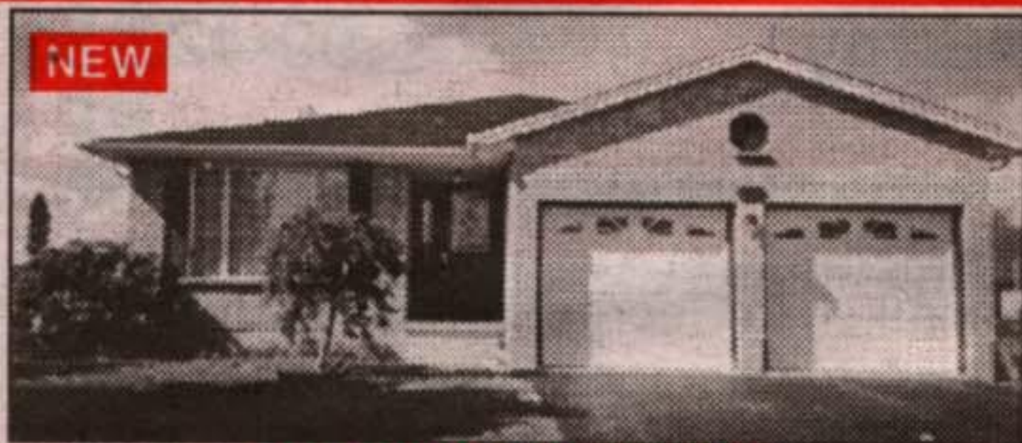
SPACIOUS BACKSPLIT BACKING ONTO FARMLAND $229,900

Living room, dining room, kitchen with cathedral & vaulted ceilings. Open concept, oak kit. cabinets, walkout from dining room. Large finished family room with gas FP & walkout, 2 - 4 pc. washrooms. 3 bedrms, walk-in from garage, fridge/stove/washer/dryer/dish-washer included. Please call Gord** or Michelle* to view.