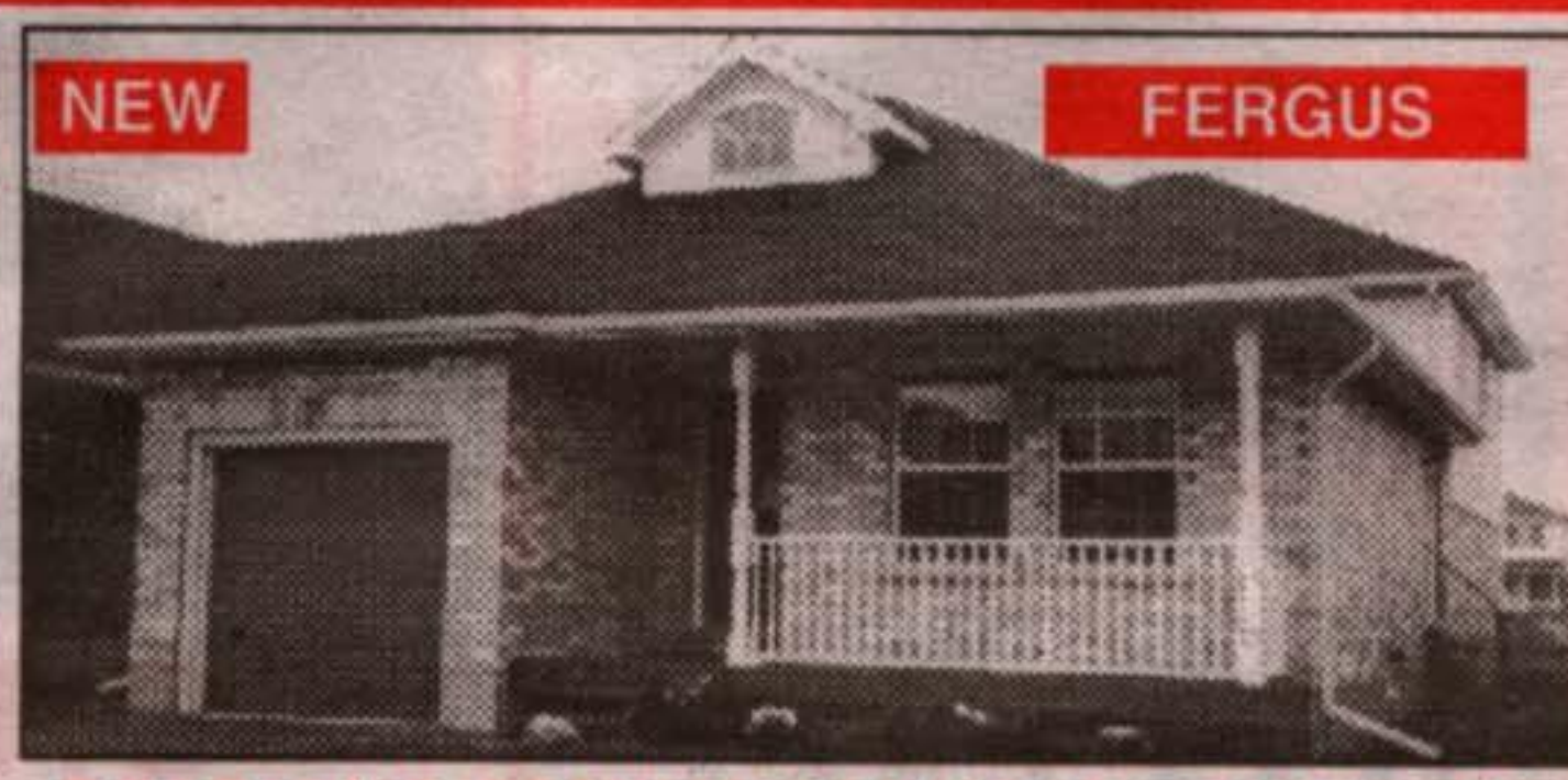
SPACIOUS FAMILY BACKSPLIT- $159,900

Bright, spacious sidesplit on large lot close to conservation. Cathedral ceilings, oak kitchen, main floor family room with walkout to large deck. Finished rec room, gas heating, central air, landscaping. Please call Michelle* to view.