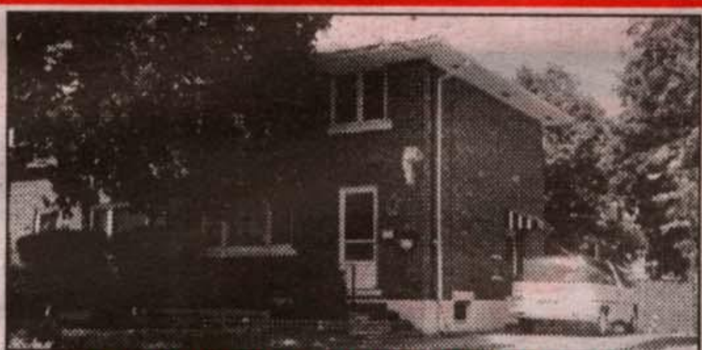
$1000 DOWN OR LESS!! THIS COULD BE YOUR OPPORTUNITY TO OWN A HOME!! $115,900

Hardwood and ceramic flooring. Leaded glass doors & LR. Large eat-in kitchen with walkout to side deck. 3+1 bedrooms. Finished family room with gas fireplace, basement unfinished, central air, central vac (2357 sq. ft. of living space). Large 66' x 132' lot. Bright, spacious and backing onto farmland. Please call Michelle* or Gord** to view.