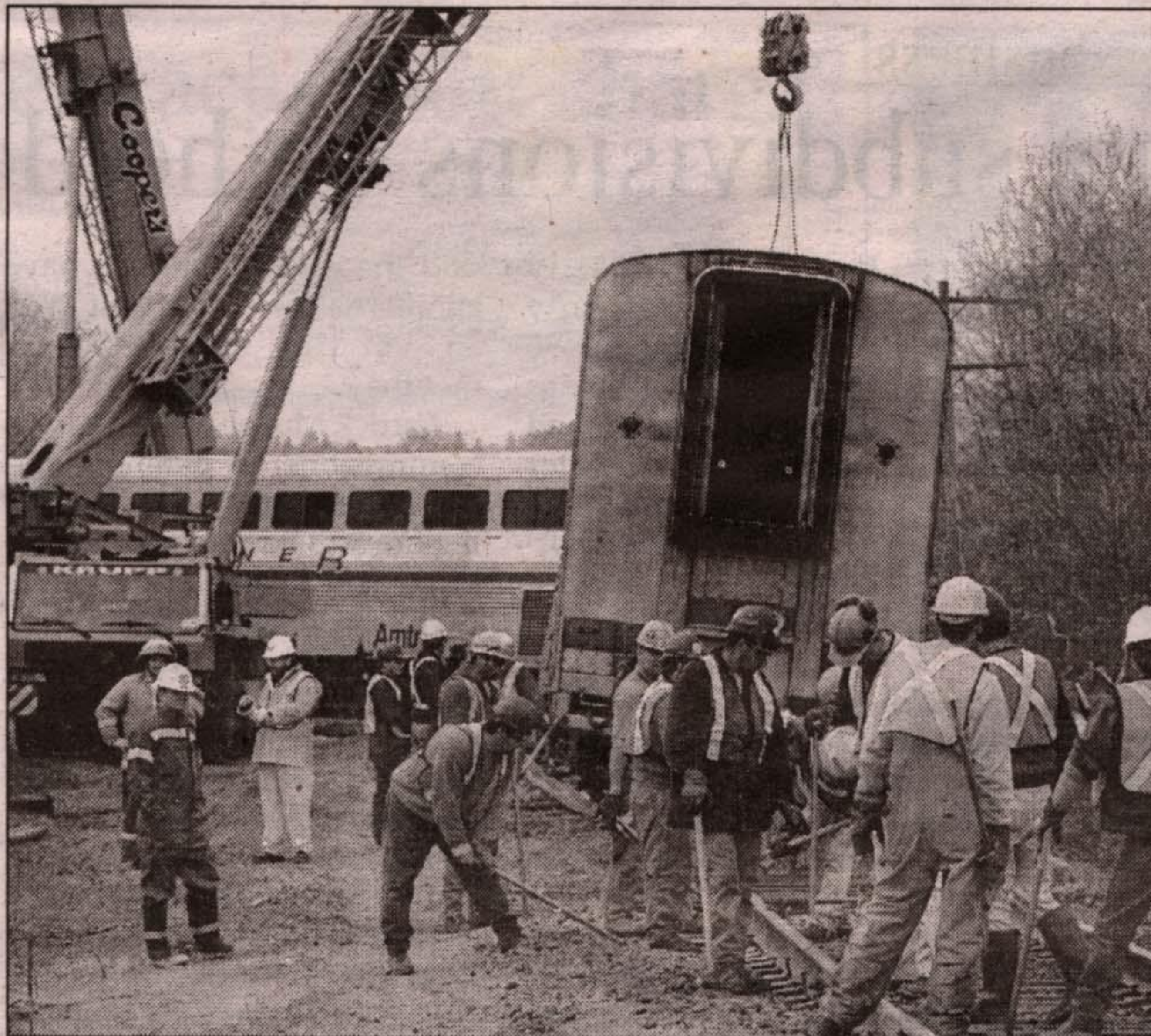
Workers clean up and repair the tracks at the Fourth Line crossing Wednesday where a 22-year-old truck driver was killed in a collision with a VIA passenger train Tuesday morning.