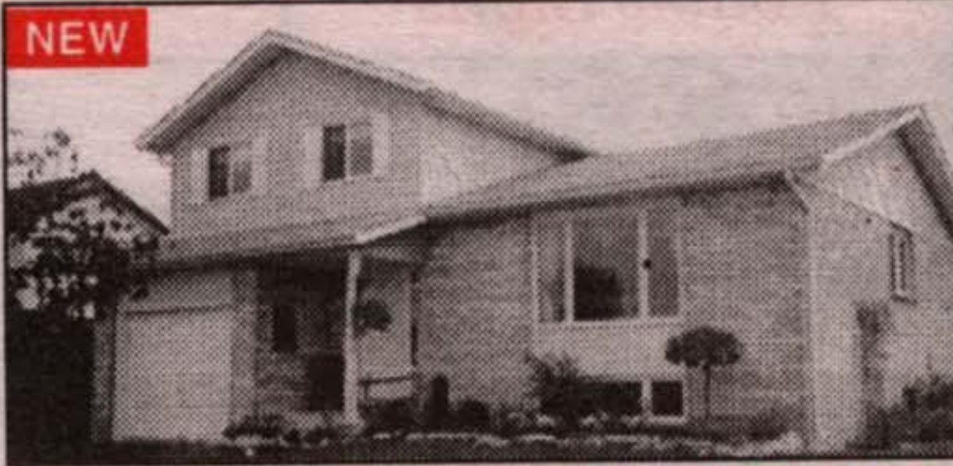
PERFECT FAMILY HOME ON LARGE LOT $209,900

Bright, spacious sidesplit on large lot close to conservation. Cathedral ceilings, oak kitchen, main floor family room with walkout to large deck. Finished rec room, gas heating, central air, landscaping. Please call Michelle* to view.