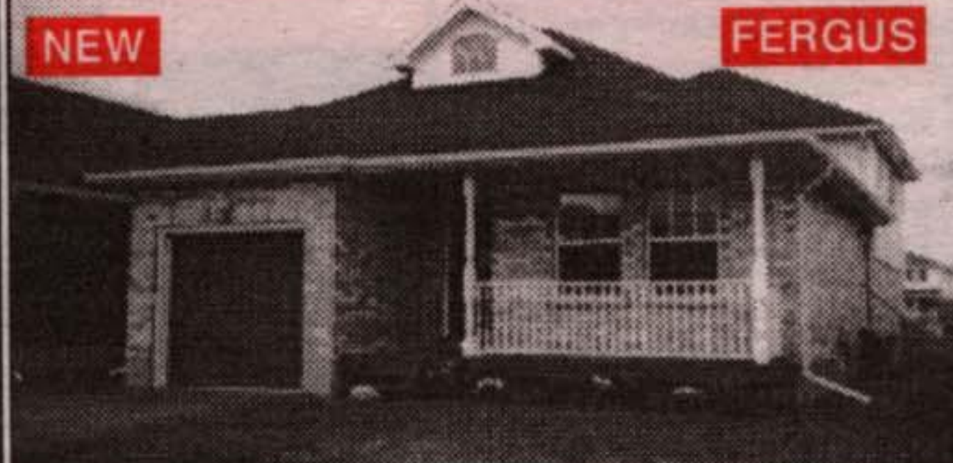
SPACIOUS FAMILY BACKSPLIT - $162,500

GORD DAWE** Assoc. Broker 519-856-4348 1-888-656-4348