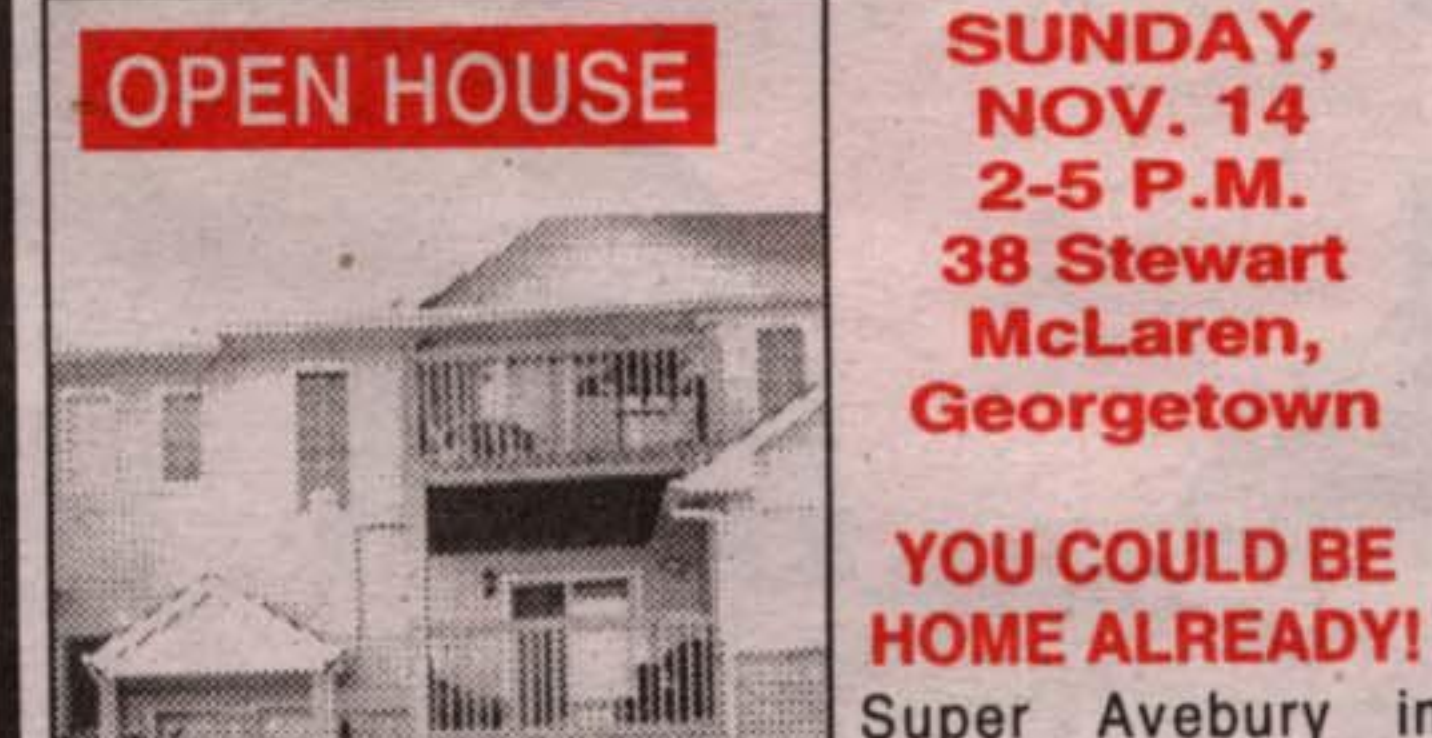
OPEN HOUSE SUNDAY, NOV. 14 2-5 P.M. 38 Stewart McLaren, Georgetown

YOU COULD BE HOME ALREADY! Super Avebury in Georgetown, 2 storey, 3 bedrooms, garage, centralair, huge master, French doors. Great Christmas gift. $132,500.