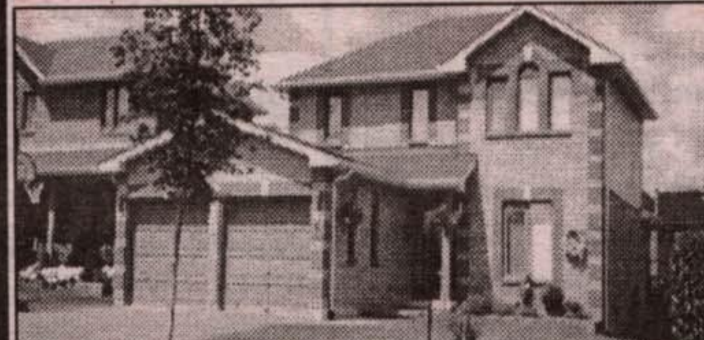
DON'T MISS OUT!

Spacious, open concept home, less than 4 years old. Main flr. family rm, & laundry rm. Fully fenced backyard, spiral oak staircase ascending to 2nd floor with large mst. bdrm, full ensuite and walk in closet. $212,900. Call for info and appointment for viewing. Janis** 853-2086.