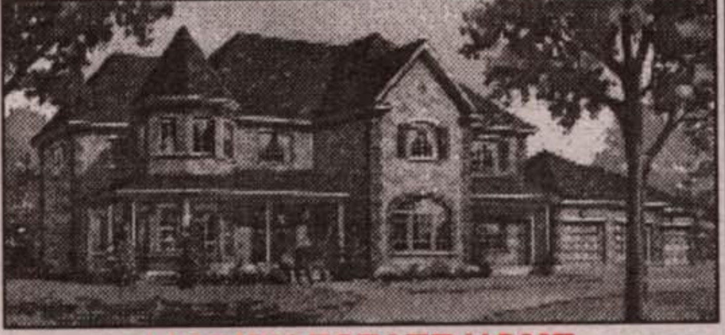
LUXURY ESTATE HOME