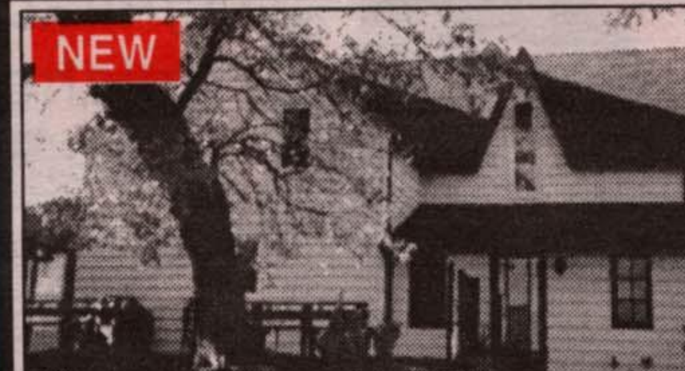
CENTURY HOME WITH WORKSHOP - $234,900

Large 4 bedroom country home with 20 x 33 workshop, home boasts large eat-in kitchen with pine cabinets, gas fireplace stove, walkout to screened porch & party room. Formal living room with airtight stove, 2 1/2 washrooms. This is a gorgeous home in great condition, all new windows, siding, roof, etc. on 2.71 acres.