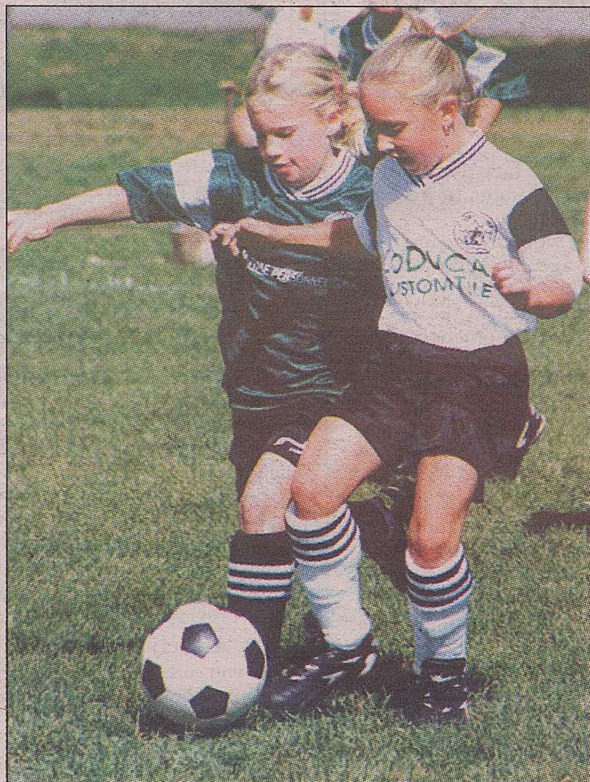
Loduca Tile (white jerseys) and On Time Personnel squared off in girls under-8 division action during the Georgetown Soccer Club's Finals Day held Saturday at the Croatian Centre.