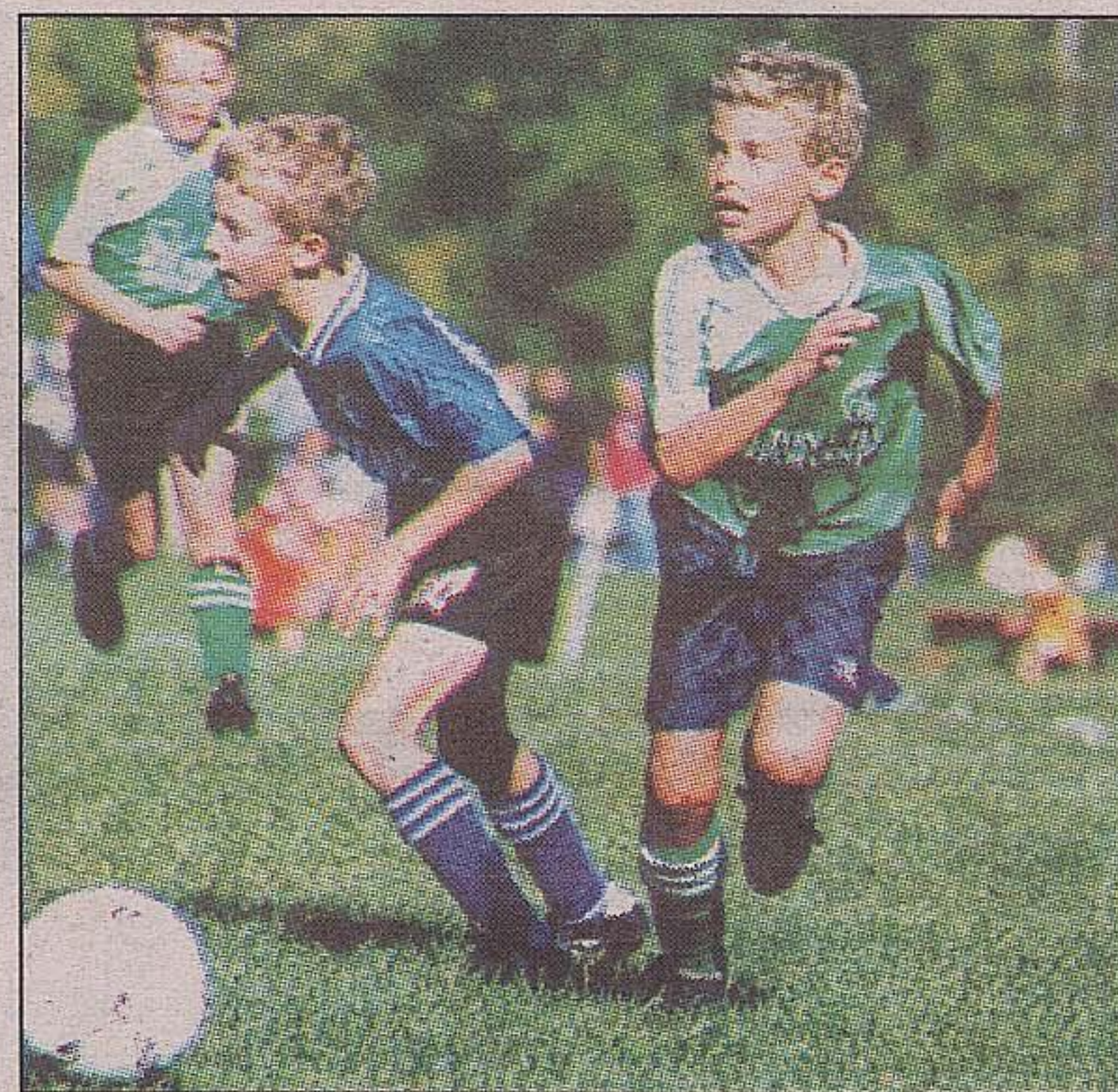
A Capital Ford player (left) breaks away from Halton Hills Speech Centre opponent during the boys under-10 championship final won by the Speech Clinic Saturday at the Croatian Centre.

League champions: State Farm Insurance. Cup Champions: Commerce Software. Runner-up: State Farm Insurance.