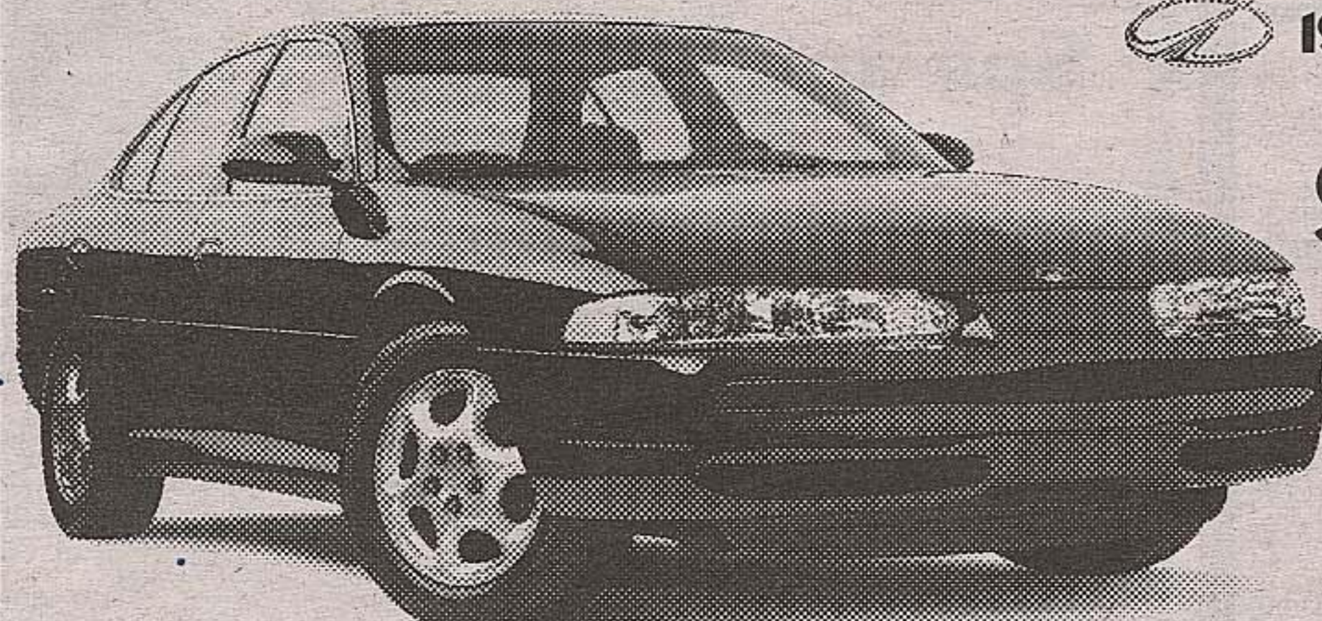
1999 Oldsmobile Intrigue