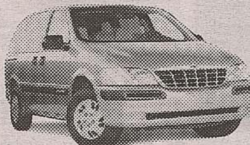
1999 Chevy Venture