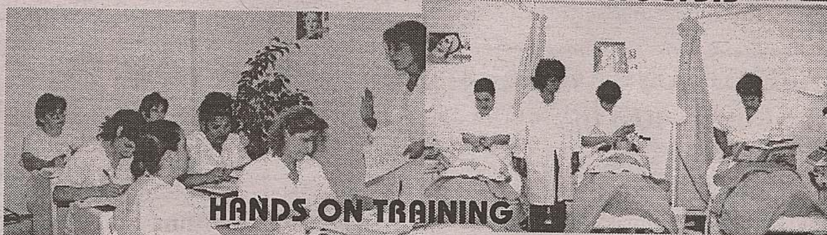
HANDS ON TRAINING

Registered with the Ministry of Education and Training Members of the Ontario and National Association of Career Colleges