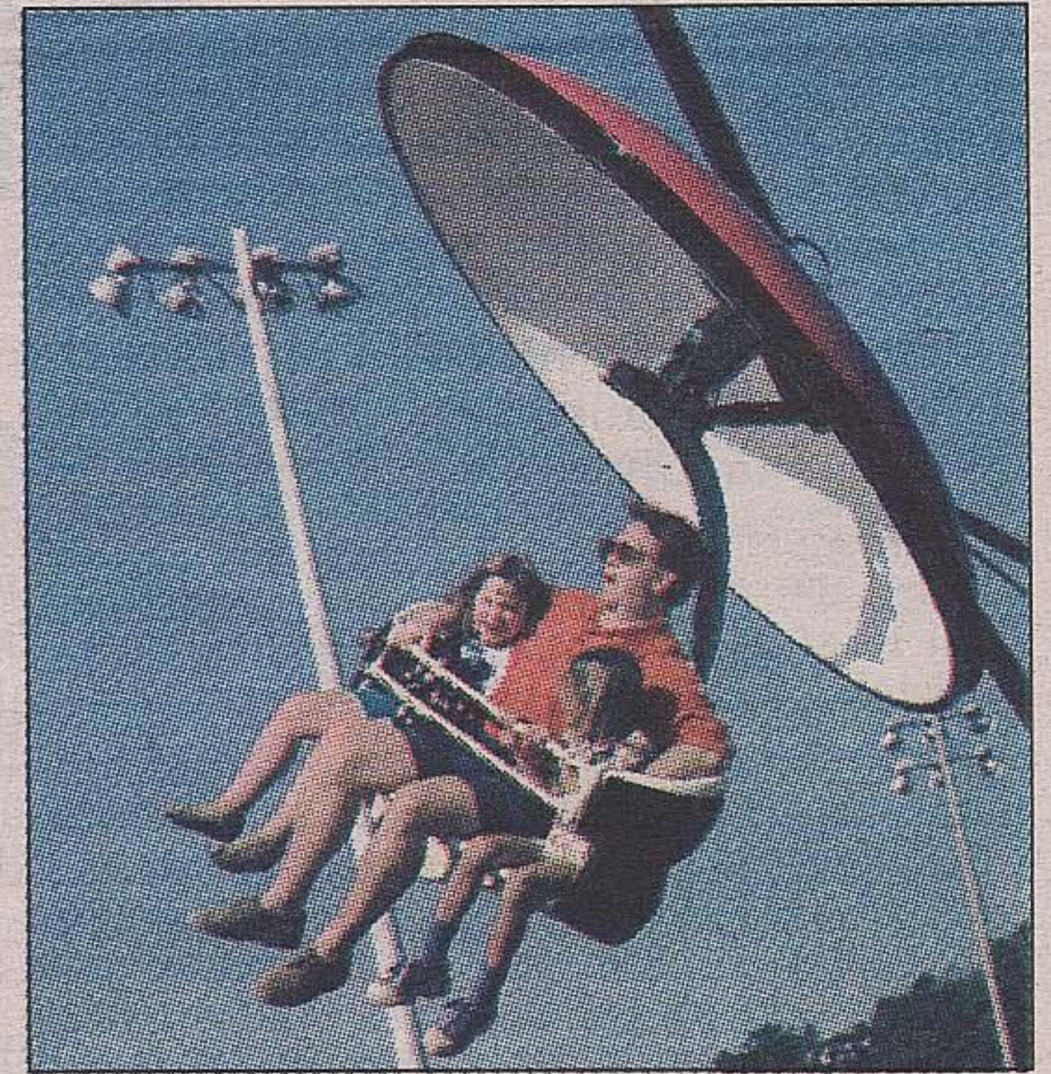
The Georgetown Fall Fair midway will be sure to please again this year.

Admission is $6 for adults Saturday and Sunday and $5 on Friday. Children aged 7 to 12 get in for $3 every day and children 6 and under are admitted free. A weekend pass is available for $12 per person.