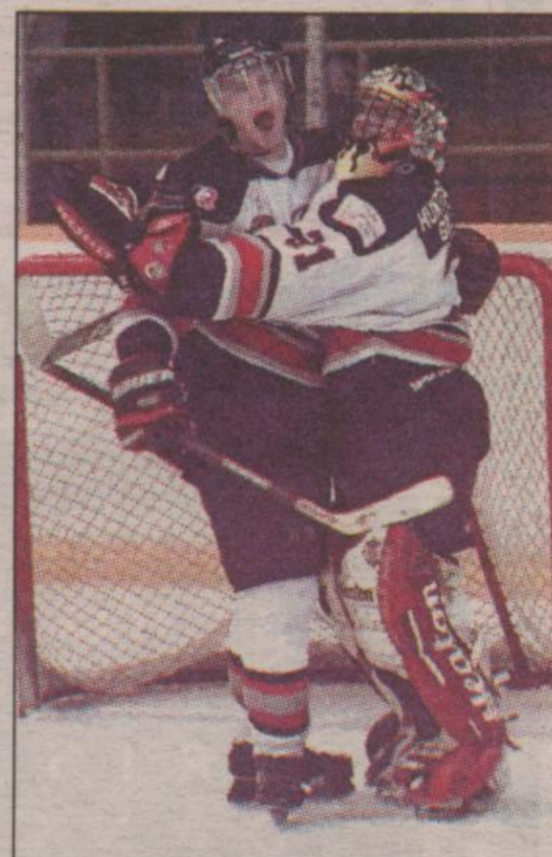
The Georgetown Raiders are hoping to give their fans another season to shout about this year.

The Raiders open the exhibition season tonight (Friday) in Milton at 7:30 p.m.