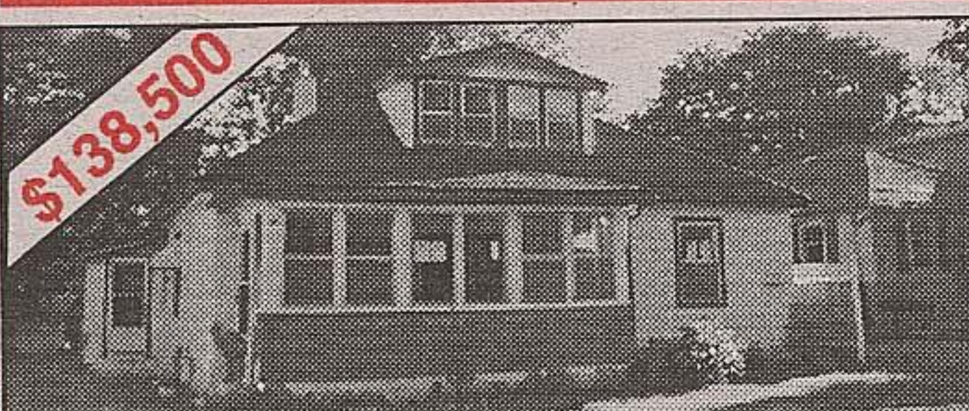
Georgetown Duplex Has 2 separate