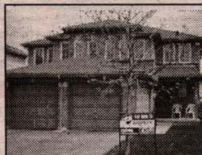
5 YEAR NEW SEMI

In Heart Lake area of Brampton. 3 bedrooms, 2 baths, large family/kitchen. Yard overlooks greenbelt.