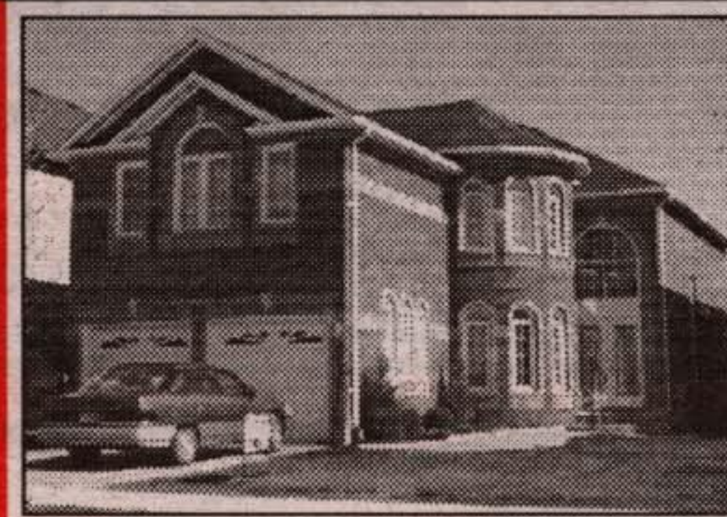
FERNBROOK BEAUTY - BRING THE IN-LAWS

Gorgeous Tribute 2800 sq. ft. 4 bedroom home on a 50 ft. fully fenced yard with thousands spent on upgrades located on a quiet court close to 10th Line. Some of the upgrades include: masonry woodburning fireplace in family room, AM/FM radio intercom throughout the home, over $8,000 spent on landscaping, walkway & steps, C/A & CVAC, upgraded carpet, upgraded maple kitchen cabinets etc. This home is priced at $314,900. Call Dave Krause* to view.