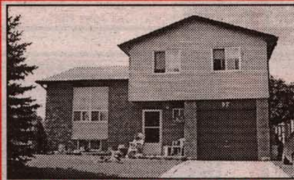
GORGEOUS SIDESPLIT WITH LARGE LOT

Are just two of the features of this 5 bedroom home in Georgetown. The ravine lot + 17 x 34 ft. marbelite pool are wonderful. The home features all new windows (5 year warranty), new front door, new patio door, new broadloom, freshly painted, 5 pc. ensuite off master bedroom. Furnace new in '95. Roof 10 years old. C/A. Professionally finished basement with woodburning stove. Priced at $229,000. Call Dave Krause* to view.