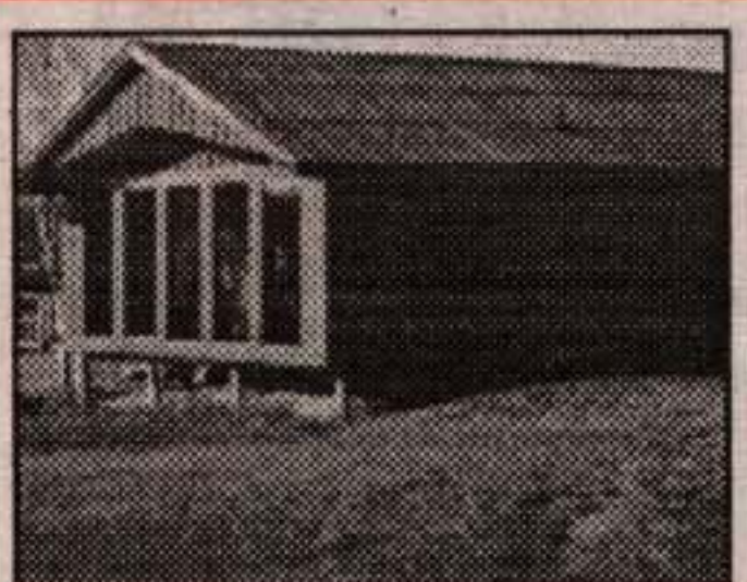
BEAUTIFUL 8 YEAR OLD LOG HOME

100 acres of unspoiled wilderness just 2 minutes from town, 15 mins. to 401 or 30 minutes to airport. Build your dream home. Complete privacy. Call Tony* or Carol* for details.