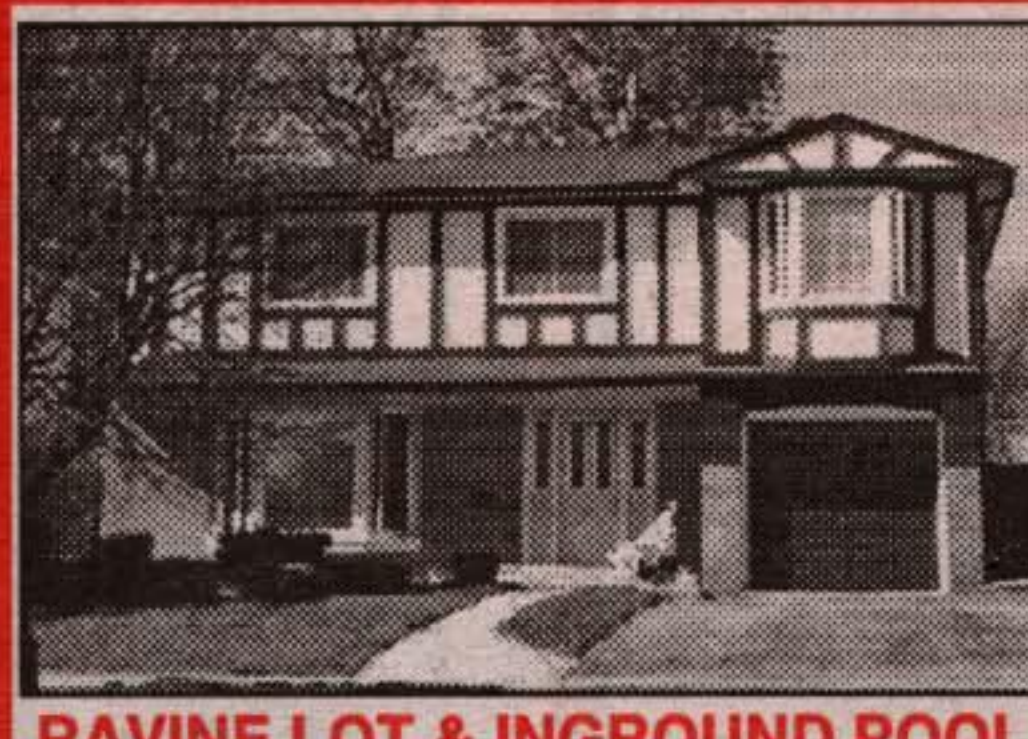
RAVINE LOT & INGROUND POOL

This 3 bedroom bungalow is located in the Quaint Village of Glen Williams. Features include: most windows replaced, eat-in kitchen, formal dining room and good sized yard. Priced to sell at $149,900. Call Dave Krause* to view.