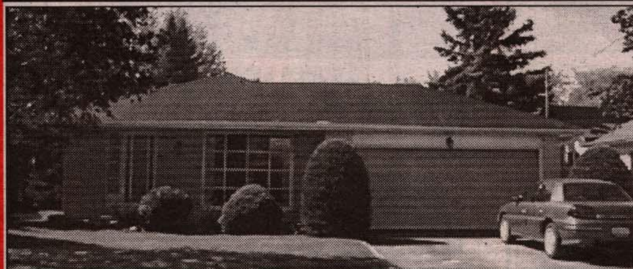
TRUE RAVINE LOT IN GEORGETOWN

Not often an opportunity comes along to purchase a home on a 60x176 ravine lot on one of the prettiest streets in Georgetown. Don't miss it. This 4 level backsplit features a double car garage, 14x28 inground pool, gorgeous, gorgeous ravine lot. Kitchen & washrooms renovated in '92, woodburning F/P in familyroom with a wet bar and a great games room on the 4th level of this home. Hardwood & ceramic floors on the main and upper level. 2 pc. ensuite and large W/I closet in master. Priced at $339,900. Call Dave Krause* to view.