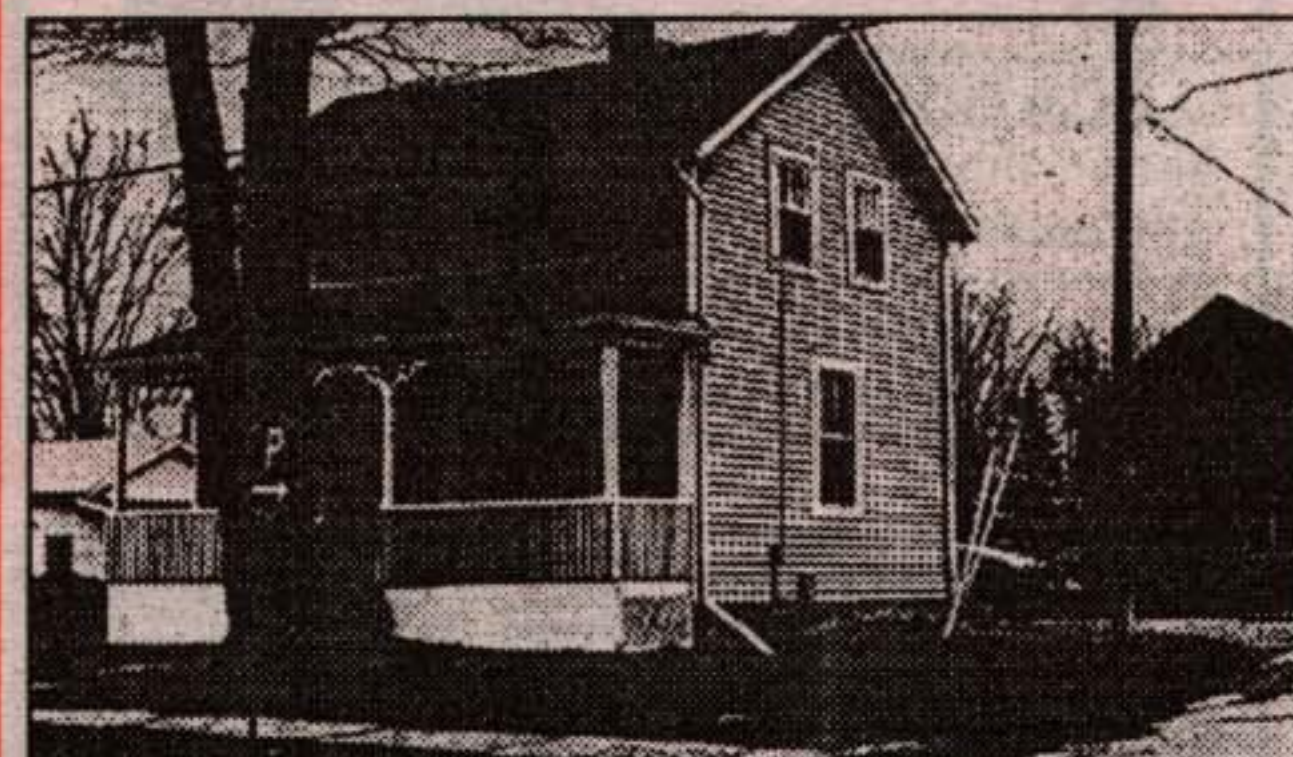
INCOME PROPERTY - $145,000

This property is located in Shelburne. It is legally duplexed with C1 zoning in the downtown area. There is an insulated shop 20' x 30' with loft and adequate parking. Good income. Live in one unit and rent the other one out. See it now.