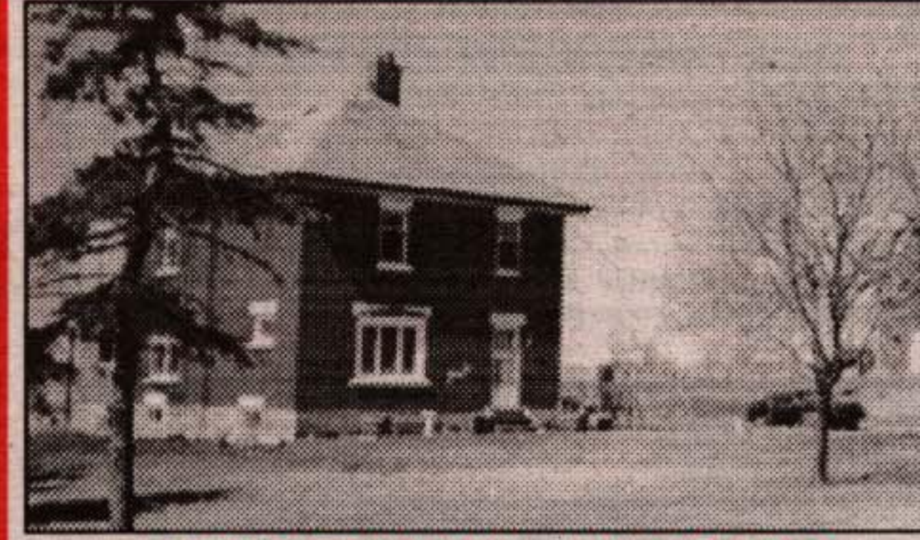
HORSE FARM - 99 ACRES $299,000

This property is located in Shelburne. It is legally duplexed with C1 zoning in the downtown area. There is an insulated shop 20' x 30' with loft and adequate parking. Good income. Live in one unit and rent the other one out. See it now.