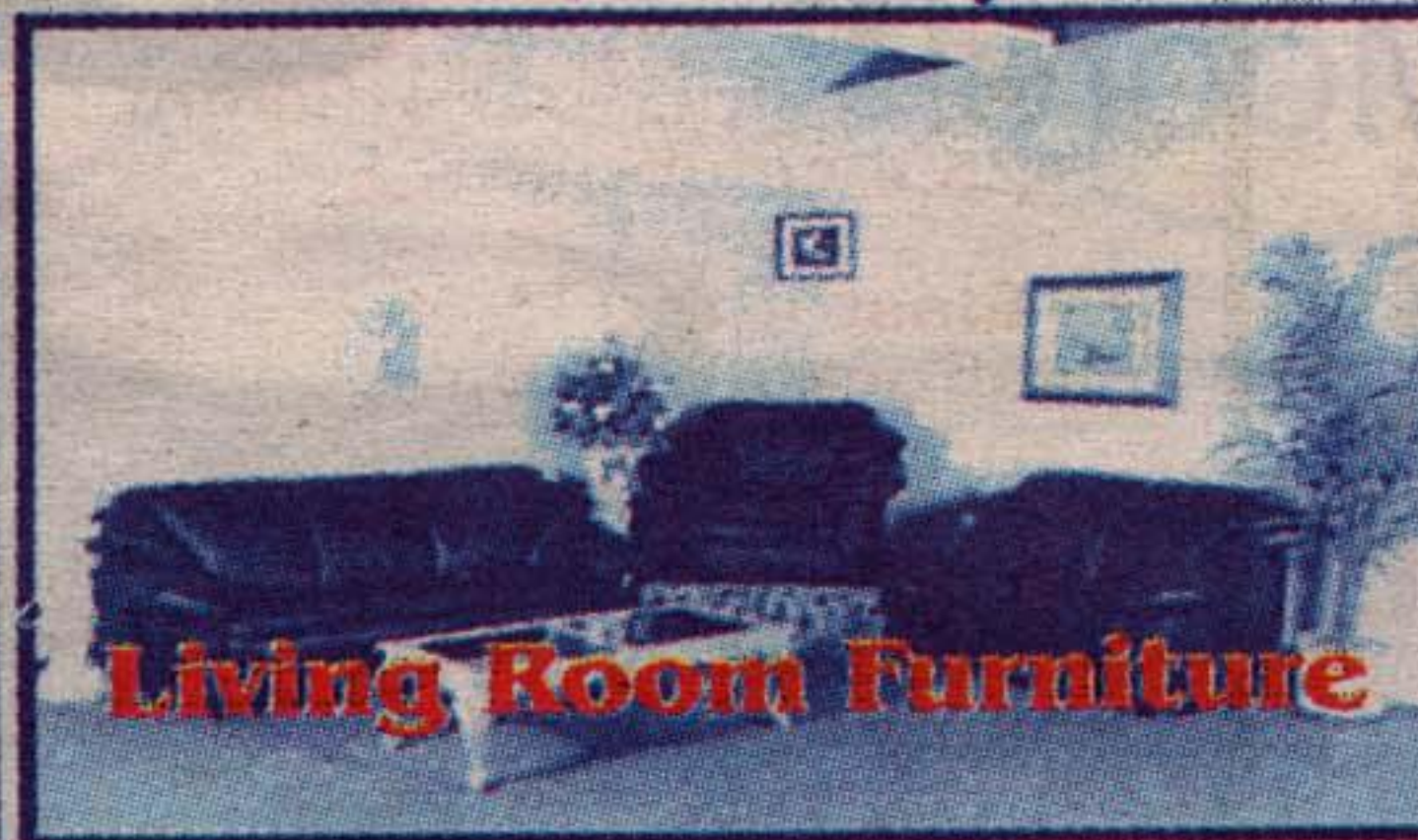
Living Room Furniture