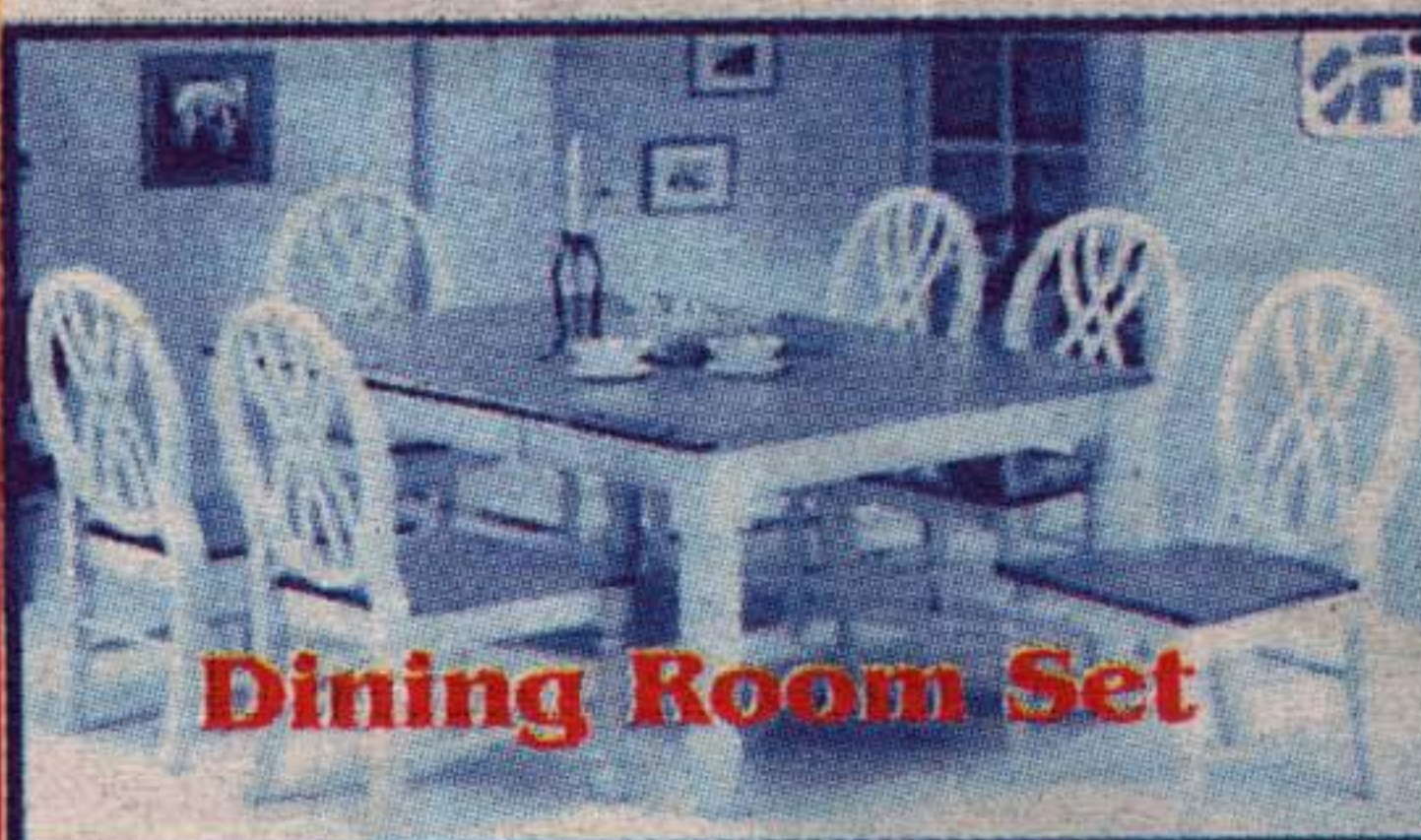
Dining Room Set