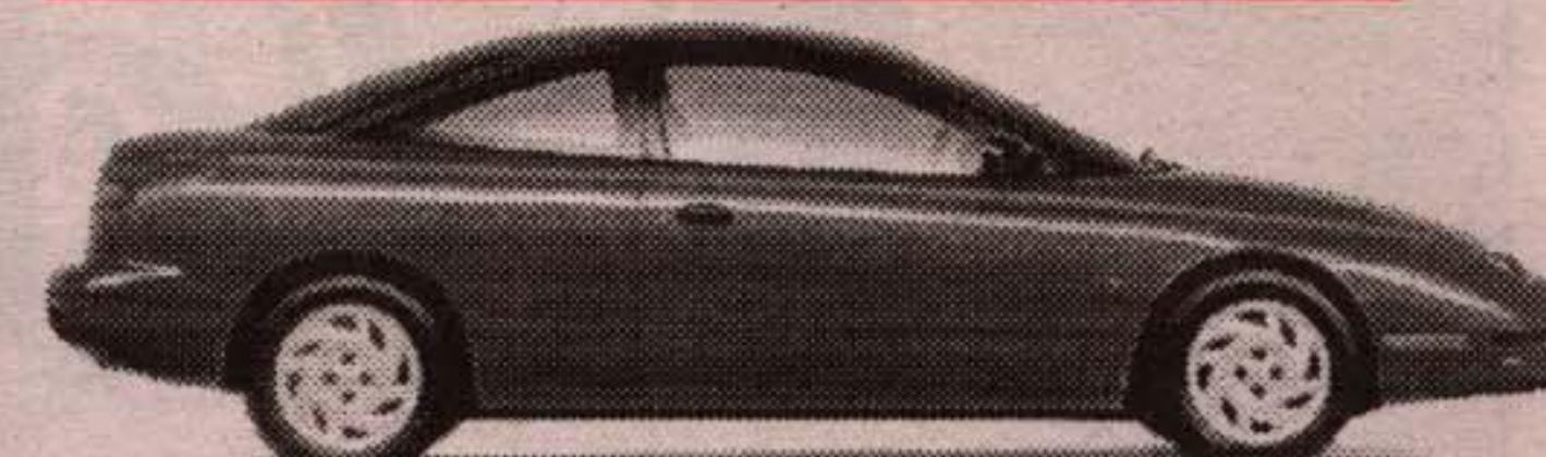
1999 Saturn SC1

$183/month with a $2,000 downpayment (MSRP is $14,903) including freight and PDI