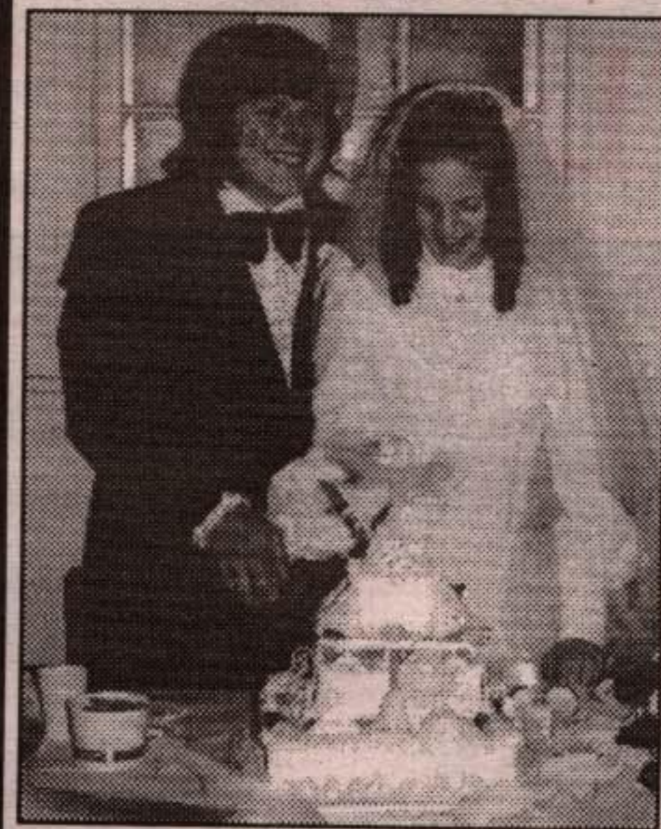
Do You Remember Them Best Wishes Only