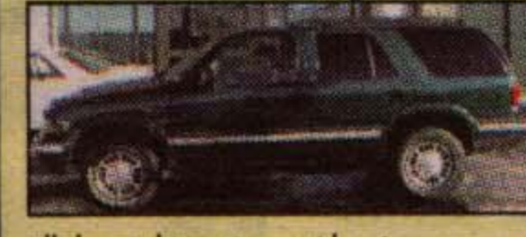
1996 GMC Jimmy SLE 4X4

All the right options, Aluminum wheels. 91,369 kms. Warranty. St. # 578108. NOW $21,995 LEASE $392.66*/mo.