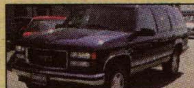
1998 GMC Yukon SLE

Very low, low mileage, No freight or air taxes. 23,396 kms. Warranty St. #730769 NOW $35,995 LEASE $549.43*/mo.