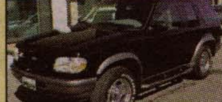
1997 Ford Explorer Sport 4x4

Sporty two door model, Good Mileage- all the right options. 65,806 kms. Warranty St. # C17960. NOW $23,995 LEASE $402.90*/mo.