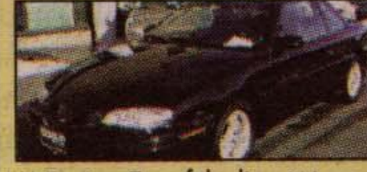
1996 Pontiac Grand AM GT

V6 Engine, Top of the line. Warranty St. # 773798. NOW $13,995 LEASE $312.26*/mo.