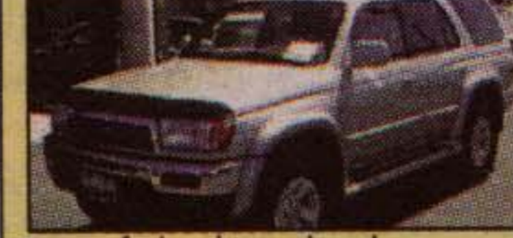
1996 Toyota 4Runner LTD 4X4

Top of the line, leather, power moonroof, immaculate. NOW $33,995 LEASE $622.64*/mo.