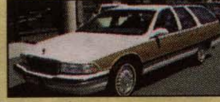
1996 Buick Roadmaster Wagon

Rear wheel drive, Very clean with all the right options. Warranty. St. # 414151. NOW $19,995