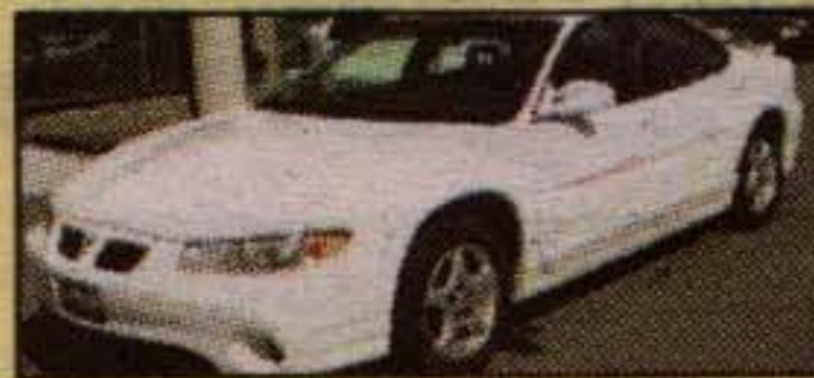
1998 Pontiac Grand Prix GT

Power Seats, Heads Up Display. 65,123 kms. Warranty St. # 231282. NOW $23,995