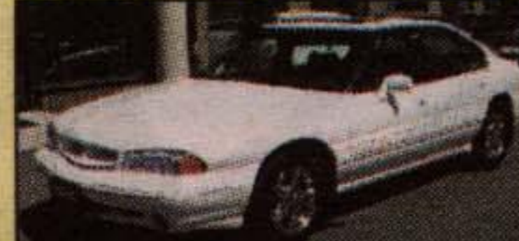
1997 Pontiac Bonneville SE

One of a kind, only 26,000 kms!! Chrome rims, leather, power moonroof. St. #24,995. NOW $24,995 LEASE $440.91*/mo.