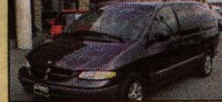
1996 Dodge Grand Caravan SE

Grand "SE" Model, Dual sliding doors, aluminum rims. Warranty. St. # 671466. NOW $16,995