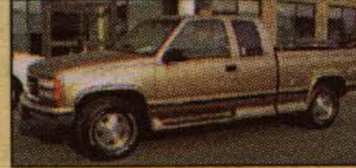
1996 GMC SLE X-CAB 4X4

Running board package, CD player & Power seat, Leather. Warranty. St. # 516971. NOW $24,995