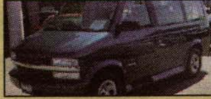
1997 Chevrolet Astro Van

Most essential options, Eight passenger. Warranty St. #207942 NOW $16,995 LEASE $352.46*/mo.