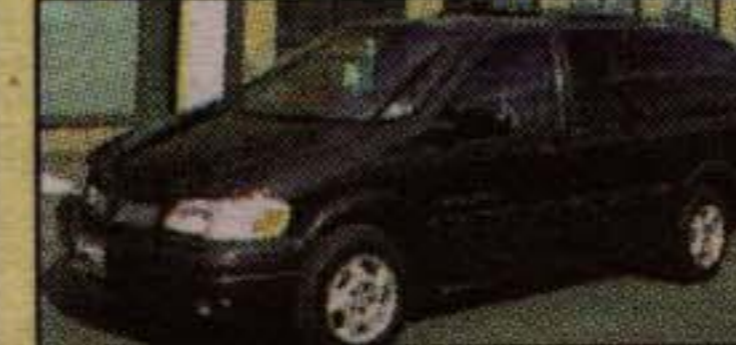
1997 Pontiac Transport

Power windows/locks, Extended model. 81,070 kms. Warranty St. # 297151. NOW $17,995 LEASE $335.08*/mo.