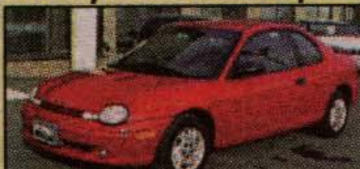
1997 Plymouth Neon Expresso

Top of the line "Expresso" model. 44,801 kms. Warranty St. # 175023 NOW $11,995 LEASE $227.24*/mo.