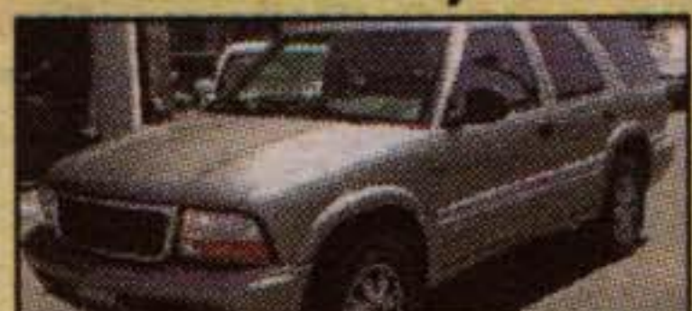
1998 GMC Jimmy SLT 4x4

Top of the line model, Leather, Very low mileage for year. 25,364 kms. Warranty St. #544022 NOW $29,995 LEASE $456.78*/mo.