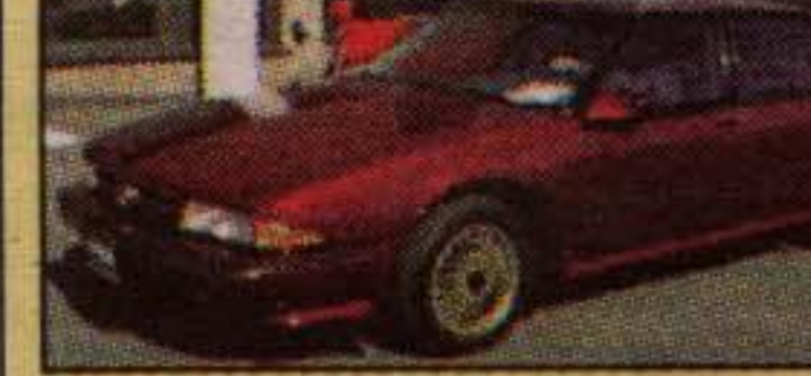
1990 Pontiac Bonneville SSE

Leather interior, Power moon roof. Warranty St. # 264912. NOW $7,995