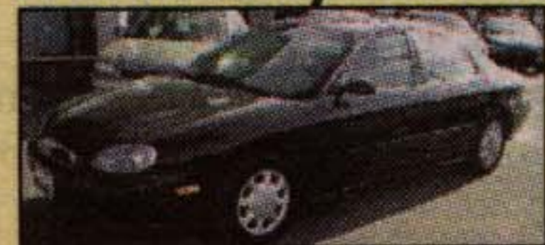
1997 Mercury Sable GS

Power windows, locks, 4 brand new tires. Warranty. St. #617856 NOW $11,995 LEASE $265.31*/mo.