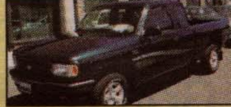
1997 Mazda B400 SE Extra Cab

Very low, low mileage, X-Cab with air conditioning. 28325 kms. Warranty. St. #M26030. NOW $17,995 LEASE $317.02*/mo.