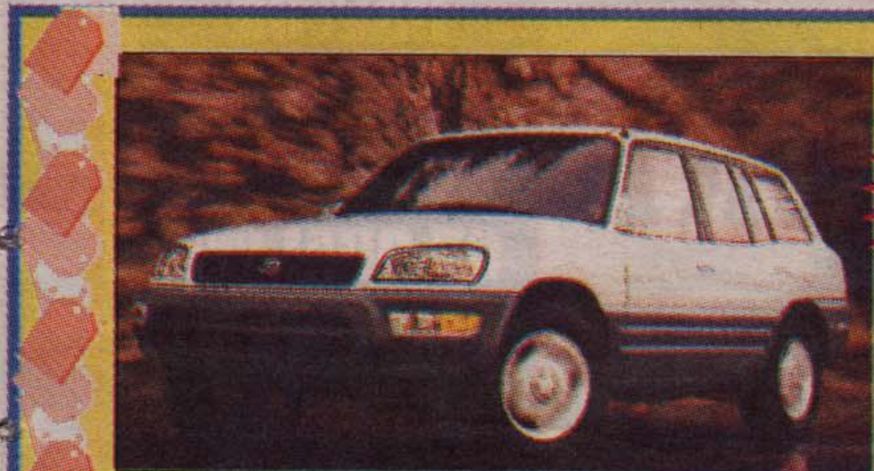
Nicely equipped for $26,250 MSRP