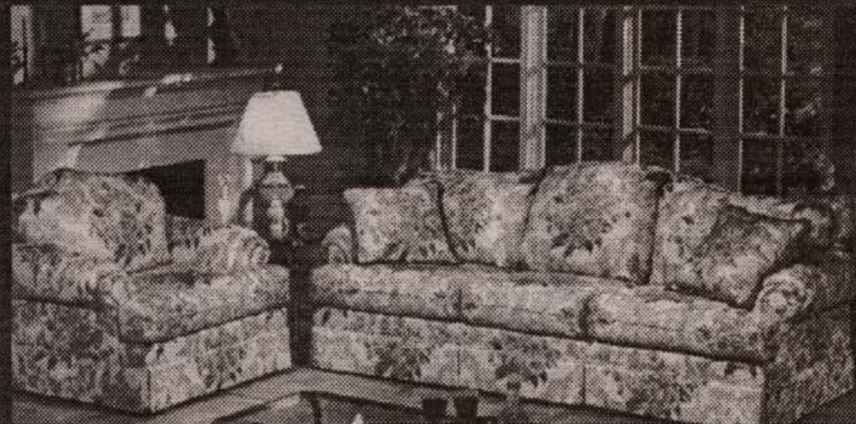
Not exactly as shown

Everything in the store is reduced to sell!!