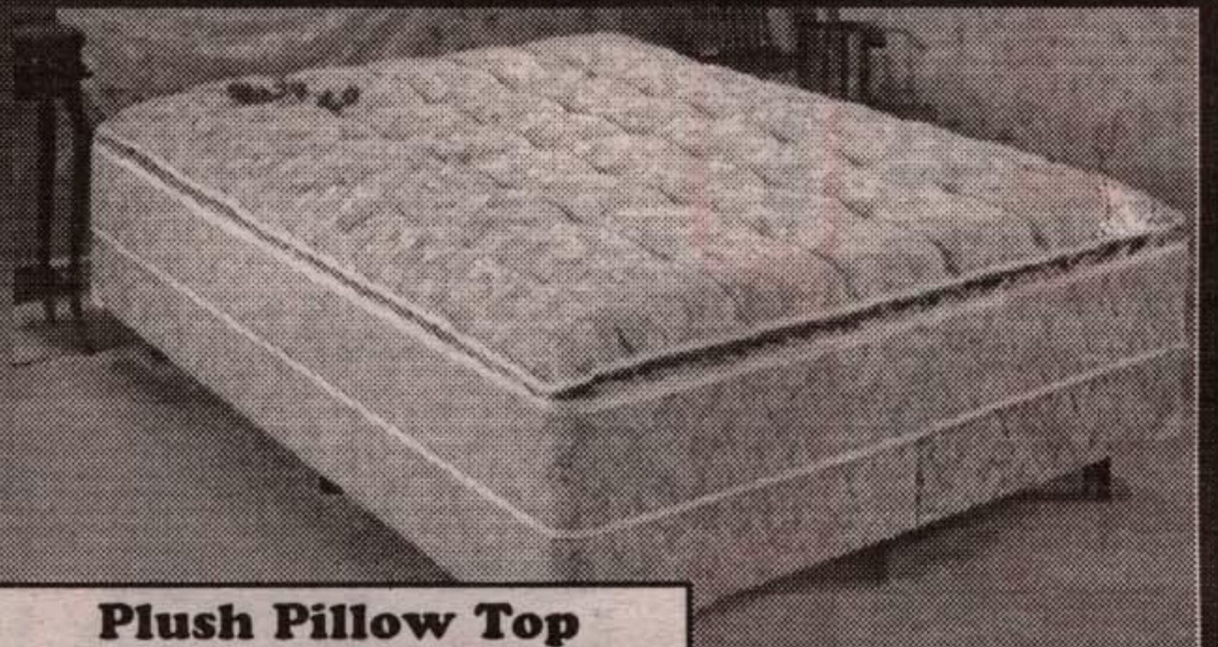
Not exactly as shown

Plush Pillow Top THERA-PEDIC WORLDWIDE QUEEN BOX & MATT Reg. $1299 Now $699