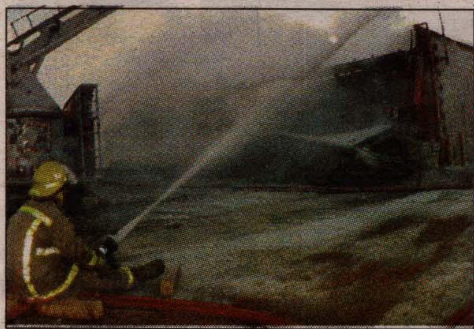
Two young Georgetown men have been charged with arson after an investigation into the January 10 IGA fire determined the blaze was deliberately set.